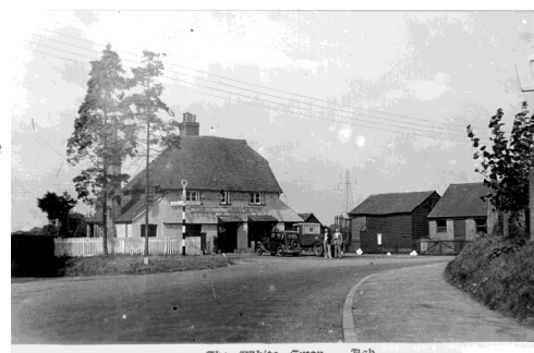
The White Swan. Pub.

According to the WI book of Ash (1957), “The original inn was smaller and there were no counters in those early days. Under where now the bottle shelves are erected there was a large open fireplace and customers sat on barrels arranged in a semicircle around the fire. The drinks were brought up from the cellars in jugs. We know that over a century ago it was the meeting place of the Manor Courts. Just near the counter of the present saloon bar there is a small door in the wall which when opened discloses a sizeable cavity which suggests that it was a hiding place used in days gone by for those seeking refuge or as a place for hiding valuables. Great oak beams and low ceilings and doorways are a feature of the house. In 1938 a fire caused quite a bit of damage. A fire in the chimney was the cause of the general conflagration. The Eynsford Fire Brigade attended, the firemen finding their task made the more arduous by reason of the fact that several massive beams were well alight, through which they had to saw. When the flames had been mastered there were found in the roof piles of straw, the remains of the old thatch, which had not even been set alight”.