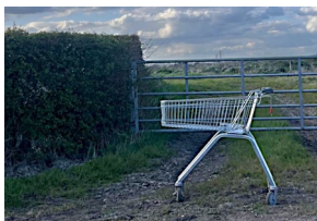
Presumably abandoned in Ripe by someone who thinks they've got GPS and electric motors to find their way back to the supermarket.