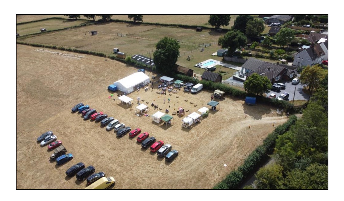
An ariel view of the recent event held on the Fete field.