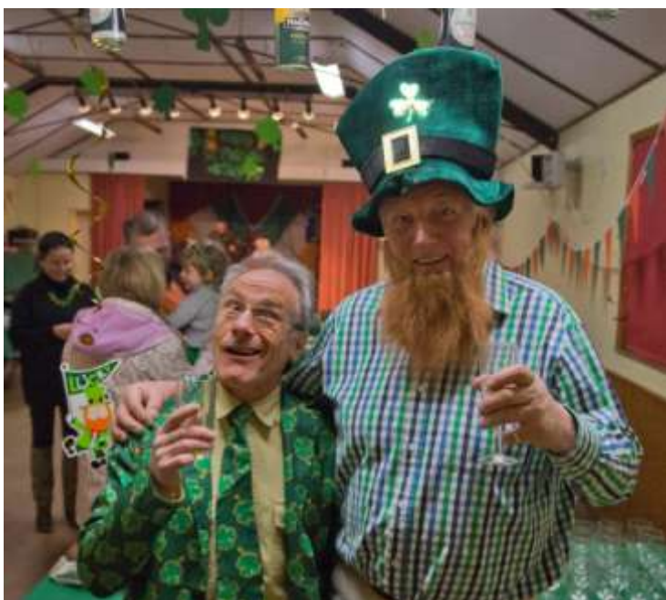
More pictures from the Irish themed evening in Grafty Green Village Hall on Saturday 17 th March