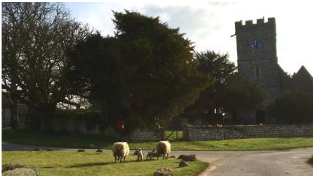
Seasonal pictures taken near Boughton Malherbe Church of some new arrivals and 'Shepherd Tony King'