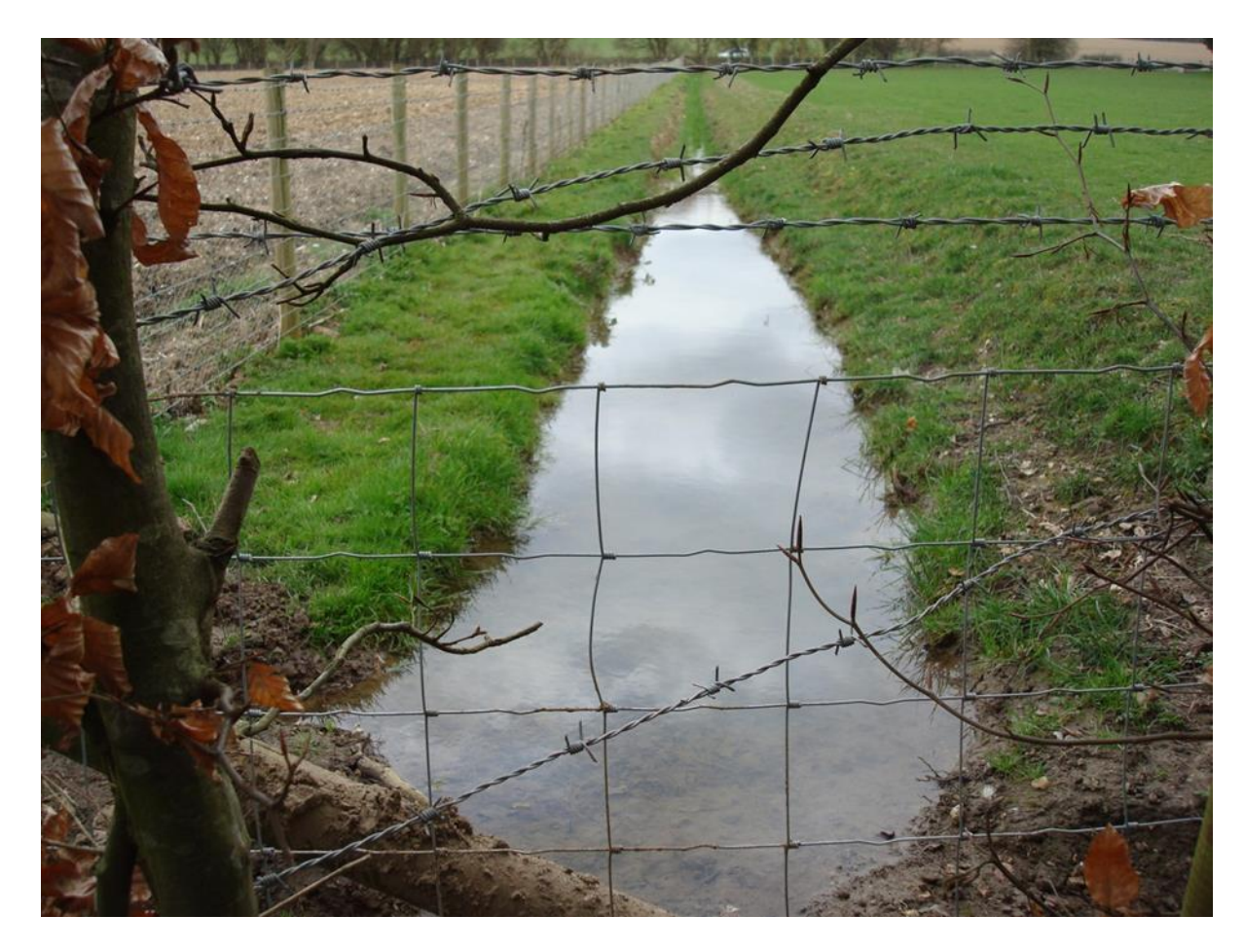
Bourne stream running down Eastern Field boundary of Tanyard Farm North development from A 20