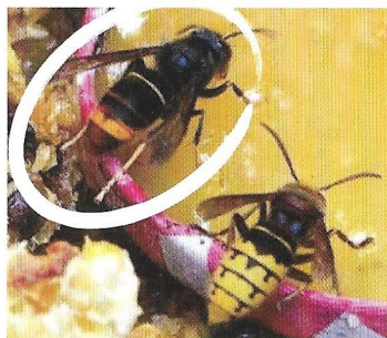
Our Native Hornet is YELLOW and not a problem

in Summer and Autumn look out for huge nests usually high in a treetop but sometimes dangerously in a hedge a house roof or in an attic