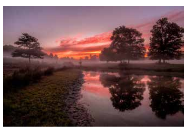
Lord's Piece by Jamie Fielding

Golden caramel fields, rusty red leaves, purple heathers and gorgeous pink sunsets – all the spectacular colours that make autumn special.