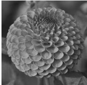
Miniature Ball /Pompom