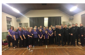
The players and committee members of the Swinton and District Excelsior Band

As I write this January is almost over and the start of the New Year has been as busy as the end of the old one. We have already performed our first concert of the year at Welburn Village Hall and are busy preparing for our next one which is at St Michael's Church in Malton on Saturday Feb 10th.