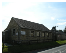
Swinton Reading Room And Community Hall