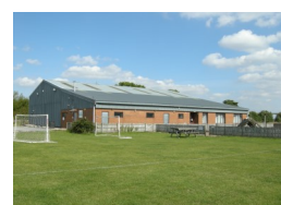
BSA Sports Centre