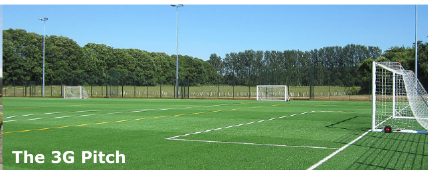
The 3G Pitch