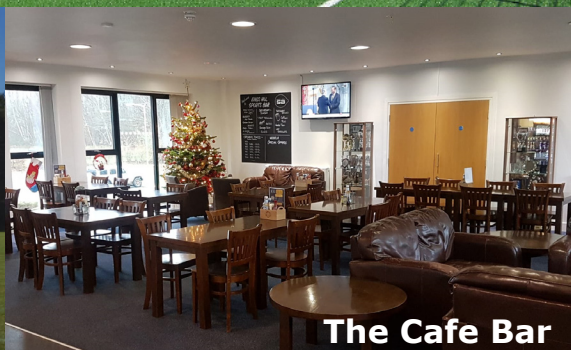
The Cafe Bar

Our Pavilion houses a licenced Sports Bar Café with viewing areas to pitch 1 and our 3G pitch. We can provide match viewing facilities to view your performance in the comfort of our café. Our food is cooked and prepared on site by our friendly catering staff. The Cafe holds up to 60 people and is wheelchair accessible.