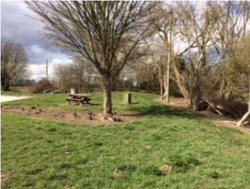
Figure 6 Riverside Car Park and Picnic area