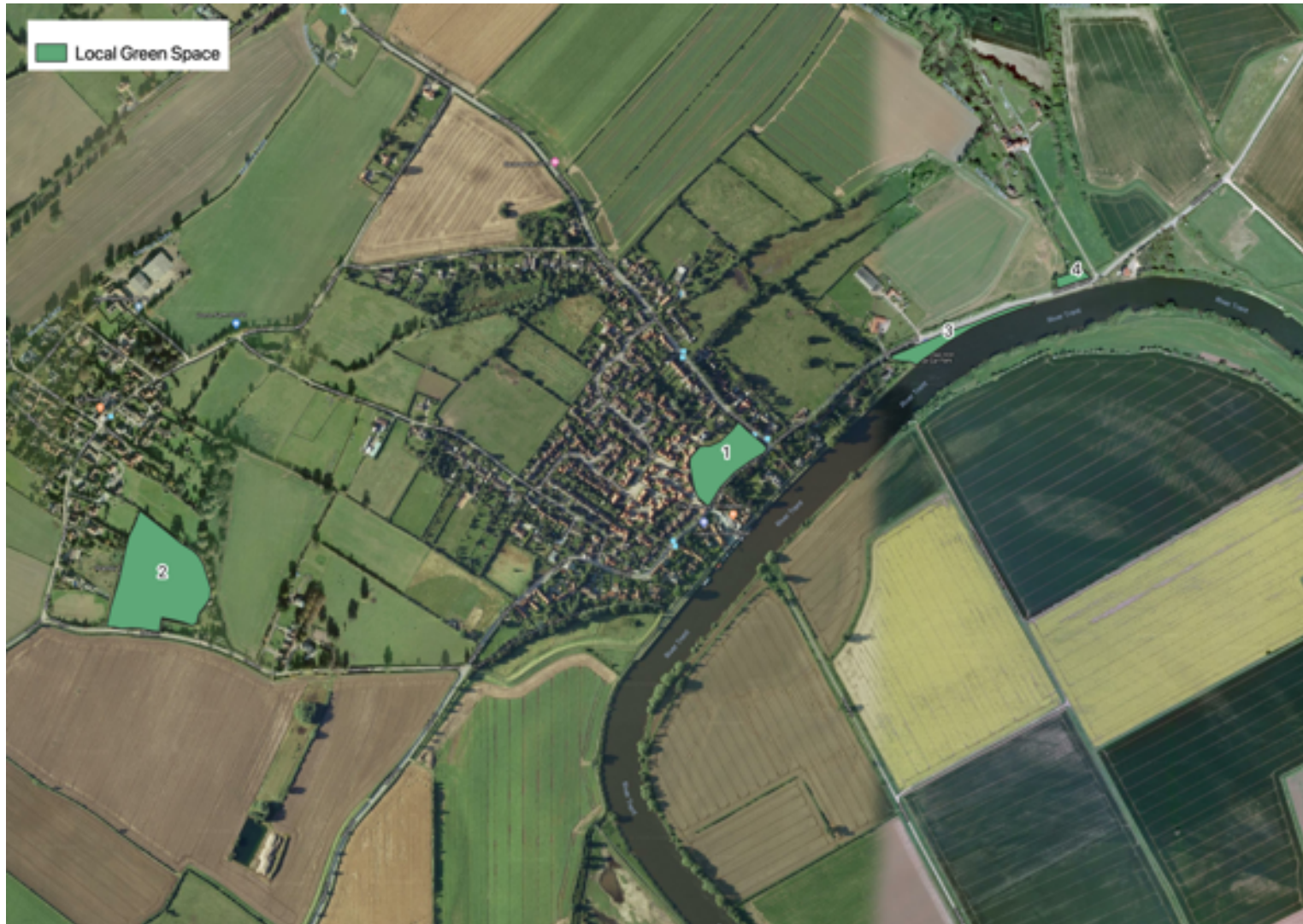
Figure 13 Local Green Space Map