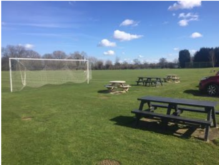
Figure 3 Arthur Radford Sports Ground