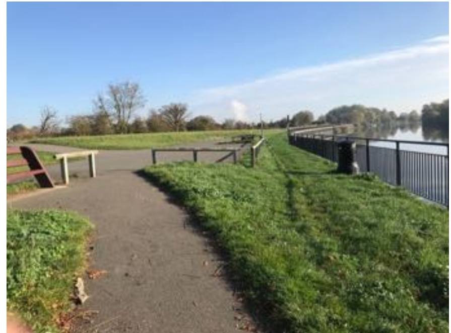
Figure 7 Riverside Car Park and Picnic area