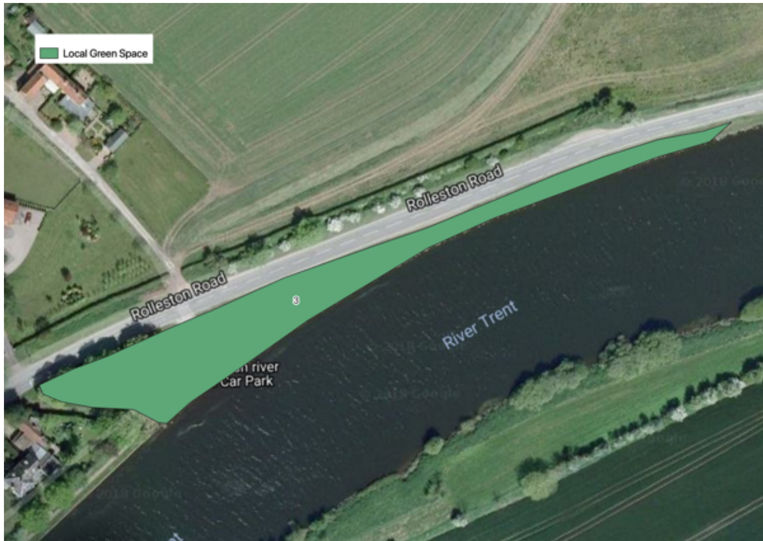
Figure 9 Riverside Carpark and Picnic Area Map