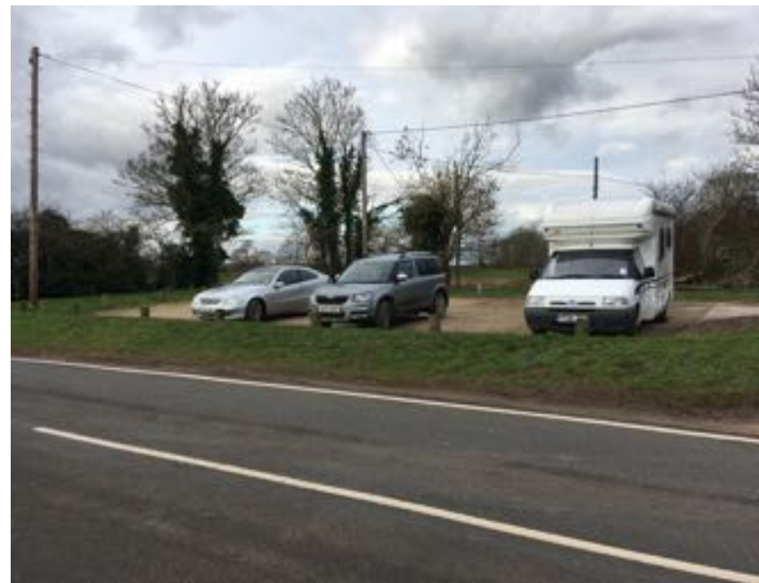
Figure 11 Fishermen's Car Park Local Green Space view from (2)