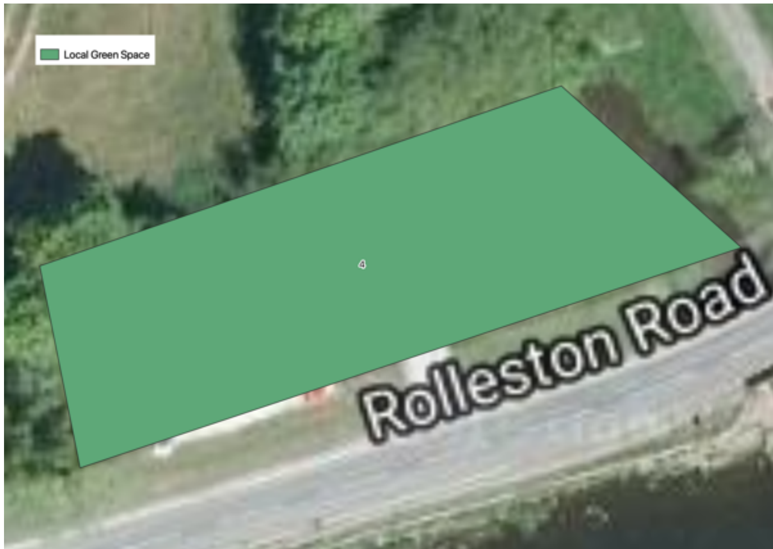
Figure 12 Fishermen's Car Park and Picnic Area Map