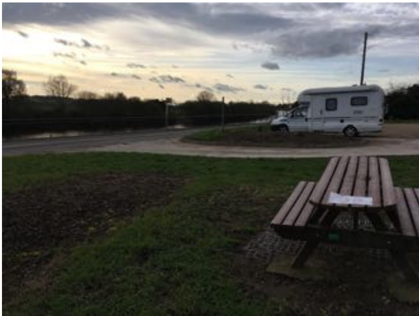
Figure 10 Fishermen's Car Park Local Green Space view from (1)