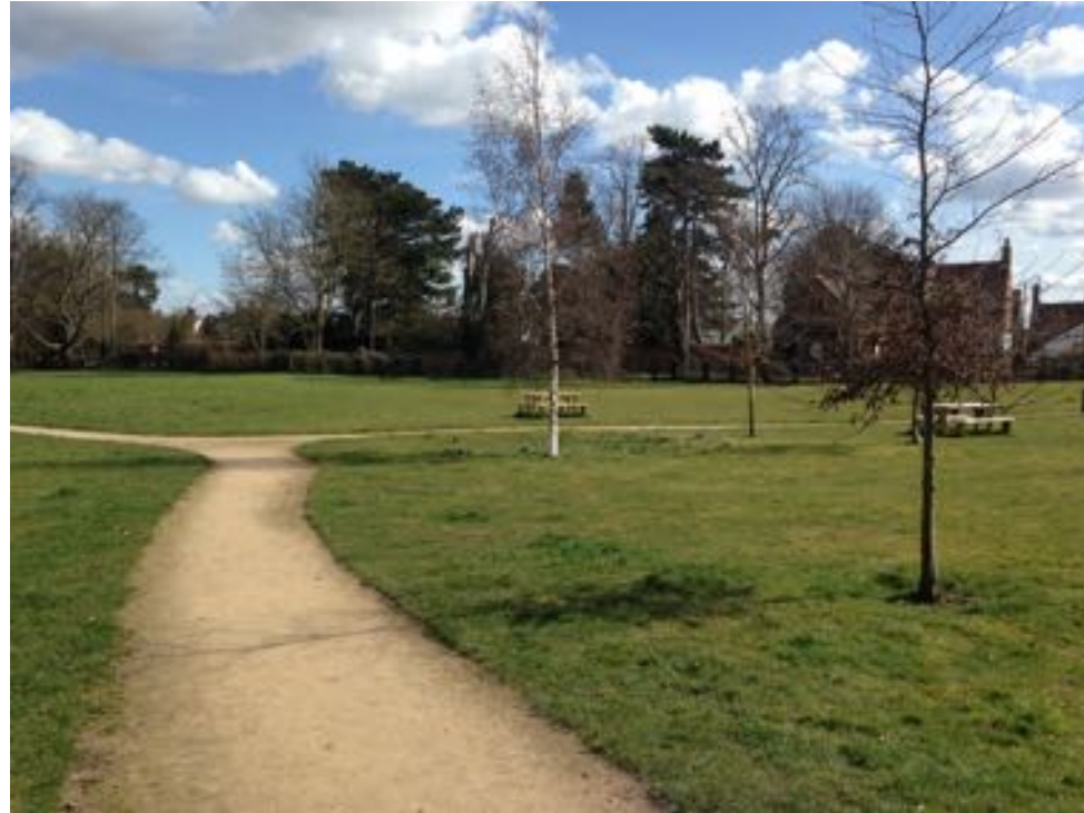
Figure 1 Village Green