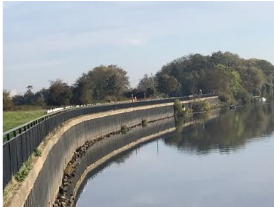
Figure 8 Riverside Car Park and Picnic area