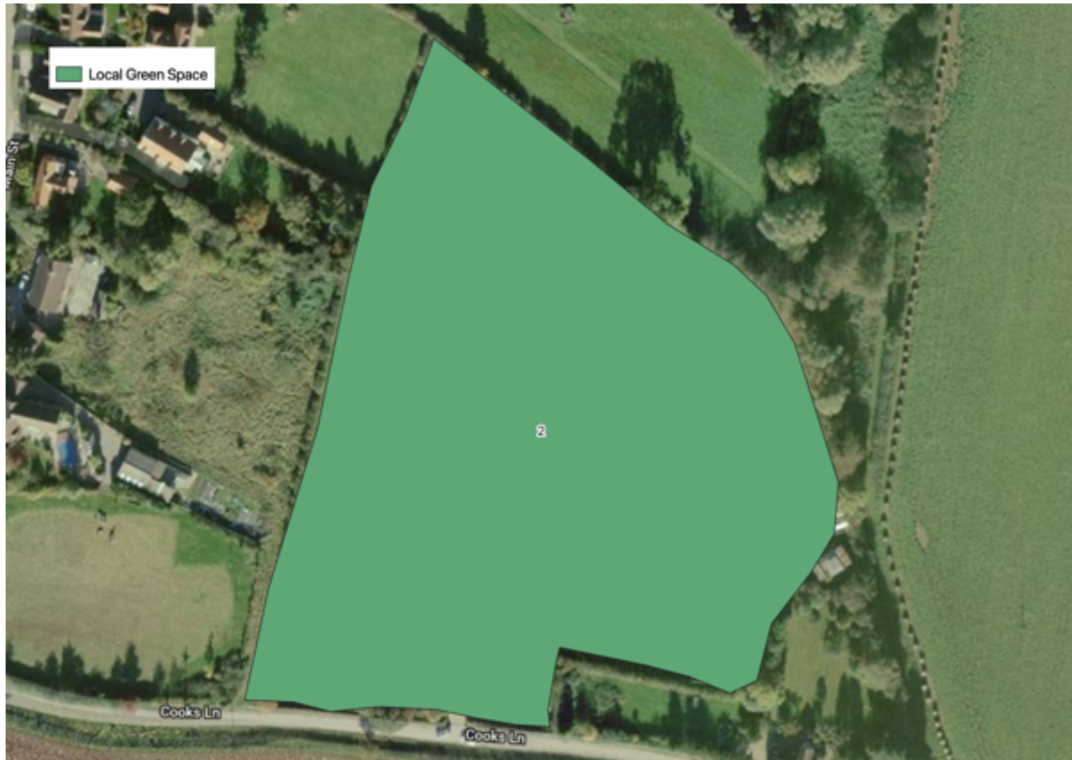
Figure 5 Arthur Radford Map