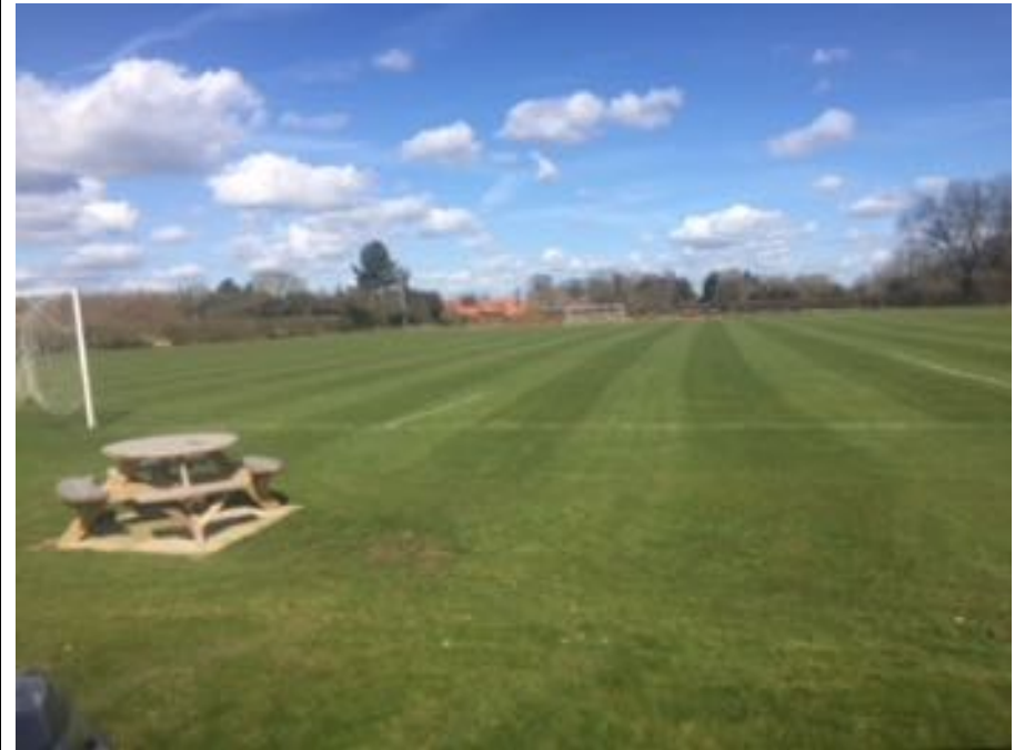
Figure 4 Arthur Radford Sports Ground