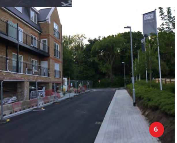
6. The second exit road from Ryewood has opened although it almost immediately had 3 way traffic lights for roadworks at the junction.

5. If there's a world record for how many different arrangements of bollards and barriers you can have on a mini roundabout, then the Station Road junction will be getting a gold medal.