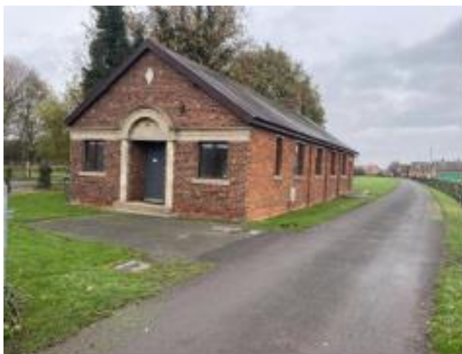
Barnby Moor Village Hall

Barnby Moor Village Hall is on The Drive/Kennel Drive.