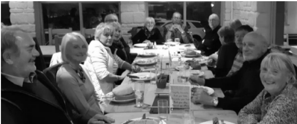
Mabe and Primelin's Twinning Association members enjoyed an evening at Country Skittles

The trip had been timed to coincide with Flora Day, which our friends had wished to visit for a long time. The weather was unseasonably cold and windy,