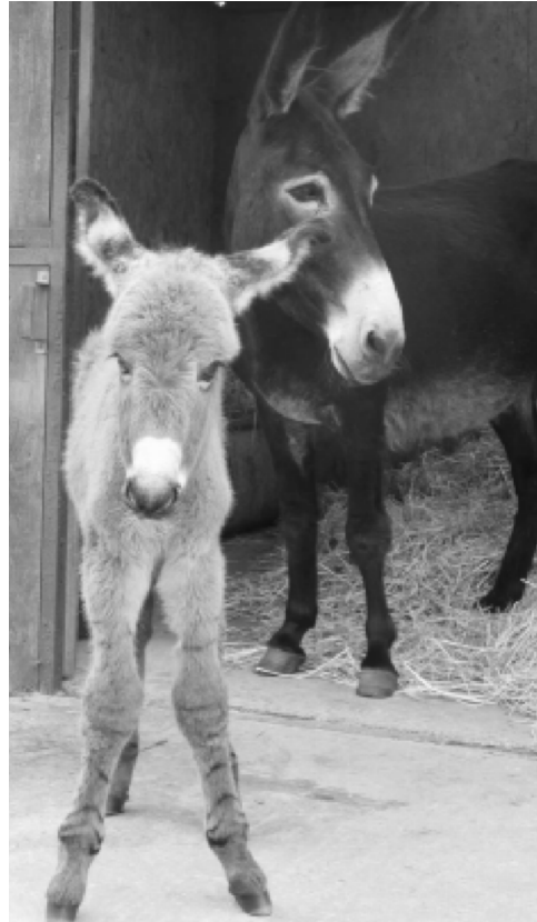
Sophia and her new foal

She is very underweight and will need lots of specialist attention and treatment to ensure she is healthy enough herself to care for her son. Poor Sophia will have had many foals all cruelly taken from her at a young age, but this time will be different and she and her newborn will be free to live their lives, together at Flicka, safe and happy.