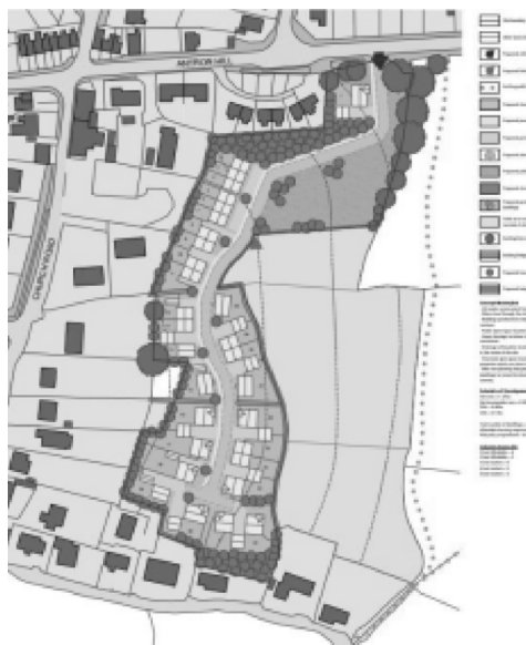
The plans to build on land south of Coronation Cottages

In an online portfolio on South West Strategic Developments' website, the developer described