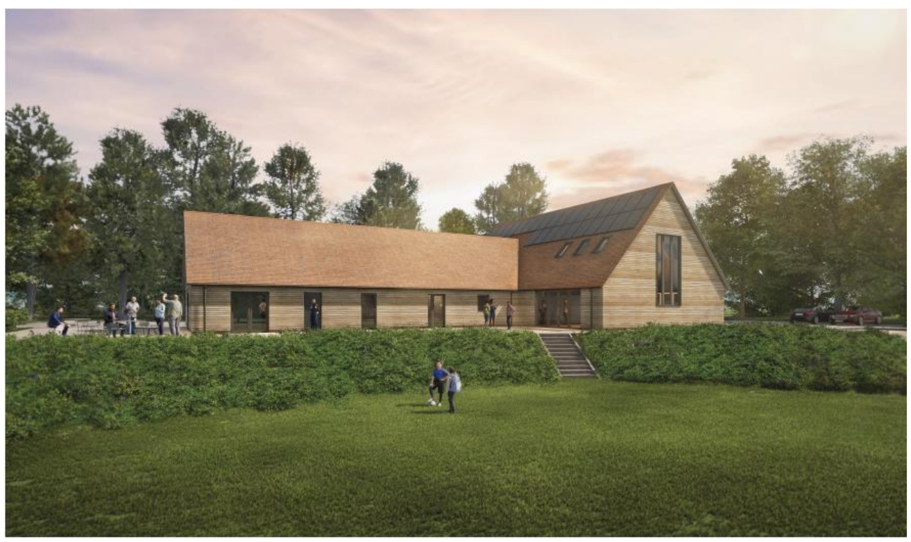
Figure 4 Proposed East Elevation