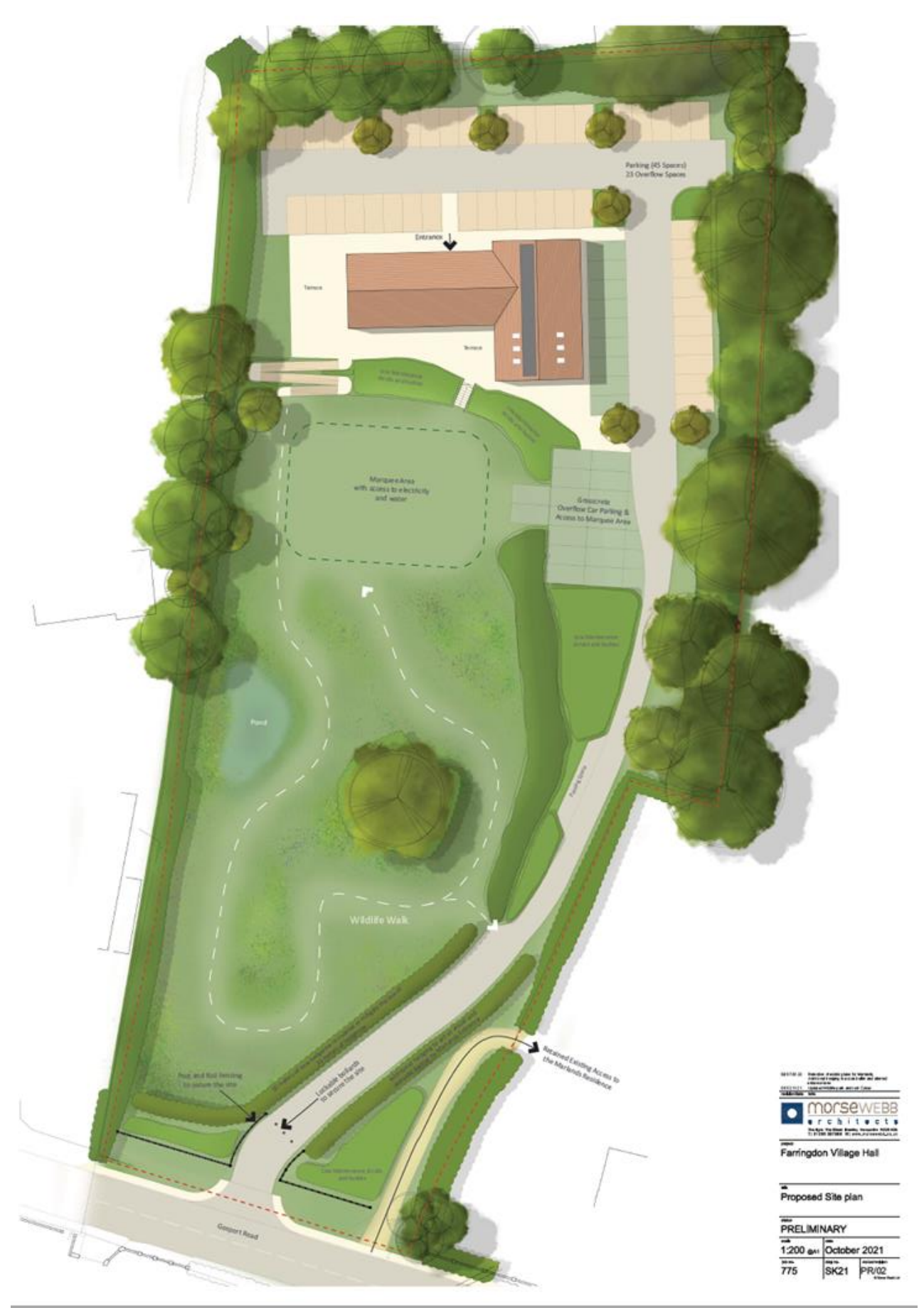
Figure 6 Proposed Site Plan