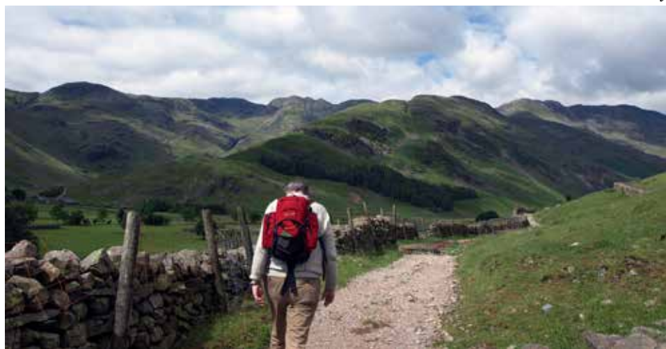
Photo: Langdale Fell