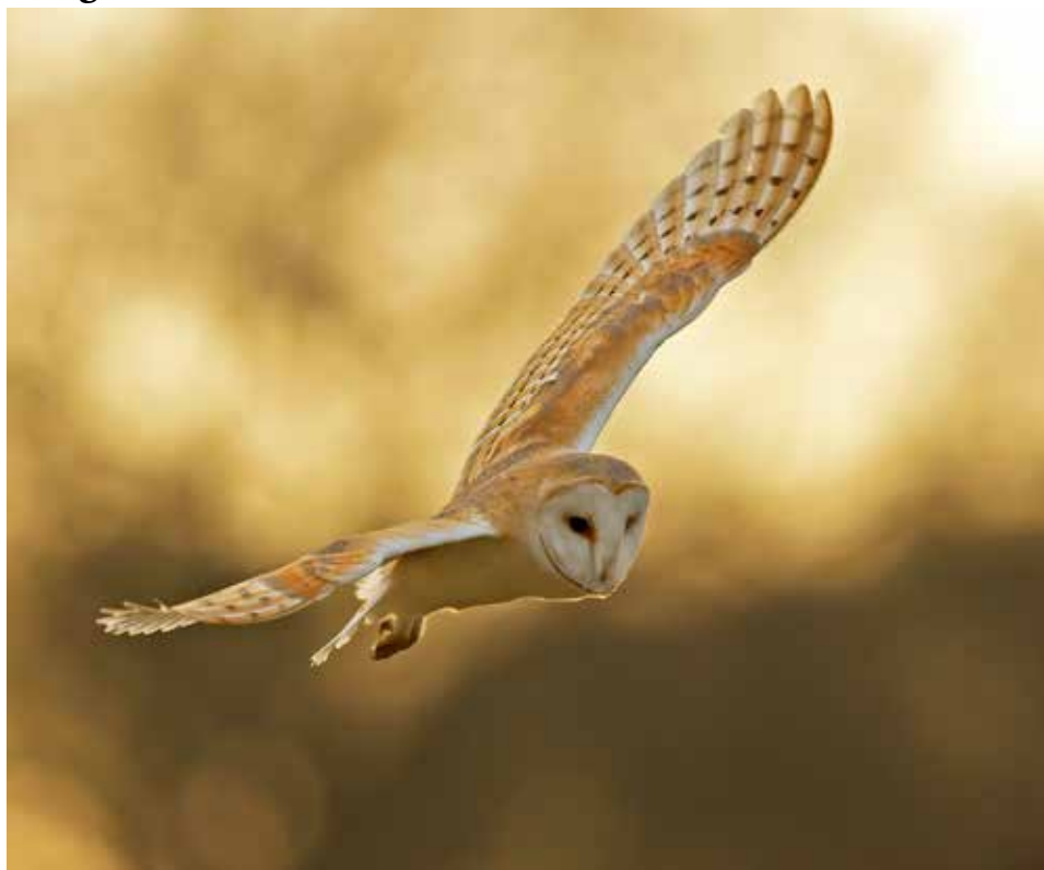
Barn owl photo © Russell Savory

If you've ever caught a glimpse of a pale, silent shape drifting over a Hampshire meadow at dusk, you may have been lucky enough to witness one of the region's most captivating residents: the barn owl.