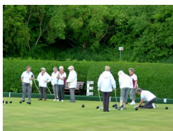
Flat Green Bowls

Web Sites for the leagues we participate in are as follows.