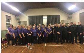
The players and committee members of the Swinton and District Excelsior Band

Sixth place at the North of England Championships has ensured our continuing presence in Section 3 for at least another year meaning the contest season has ended well. And we can now concentrate on preparation for the summer concert season.