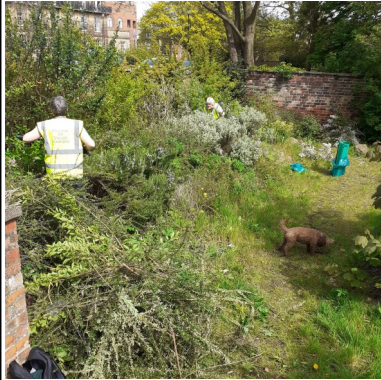
Debs and Jane hard at work clearing the border with Saffy (deputising for Harper) helping—sort of!

As you can see from this picture the border area near The Crescent entrance is very overgrown so that was the focus for the work party on 5 May. Although only a couple of volunteers were able to attend but they did manage to make a start on clearing border.