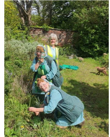
Thank you Green-Fingered Gals

But part way through the session we were honoured to have two guest gardeners come along to help. The amazing "Green-Fingered Gals" popped over from the Scarborough Streets festival to give us some timely and well needed advice which we found invaluable and which helped us to continue our work that morning.