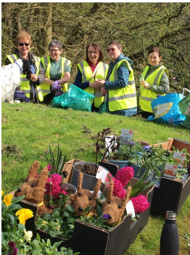
The planters and litter pickers

Following the meeting, it was the start of some serious pruning in the Peace Garden by a couple of our members, with others planting along the border near Woodend, joined, as always, by the usual litter picking crew. All in all 6 bags of rubbish, 5 bags of garden waste and lots of plants planted! Luckily we had Harper with us again to make sure we kept up to the task!