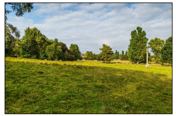
View of parkland from north churchyard extension