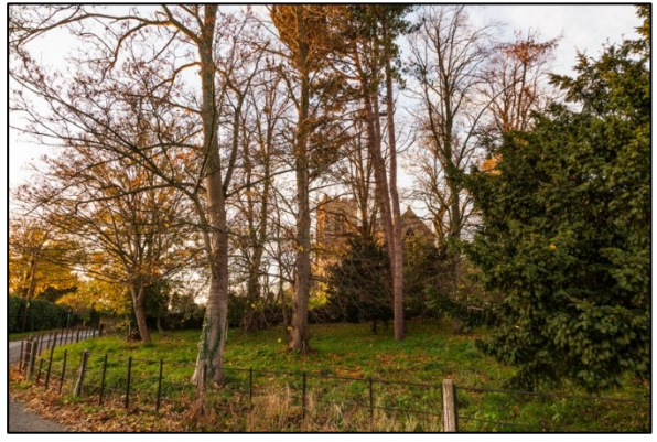
Spinney from the north