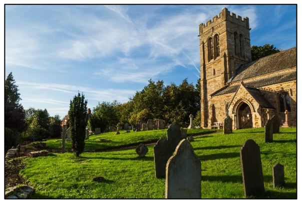
Churchyard looking west