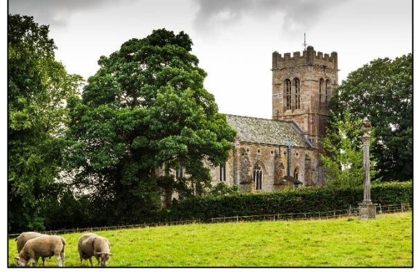
Churchyard and extension seen from northeast

The churchyard, together with the small woodland 'spinney' to its east, provides an array of favourable habitat for bats/ nesting birds and selection of wildflowers.