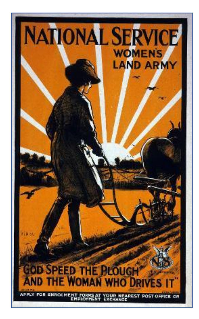
Iconic recruitment poster from WW1

scarcity of labour.' Whether a labour shortage arose as the war progressed is not recorded. However, from 1916 onwards the Newark Rural Tribunals were kept busy hearing the pleas of Collingham and Brough farmers and tradesmen desperate to keep their male employees on their books. The please often fell on deaf ears as the panel told the men to use their wives and daughters instead.