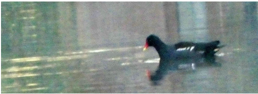
Moorhen on a misty morning

We took a walk around our favourite local lake in late December to shake off post Christmas lethargy and get some gentle exercise. It was one of those rare winter days when the air was still, no branch stirring and the surface of the water like glass. Ideal conditions for bird watching then; well no; there were very few birds about, a few great crested grebe, some coots, a moorhen and no geese. The lake was bank high with water spilling over from the swollen river and we wondered if, with no shallows available, dabbling ducks had moved off the lake and onto flooded pastures.