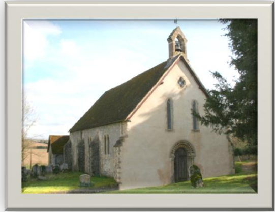
St Mary's Church, Vernham Dean

The church was a riot of red, white and blue during the Queen's Jubilee celebrations this year, when it hosted the village flower festival and thanksgiving service as well as a drinks reception which was the start of a wonderful weekend for many villagers.