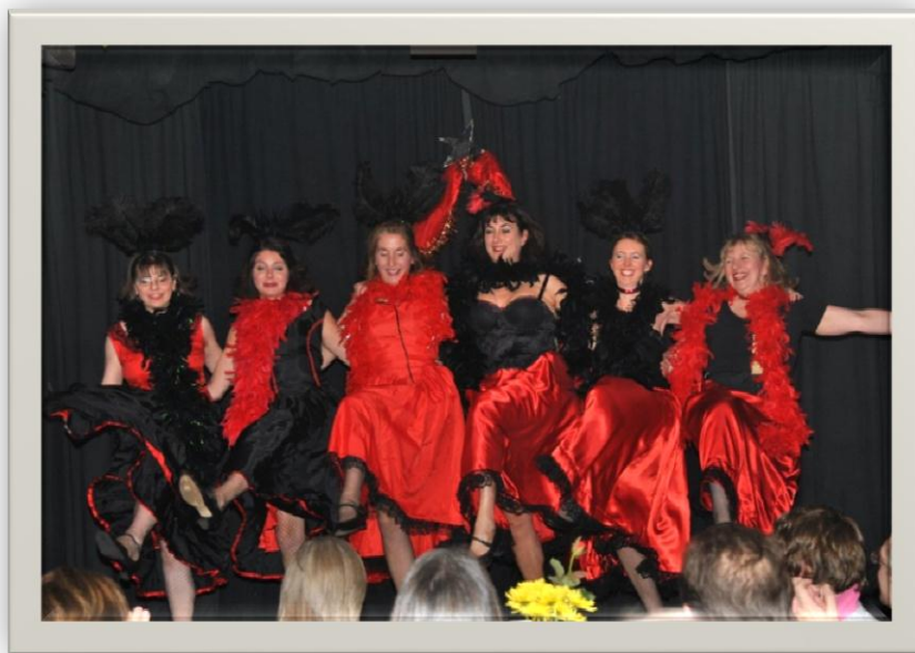
A lively scene on stage in the village hall