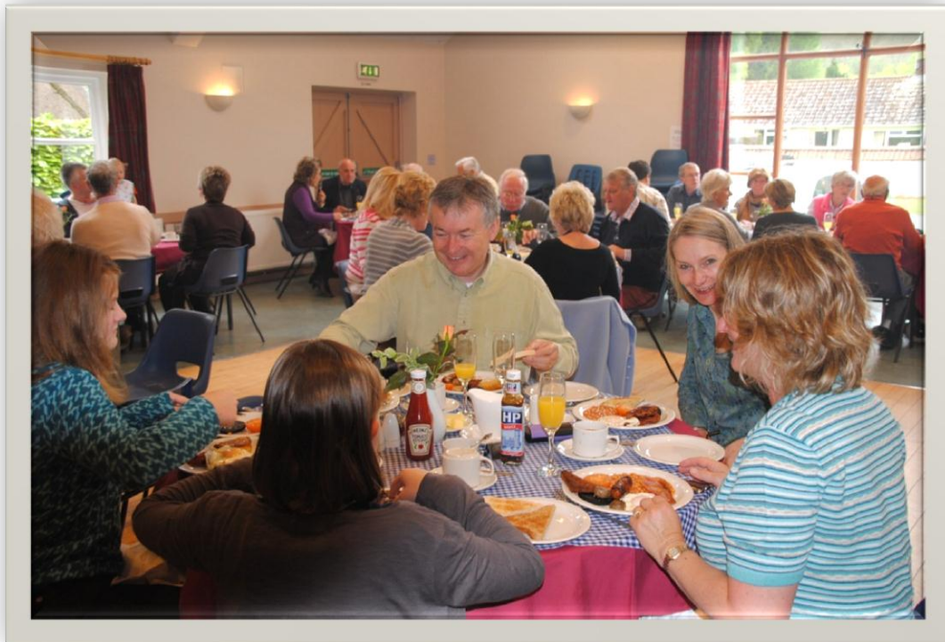
Locals enjoying the Village Breakfast

The Coffee Club warrants special mention as it plays a very important part in Vernham Dean, particularly for the older villagers, as it brings everyone together for a chat and a catch-up on a regular basis. All ages are welcome and it is great to see young mums popping in with their babies, much to the joy of some of the older residents whose families are living away.