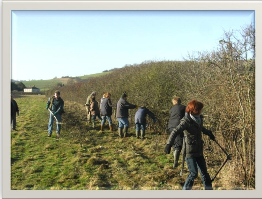
A working party of villagers at the Wild Flower Meadow

The villagers of Vernham Dean have a new project this year – the creation of a wild flower meadow for everyone to enjoy. This is a true village project with working parties organised on Sunday mornings to clear intrusive blackthorn, cut back hedgerows, plant new hedging and remove derelict buildings. The site is almost ready for planting and an Oak tree has been planted to commemorate the Diamond Jubilee.