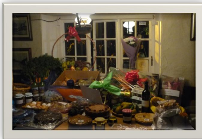
Produce for the Harvest Festival Auction held in The George

The pub arranged and hosted a Help the Heroes Auction that raised over £10,000.