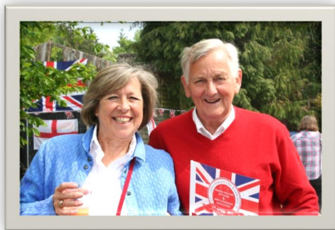
Flags, street entertainers and good cheer on the Royal Wedding day