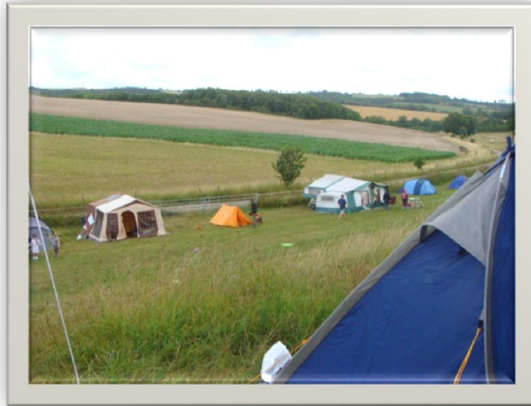
The Friday Club annual camp in stunning countryside