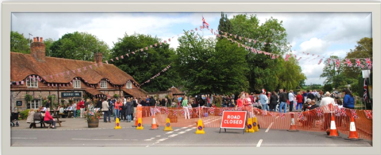
The Jubilee street party in full swing

Based on the success in 2011 of the village's Royal Wedding celebrations and the Golden Jubilee party ten years ago, hundreds of people took advantage of the good weather and the country's upbeat mood on the Monday to enjoy a street party.