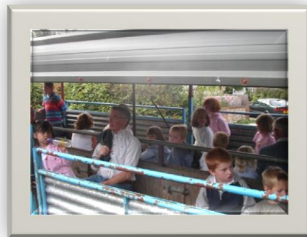
All aboard for the Friday Club outing to Combe