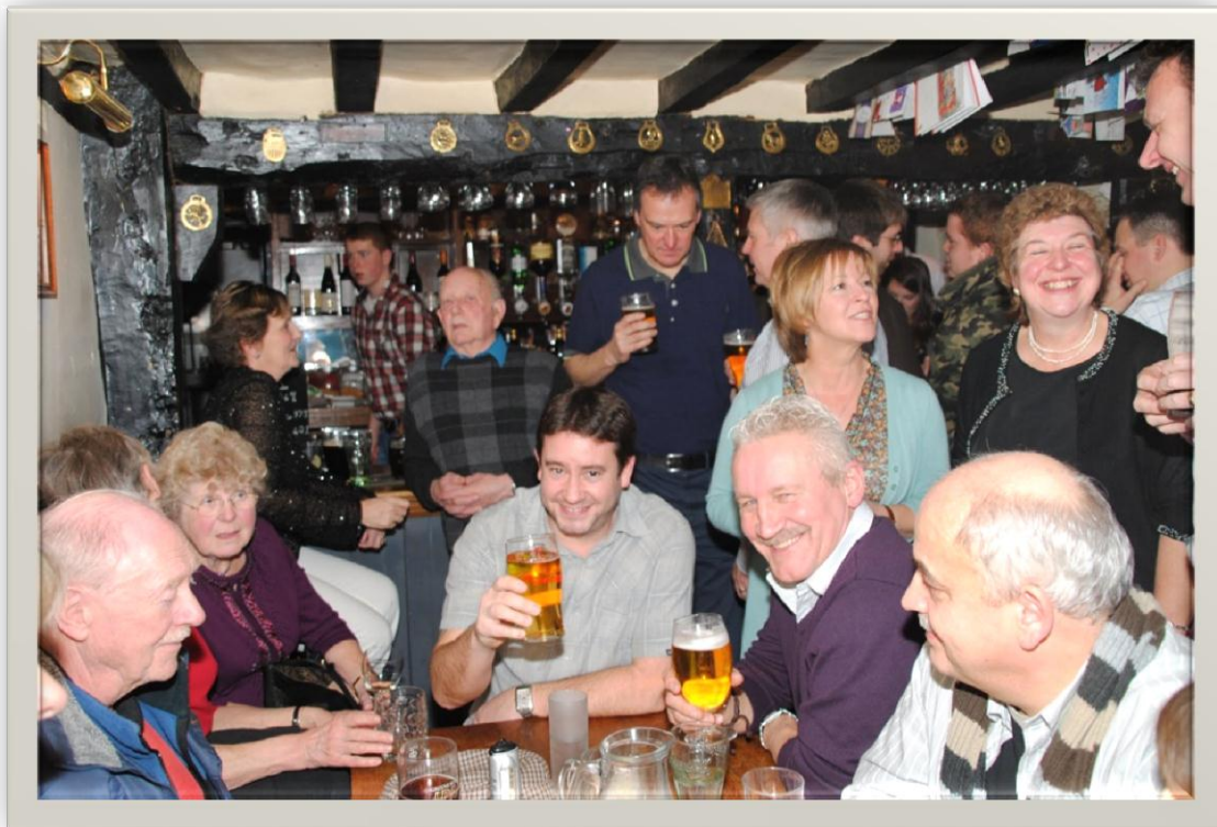
A typically convivial scene in the village pub

One of the best things about how the pub is run, and why it is so integral to the village, is that it is an inclusive pub where everyone is welcome and there is always someone to talk to: children are welcome; dogs are welcome (and usually given some meat by the chef); people feel relaxed enough to come in on their own, particularly women or single elderly, often widowed, people who come for the warmth, friendliness and company; people have made friends in the pub from all age ranges and backgrounds.