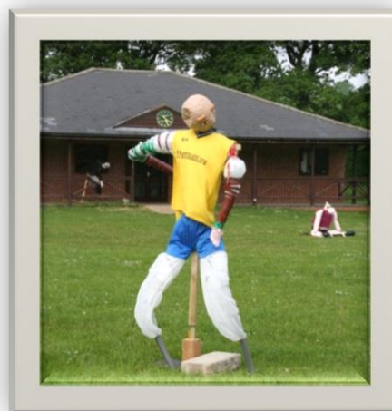
Two of the scarecrows that featured in the Calamity Games tableau for the Jubilee celebrations