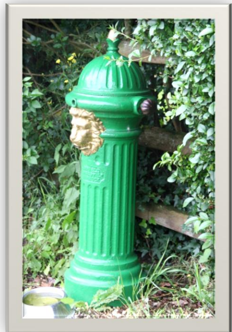
The old drinking fountain opposite the pub in the village centre