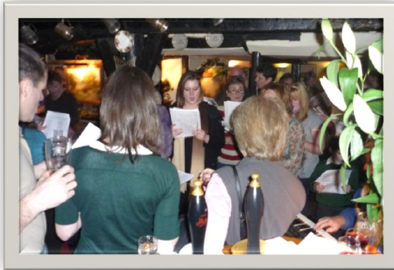
The George is packed to the rafters for the annual carol singing led by the village choir

The pub and the Church work closely together to create a community spirit: the Carol Singing is such a popular start to Christmas that it is definitely standing room only; the Harvest Festival Auction raising money for the local hospice and the church meetings held to discuss village issues.