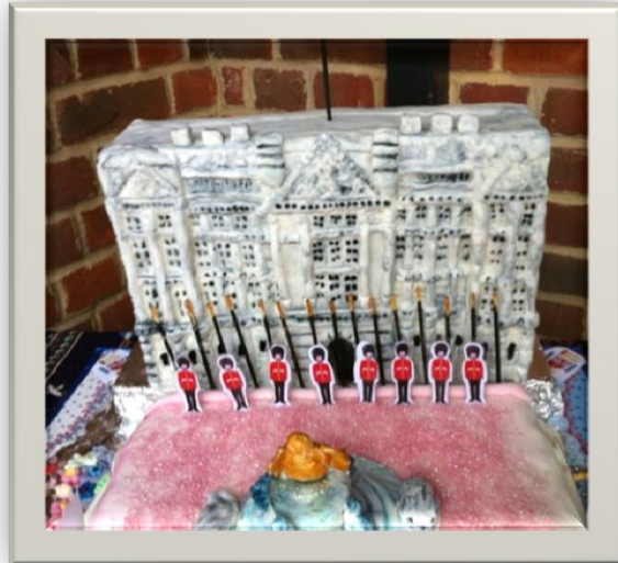
Buckingham Palace at the end of the huge cake baked by villagers and iced by children at the school

For those without picnics the pub laid on a BBQ, and provided yet more live music in the evening which, thanks to the continuing good weather, was able to be enjoyed outside with the car park packed with dancing villagers.