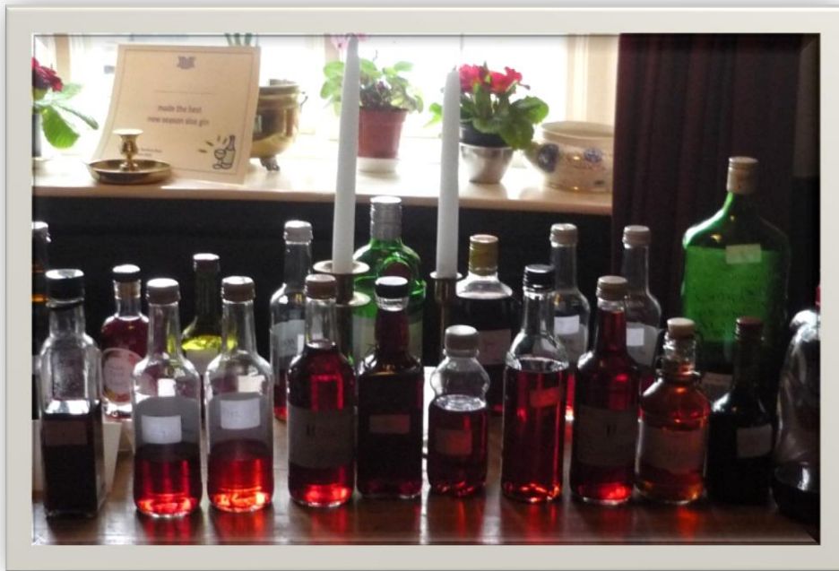
Entries for the hotly contested annual sloe gin competition

The pub has introduced the annual sloe gin competition. This is a hotly contested event with a huge number of entries with secret ingredients, with the winner getting the glory and a certificate.