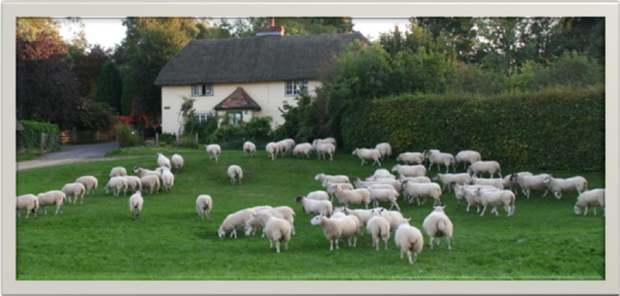
The unusual sight of sheep grazing on the village pond