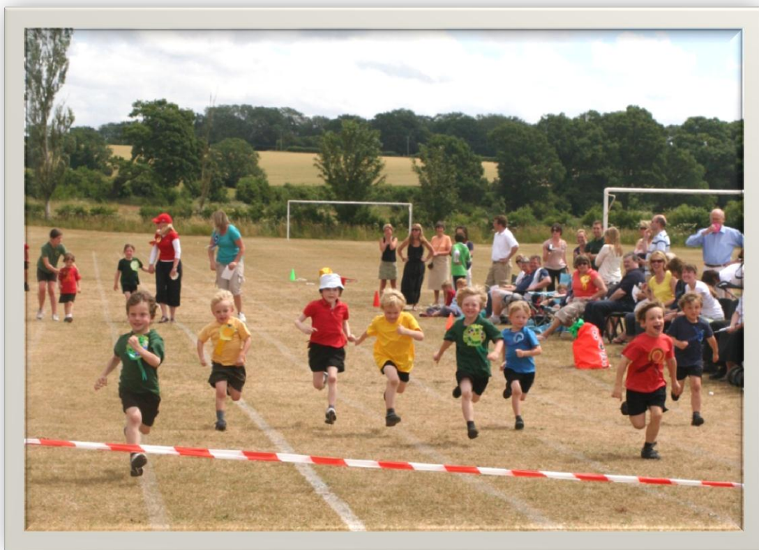
School sports day on the Burydene

The Sports Pavilion is available for private hire and is the venue for many a children's party, taking advantage of the large, safe open space it commands.