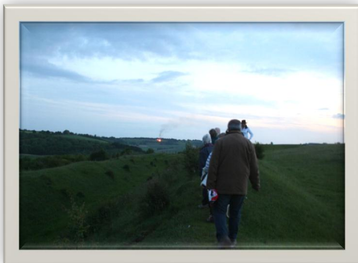
Walking along the ramparts of the Iron Age fort above Vernham Dean to light the beacon.

The day was to draw to a close with the lighting of a beacon, and at 9 pm nearly 100 people gathered at the pub to begin the long walk to the Iron Age fort on the hill high above the village.