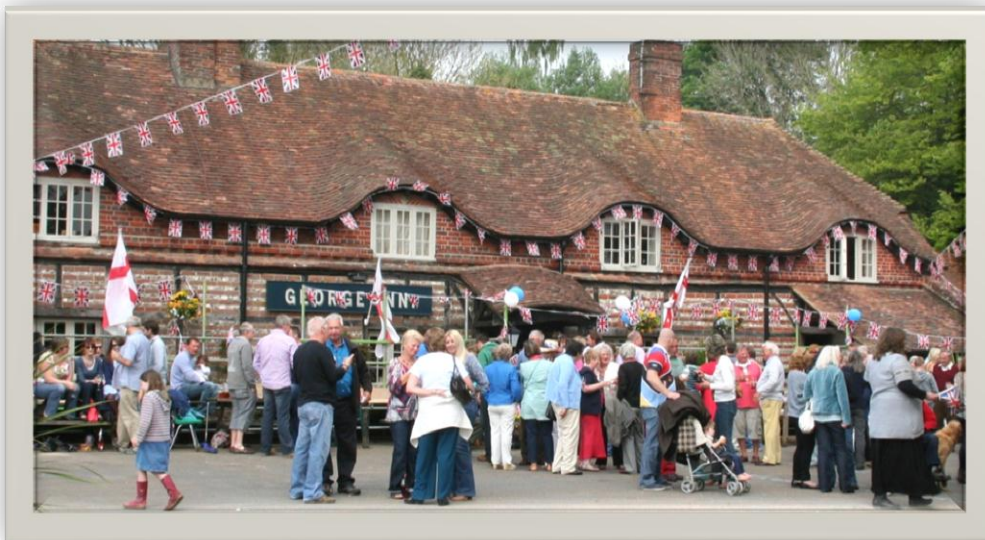
The community coming together outside the George Inn for the street party

The road was closed for the day and a long table decked in red, white and blue was set up in the middle of the street from the pub to the village hall. Families brought their picnics, drinks and flags, there were children's entertainers, live music in the pub car park, including a few numbers from an impromptu village band featuring musicians of all ages and dancing in the pub in the evening. A large screen was erected in the village hall so that those who didn't want to watch the wedding at home on their own could enjoy it with friends.