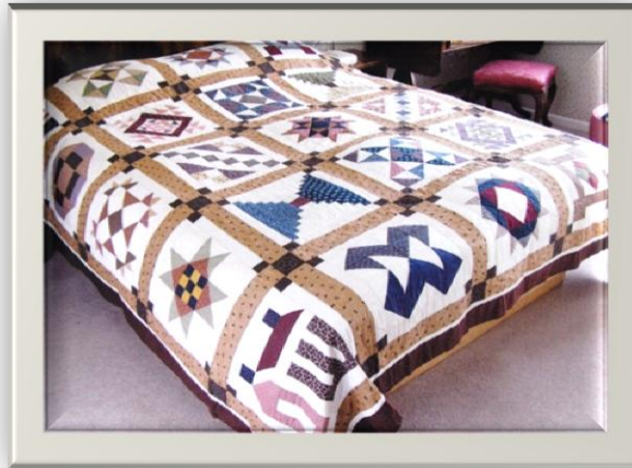
One of the beautiful quilts made over the years by the Sewing Group