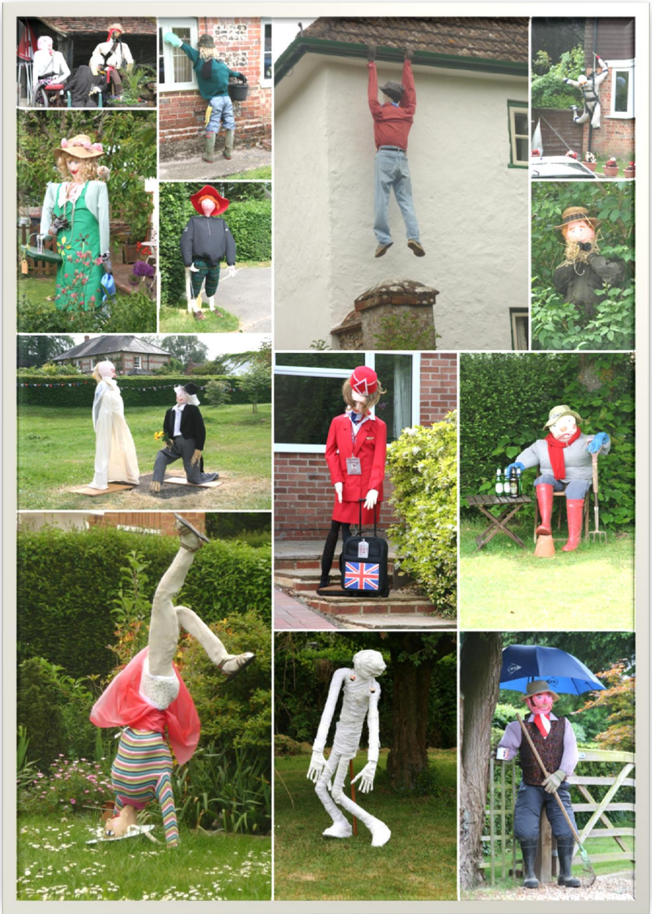
A selection of the 140+ scarecrows that appeared in Vernham Dean for the Jubilee weekend