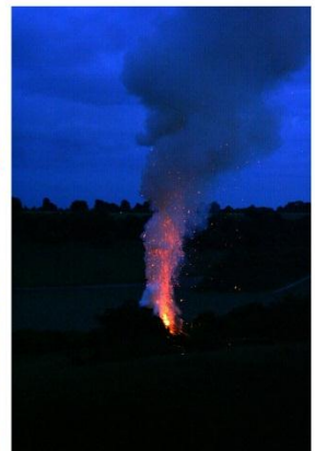
Party time for villagers, friends and families at Vernham Dean's Jubilee Celebrations