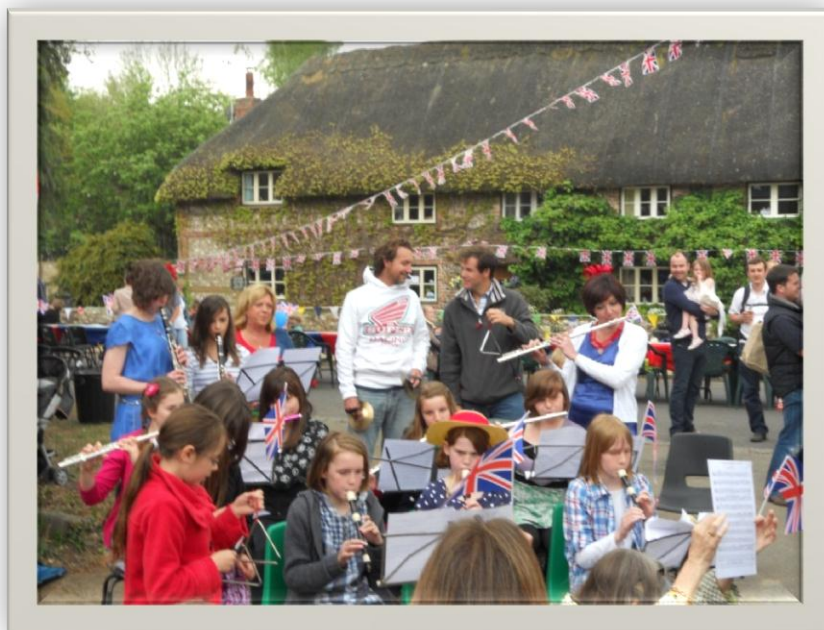
Young musicians entertain the village at the Royal Wedding street party