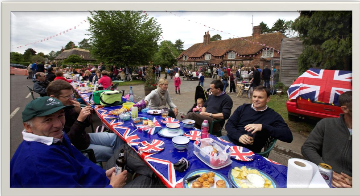
Enjoying the Jubilee street party in the village

The road was closed for the day and a long table decked in red, white and blue was set up in the middle of the street from the pub to the village hall. Families brought their picnics, drinks and flags, there were children's entertainers, live music in the pub car park, including a few numbers from an impromptu village band featuring musicians of all ages and dancing in the pub in the evening. A large screen was erected in the village hall so that those who didn't want to watch the wedding at home on their own could enjoy it with friends.