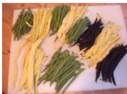
A crop of French beans

The next meeting of the Stockbury Gardeners is on Thursday 4 th October at 8 pm where we have our AGM and our autumn flower and vegetable competition.