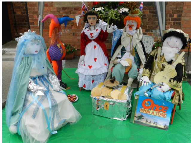
Pupils & Staff at Halam School