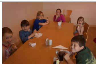
Junior members of the Halam Church Choir enjoying a summer trip to Newland Farm Ice Cream Parlour