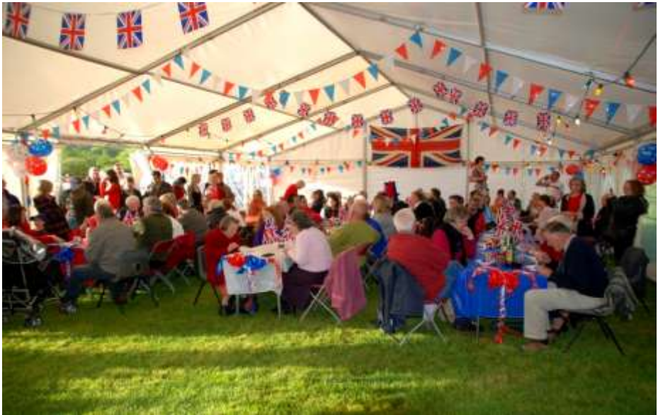
Roy and Mike is deep conversation at the Jubilee party - probably discussing if they should have a beer or two !!!