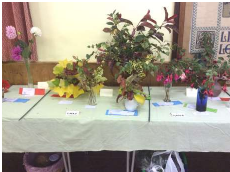
Some of the entries in the recent Grafty Green Gardening Club Show