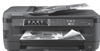
In Harby Village Hall.

Scan, print and laminate documents and posters up to size A3 from just 5p a page.