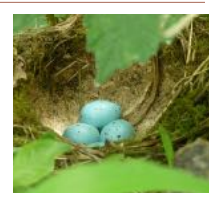
The Thrush nest at the entrance to the bird hide.

I think life is getting a bit congested underground too. The soil must be crammed full of insects, bugs and other tasty morsels by the amount of mole hills we have. I wish someone would tell them to stop digging up the paths, Duncan ( the tractor ) does not like mole hills and this is making it hard to cut the paths. But they are great for planting out plug plants in the meadow, so much easier to dig where a mole has been.