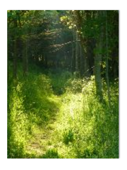
The entrance to Cooper's Wood now looks less like a plantation.