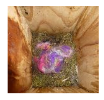
One of the boxes used last year. I like the colour scheme, obviously a bird with taste.