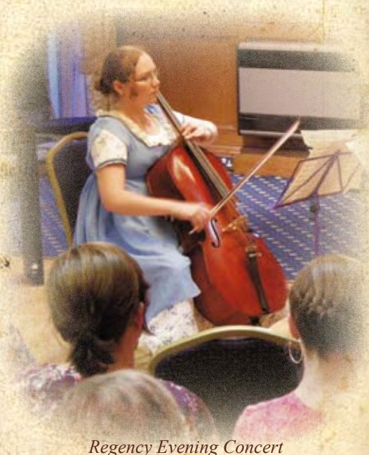
Regency Evening Concert