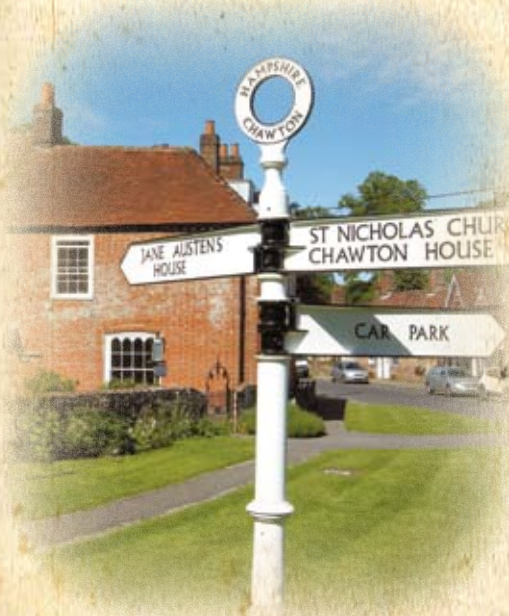
Chawton's famous signpost