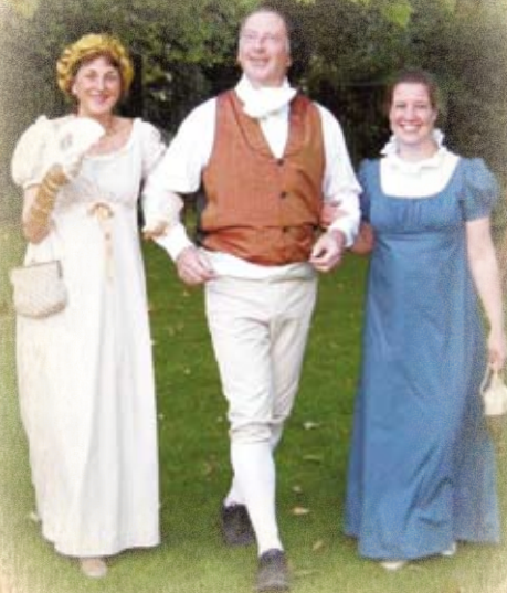
Promenaders at Regency Supper

www.altonlanguageworkshop.org info@altonlanguageworkshop.org