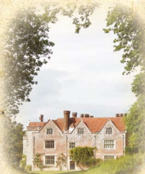
Chawton House Library

One of Alton's oldest independent family run businesses serving the local and surrounding community for generations