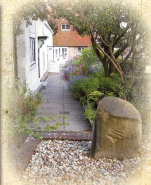
Friends Meeting House