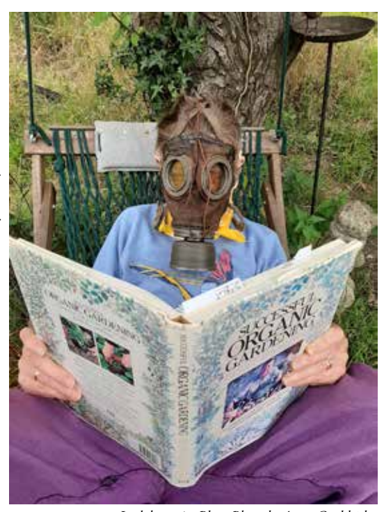
Lockdown 1st Place

With 10 classes to choose from (Cookery, Crafts, Flowers, Flower Arranging, Fruit & Veg, Fun (3 age groups) Garden Greats and Photographic Art), each with a different theme every week, there was a wide variety on offer and participants showed a range of skills and much enthusiasm.