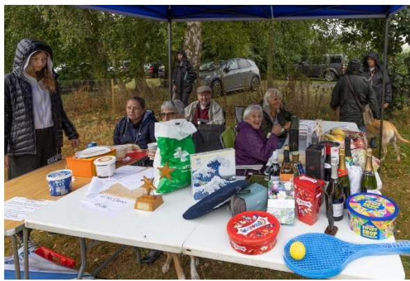
The raffle shared its space with dog show registering