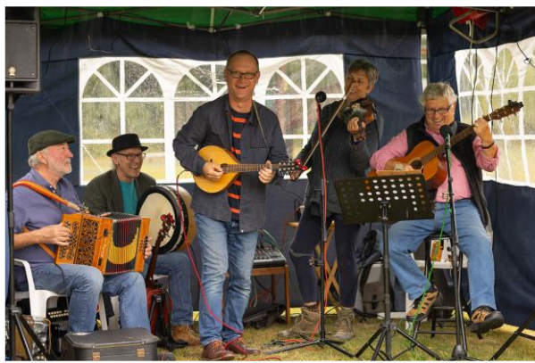
...and the band played on...