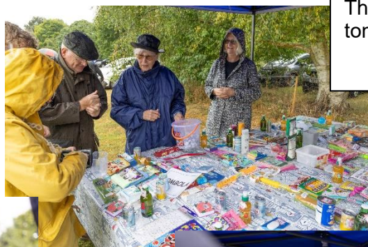
There were winners on the tombola... and the raffle...