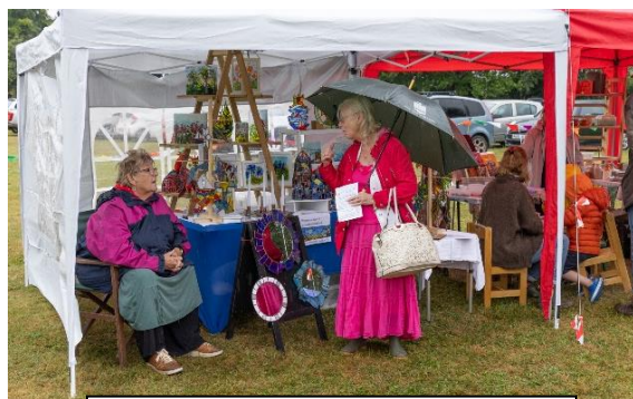
The church were there..