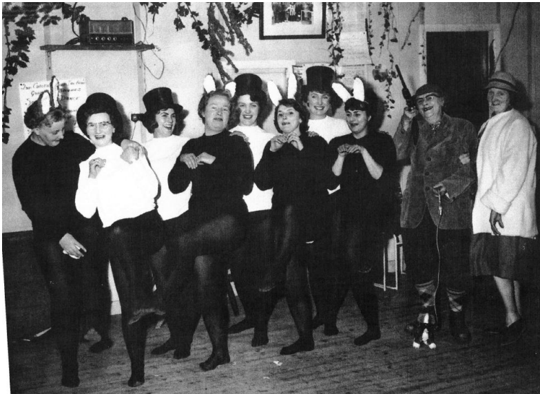
Buildwas W.I. put on shows to support the church.