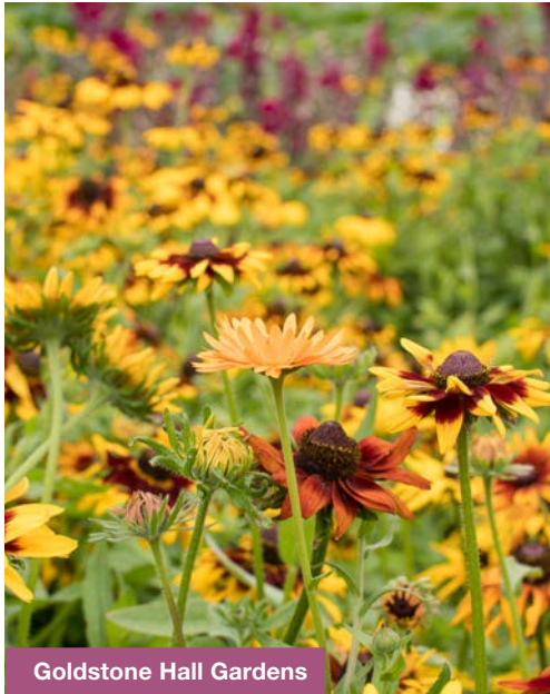
Goldstone Hall Gardens