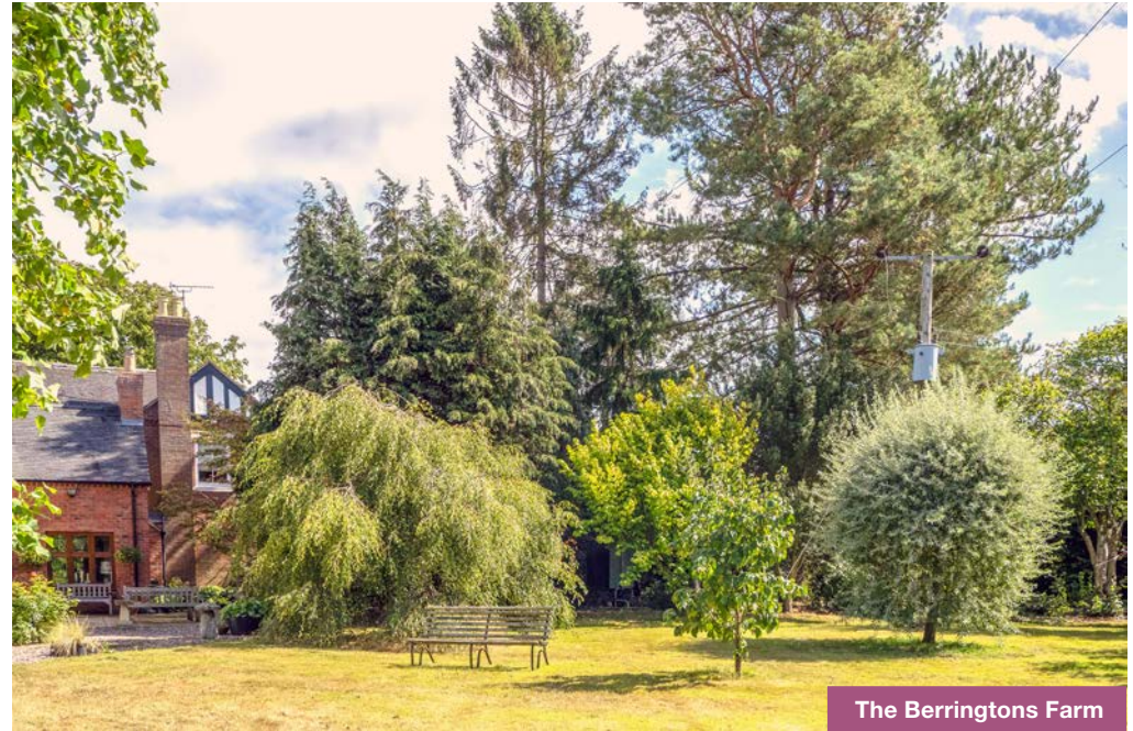
The Berringtons Farm