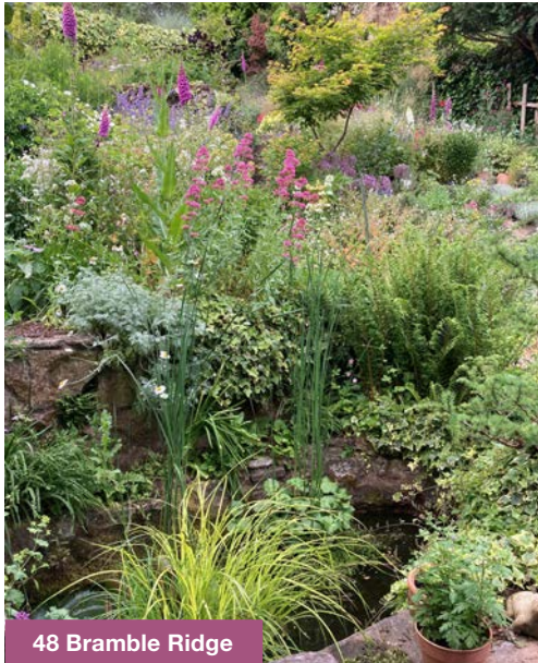
48 Bramble Ridge