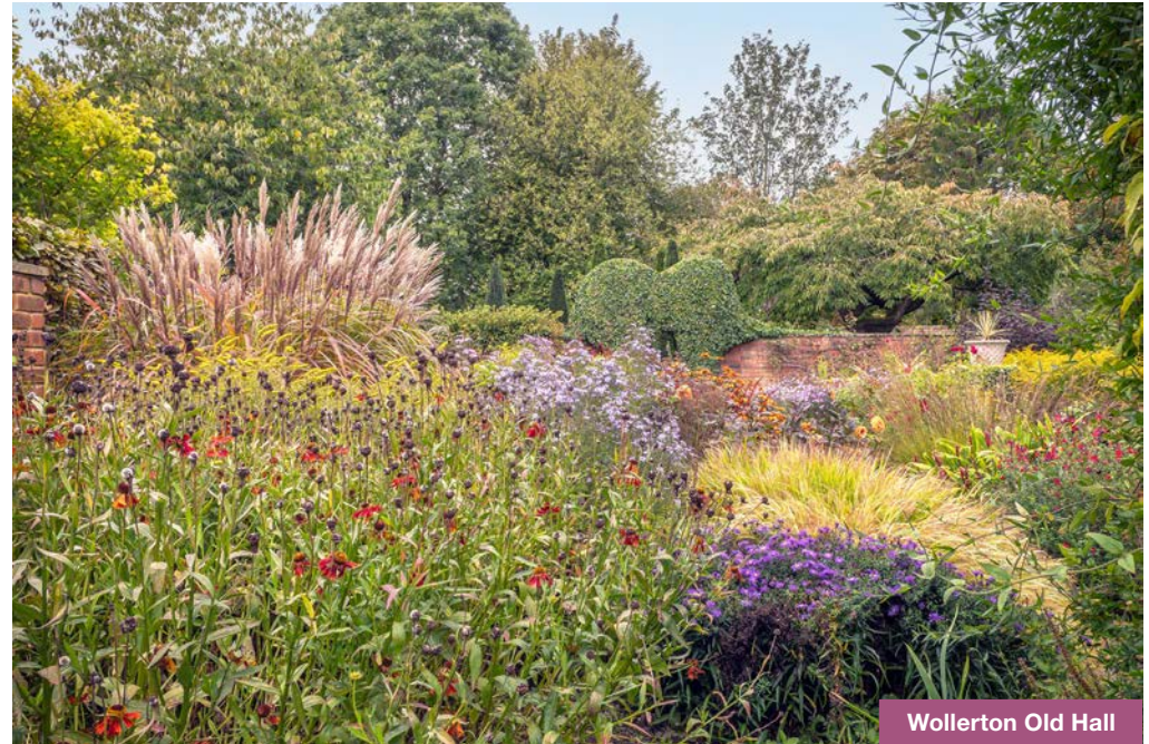
Wollerton Old Hall

Independent family owned & run garden centre