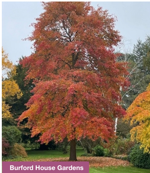
Burford House Gardens