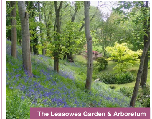
The Leasowes Garden &amp; Arboretum