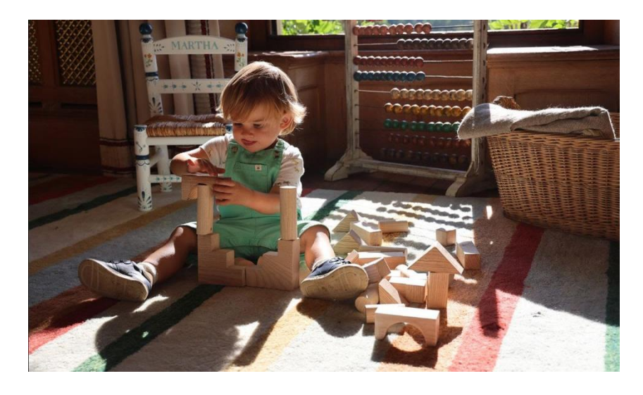
Knepp x Men's Shed Our sustainable children's building blocks

"We're delighted to be collaborating with the Horsham Men's Shed to produce sustainable, beautifully crafted children's building blocks – the perfect, timeless gift for a child or grandchild.