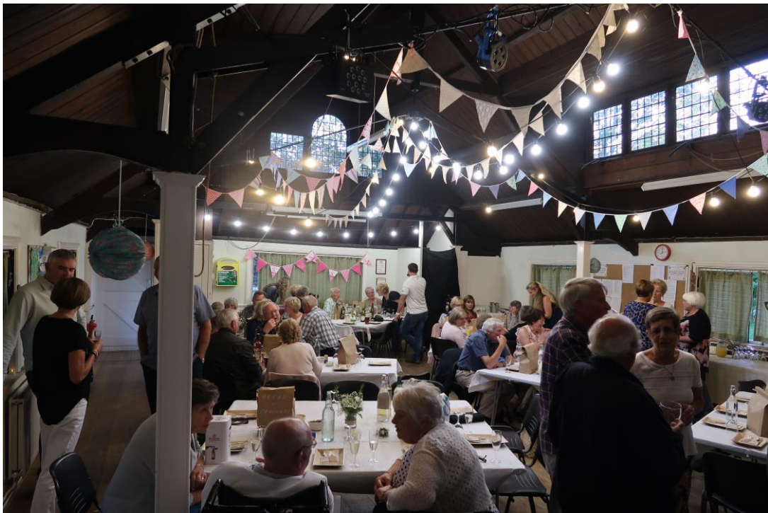
Abbotsbrook Hall – inside

The hall is still available to hire for children's parties etc on Saturdays and even with the work being undertaken, you can still enjoy Abbotsbrook Hall's unique 'arts and crafts' architecture.