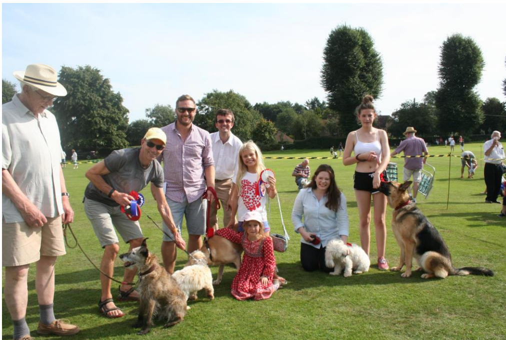
Proud winners at the Dog Show

Chairman, Little Marlow Village Amenities Committee