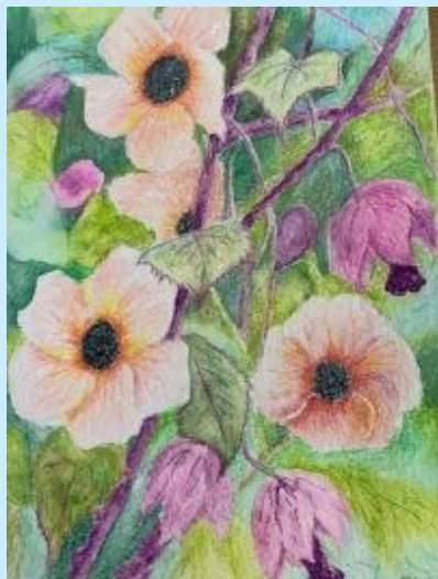
Thumbergia and Rhodochiton - Hilary, watercolour pencils.