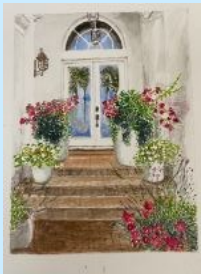
Holiday treat - Denise, watercolour.