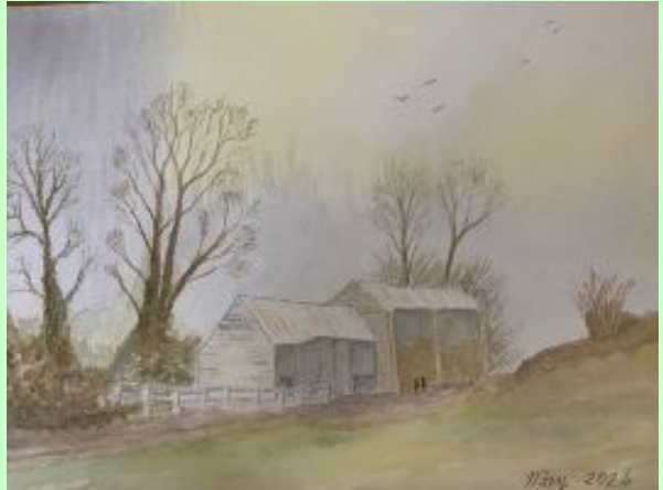
Winter barns - Nick , watercolour.