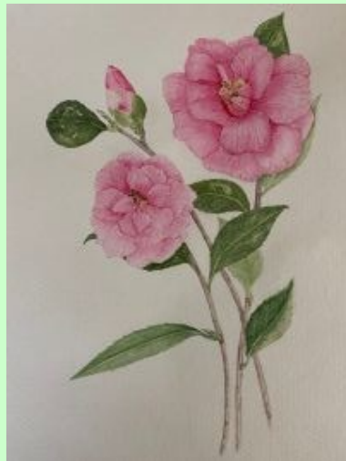
Camellia Donation - Edwina , watercolour.