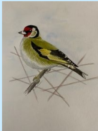
Goldfinch - Edwina, watercolour.