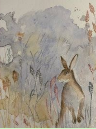
Curious Hare - Christina , watercolour pencils .