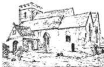
St. Nicholas - Boughton Malherbe