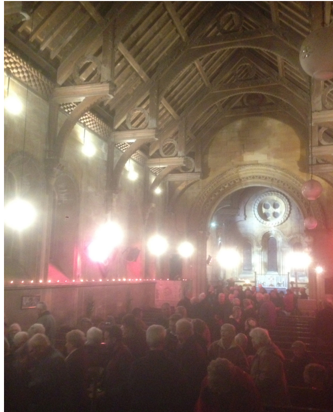
ST HELEN'S CHURCH, THORNEY

On Thursday 17th December 2015 St Helen's was packed with about 100 people plus 35 band members for our Carols by Candlelight. Had people come to view the new lighting system, including uplighters showing off the recently cleaned rafters? Had people come to listen to the amazing Lincolnshire Fire and Rescue Concert Band? Or had they come because they love singing those familiar carols? Perhaps they came because they wanted to hear the readings, reminding them once again of the wonderful Christmas story. Maybe it was the promise of mince pies, warm drinks and a chat afterwards with old friends. You might like to think, as I do, that it was a combination of all of these things which brought a record number to church that evening. But it was certainly an amazing event, enjoyed by all. Our photo shows a very atmospheric St Helen's after the last Carol, the last prayer and after candles had been blown out. People are beginning to form an orderly queue for refreshments and to catch up on all the latest news from friends and neighbours. The new lighting had to be installed as the wiring was no longer fit for purpose, and while scaffolding was in place several people got involved with some serious rafter cleaning. Our new uplighters can be seen showing off our ornate roof timbers. Come along one day and see for yourselves. Thanks to who helped with the electrical work, the cleaning, more cleaning, the decorating and the catering. Happy New Year!