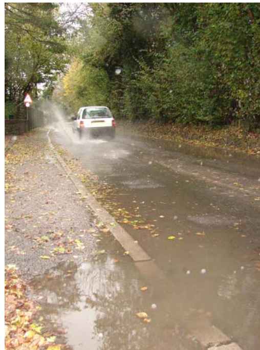
Hussell Lane after rain

A majority (57.5%) agreed there should be more pavements , whilst a stronger majority (79.9%) agreed a pavement on Roe Downs Road was required to increase safety for children.