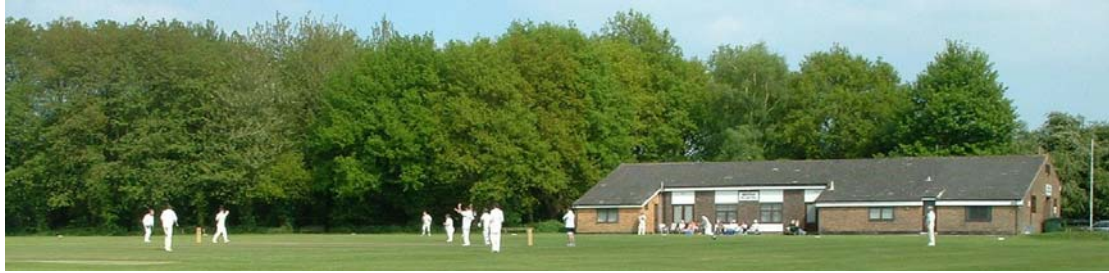
Cricket on the Village Green

Strong majorities of adults were satisfied with existing activities, societies and clubs (79.3%) and believed there should be more clubs and activities for 11-19 year olds (70.3%). A strong majority (82.3%) agreed there are sufficient amenities (shops, Post Office, meeting places, pubs) although anxieties were raised about the continuation of Medstead Post Office.