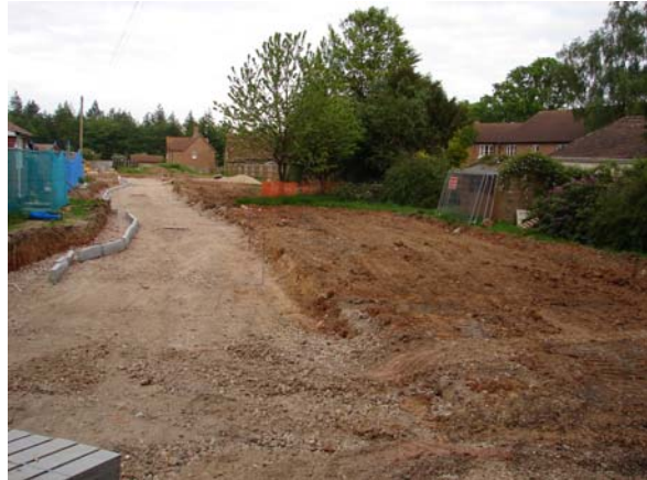
Redevelopment in Boyneswood Road

However, 80.0% of respondents felt there was a lack of affordable housing for younger people.