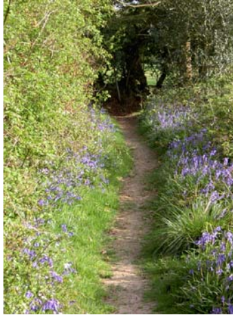
Medstead footpath in Spring

Overwhelming majorities agreed the village green (98.4%) and the rural environment (97.2%) were major assets to the Parish which should be protected and maintained, whilst 70.6% were in favour of reinstating and maintaining a village pond , as a focal point for the village centre.