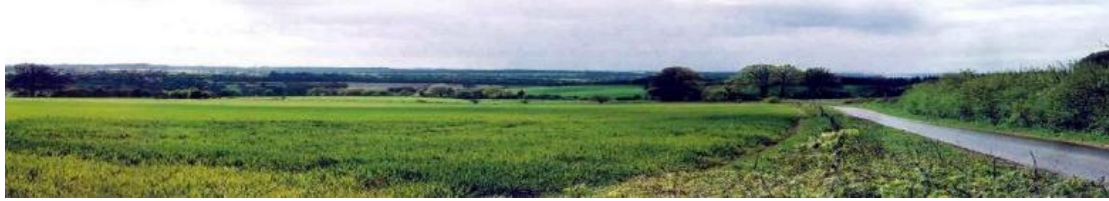
From Chalky Hill.

Of the Medstead Parish residents who responded to the questionnaire, strong majorities considered the Parish to be friendly and welcoming (89.1%), peaceful and tranquil (88.7%) and to have a community spirit (81.8%) and that these attributes should be nurtured or improved.