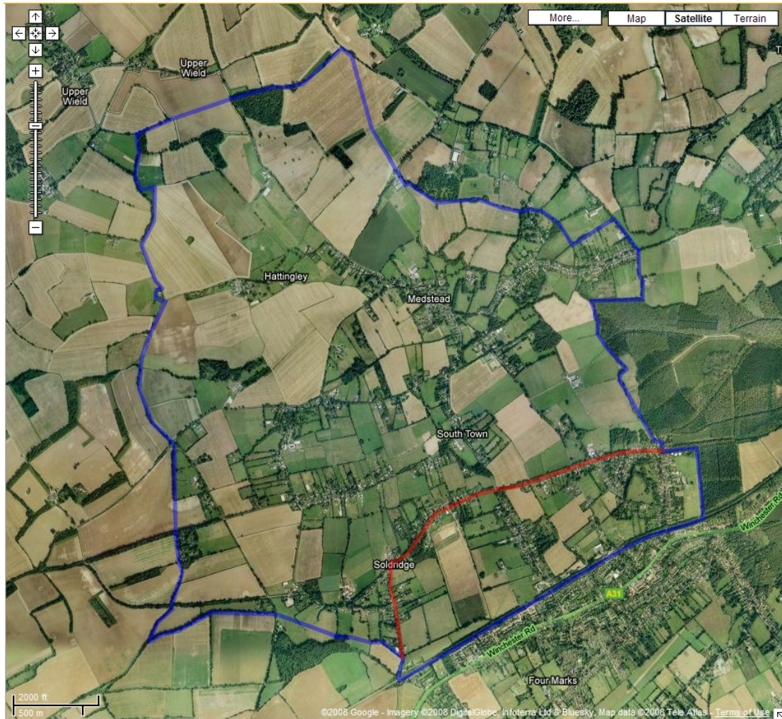
Medstead Civil (Blue) and Ecclesiastical (Red) Parish Boundaries, courtesy of Google.

The Parish of Medstead is located on a plateau on the Hampshire Downs and is one of the highest villages in Hampshire. Its origins can be traced back to Saxon times. With a growing population of around 2,000, Medstead is now principally a residential community though retaining the ambience of a rural village. There is also a significant equestrian presence in the Parish.