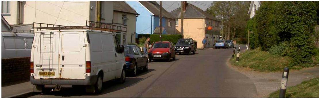
The High Street

Respondents were almost equally divided on whether parking in the high street should be restricted, with 51.1% against and 45.4% in favour.