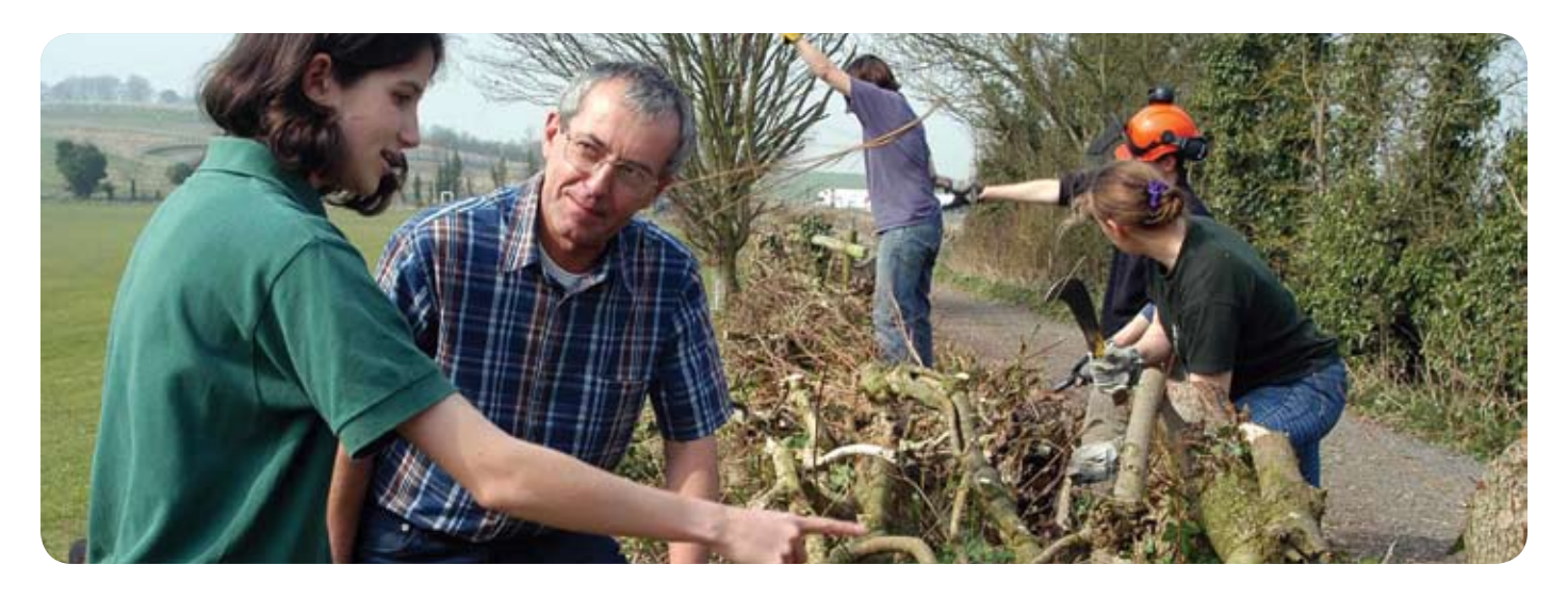
An opportunity to try 'hedge laying' at Kingston Maurward College