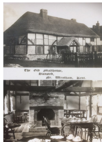
Postcard of the Old Malthouse in the 1930s when it became a restaurant.

The next interesting phase in the history of the Old Malthouse relates to the 1930s when it became a "spacious and pleasant restaurant, with a large open fire-place of brick and a comfortable lounge-annexe." A book, "Road Houses and Clubs of the Home Counties 1934" tells us: "A choice and varied luncheon is obtainable every day until 2.30 p.m. and afternoon tea may be taken either indoors or, in fine weather, on the lawn. From 7 o'clock onwards there is an excellent five course dinner, which is served until a late hour; and a skilful chef with an amply stocked larder is always at the disposal of such patrons as may require refreshments after ordinary hours. A fine radio-gramophone provides music for dancing enthusiasts at all times, and on the weekly Gala Nights, which take place every Friday, a good band is in attendance. A limited number of bedrooms are available."