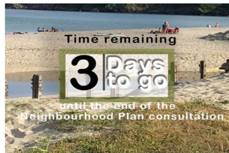
Figure 7- Facebook updates