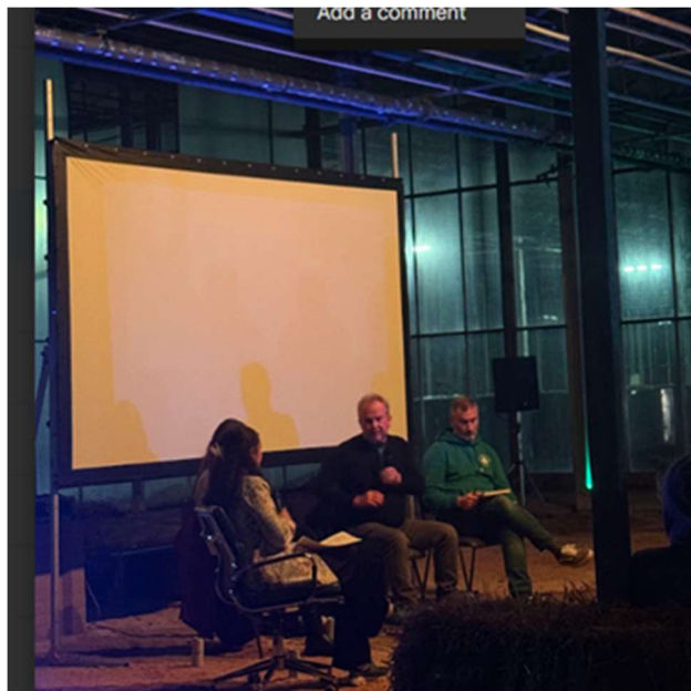
Images from the innovation nursery event