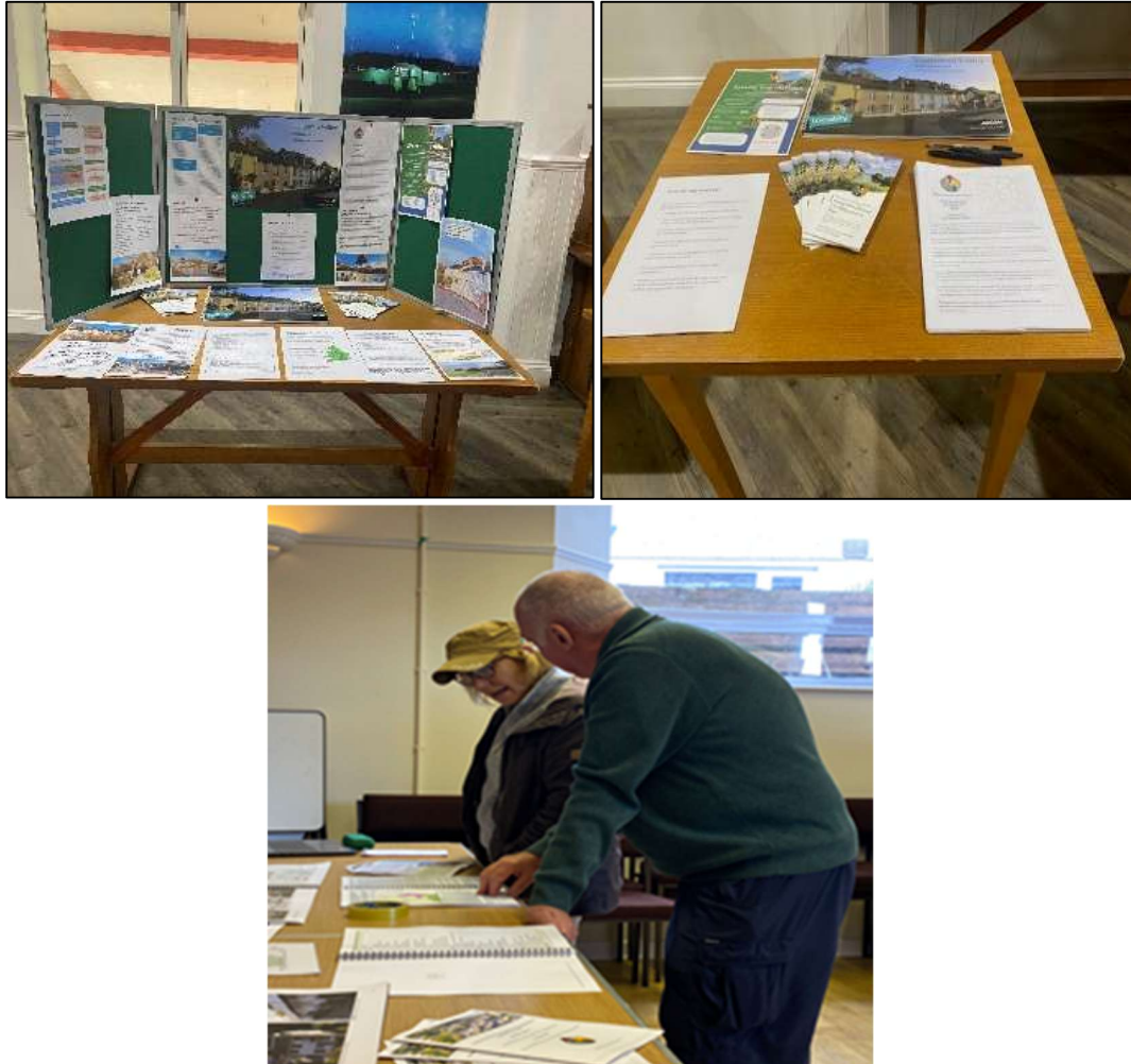
Image 6 -Events displays for 2024 consultation events