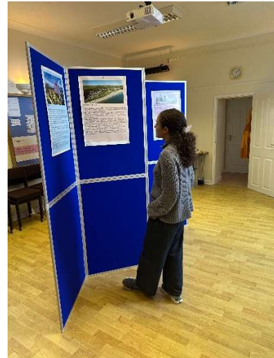
Images 7-10 Pentewan Village Hall 2025

3.37 People were directed to use the Go Collaborate consultation platform through Facebook advertising, leaflet drop, and face-to-face interaction at the drop-in sessions. Some filled in the survey online while others submitted handwritten forms at the drop in events that were manually entered into the platform by steering group members.