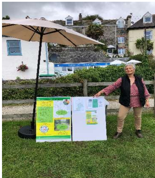
Image 1. Pentfest 2023 Pentewan Village

3.6 On 12 August 2023, a pre-consultation pop-up was organised at a local event in Pentewan Village called "Pentfest." the steering group attended to promote awareness of the upcoming public consultation. Members of the public were engaged in conversation about the Neighbourhood Development Plan and given leaflets promoting the consultation and explaining the different ways to access the questionnaire, using the online platform or using manual forms.