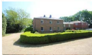
Netley Abbey £174,950