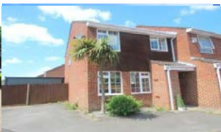
Netley Abbey £295,000