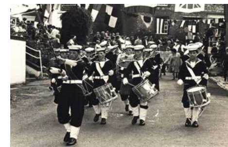
TS Mercury band at a regatta and carnival, 1960s