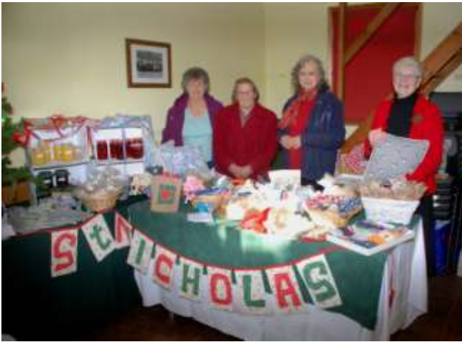
Some of the stalls at the Grafty Craft Fair