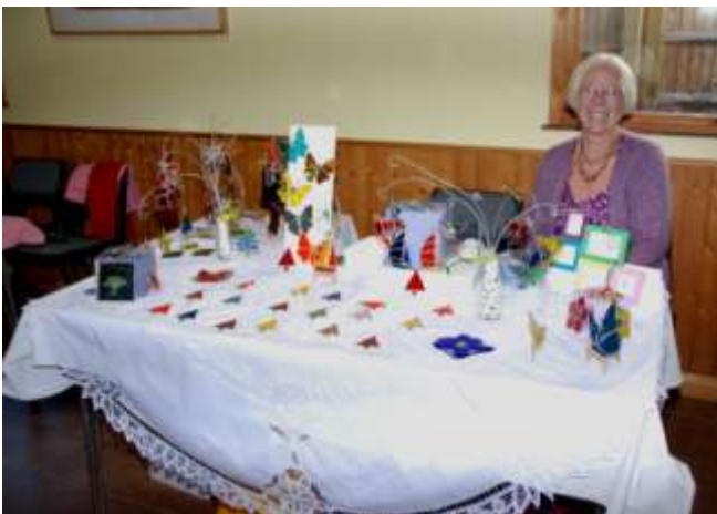
Mandy Hitchins Stained Glass