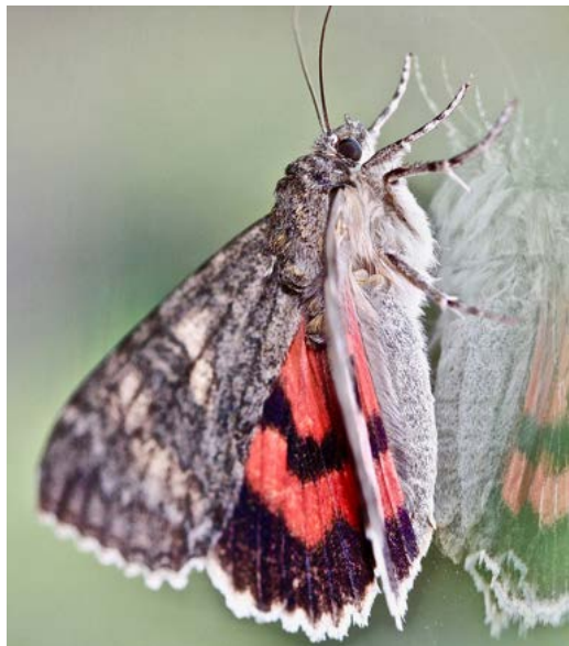
Red Underwing Moth by Alan Reading

Water quality and flooding are also a focus. Although these clusters are farmer led, Kent Wildlife Trust support these groups by providing technical help and suggest targets to aim for. By several farmers working collaboratively over a wide area, this can open the door for landscape-scale initiatives, which deliver more successful benefits to the environment than individual pockets of excellence, however good.