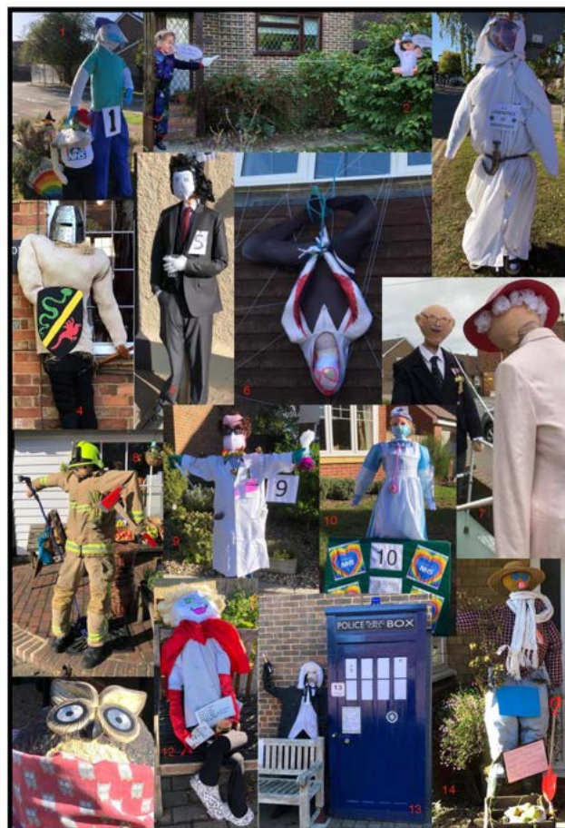
Marden Scarecrow Safari 2020