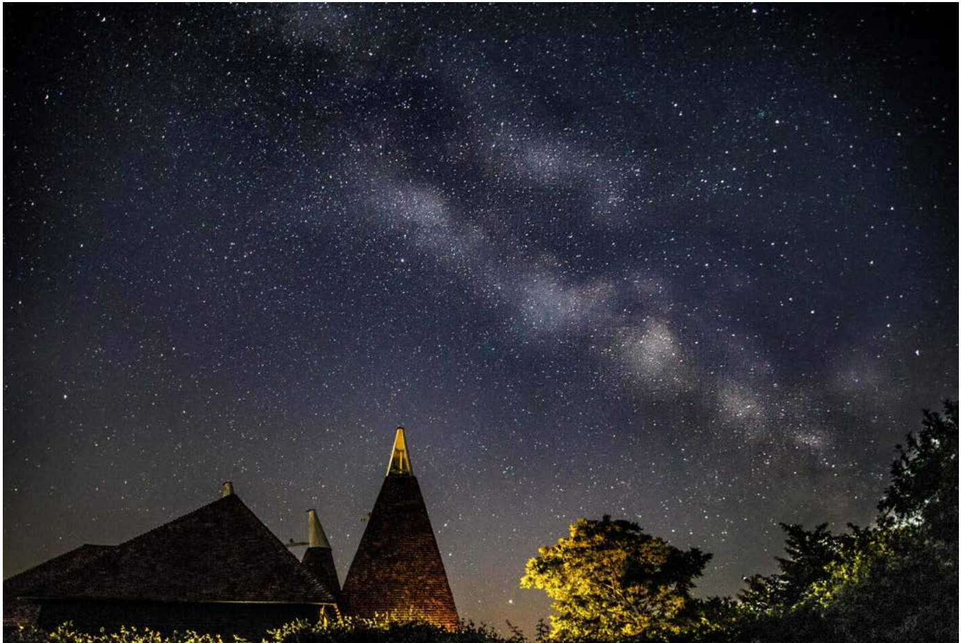
Milky Way over Great Cheveney Farm, Marden