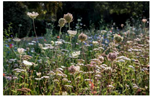
Wildflower Meadow