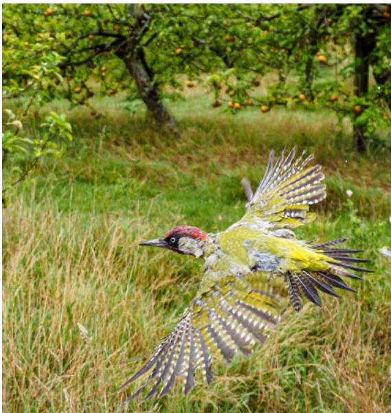
Male Green Woodpecker

Following a meeting in March with a couple of keen farming families, the Trust agreed to set up a cluster based in Marden. Despite delays caused by lockdown, the cluster is now approaching a dozen members, and all are keen to sign up and get to work. New meadows are planned, and measures to protect the River Teise and Beult too. With the successful launch of the Marden Wildlife Citizen Science project happening alongside, there are aspirations for possible joint projects in the pipeline. It's an exciting time, and a chance to make our very biodiverse village even more so. Our citizen scientists are recording species that are new to the area every week, and the cluster work can only accelerate this.