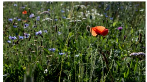
Wildflower Meadow

We would like to thank Marden in Bloom for all their hard work in creating the Wildflower Meadow in the field.