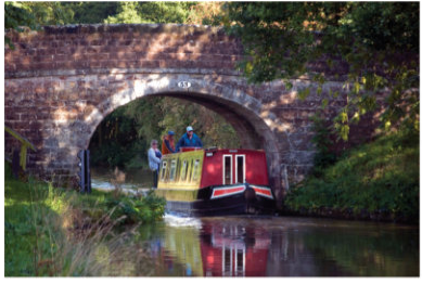
The Shropshire Union canal runs through the parish providing a range of recreational opportunities