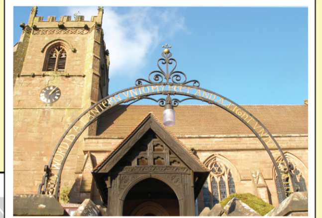
Cheswardine church restored in the late nineteenth century