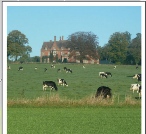
Cheswardine Hall; once a boys' home, now a residential home for the elderly.

This is not the legal definitive map. It is a working copy only. For information purposes only.