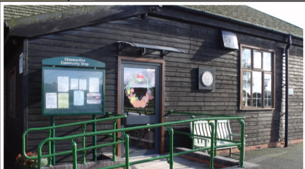
Cheswardine Community Shop, Podmore Road