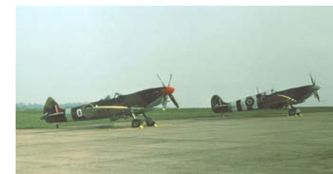
Spitfires at Hamble

Ian will be giving an illustrated talk in