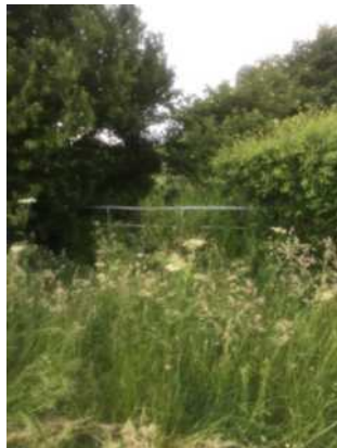
6.5 The Parish Field