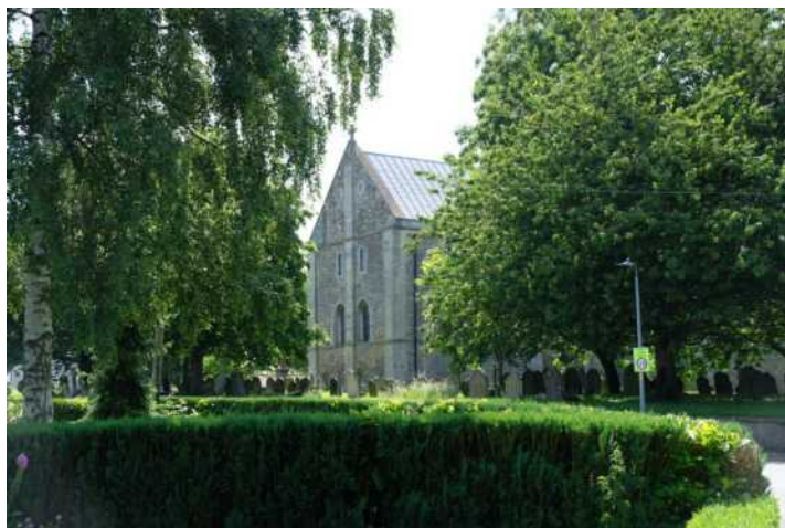
IV6.5 Stow Minster from the bend in B1241 round Church Lodge