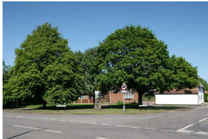
6.5 Village sign and areas of green in centre of Stow