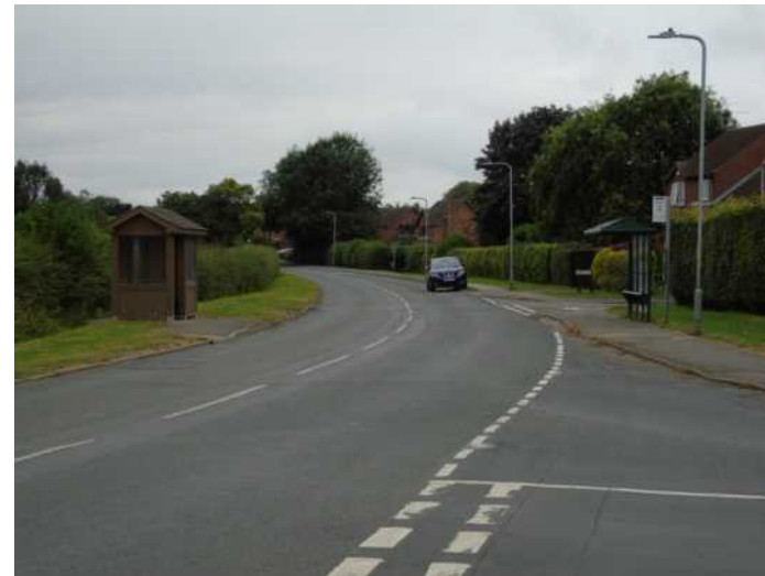
12. Stow Road street scene