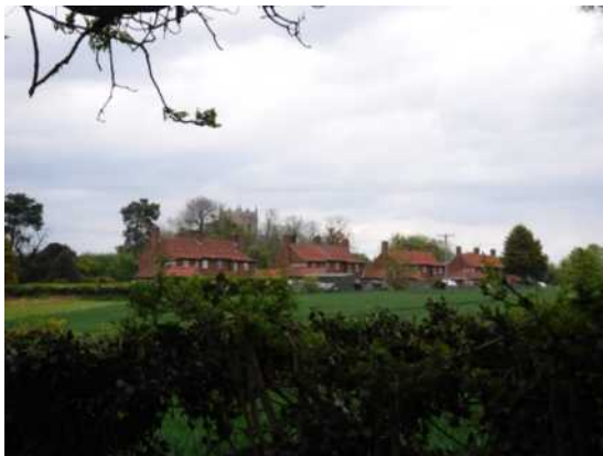
5.3 View from Cemetery towards Stow Minster