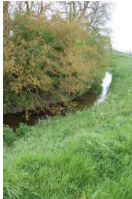
3.8 The Till at the end of Green Lane