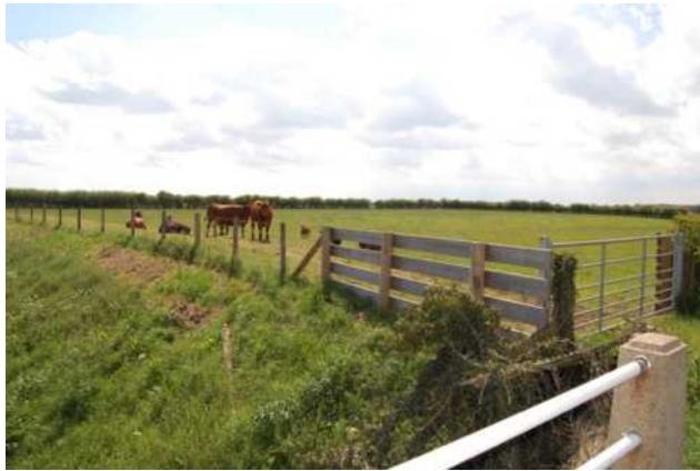
1.22 Cattle grazing by the Till