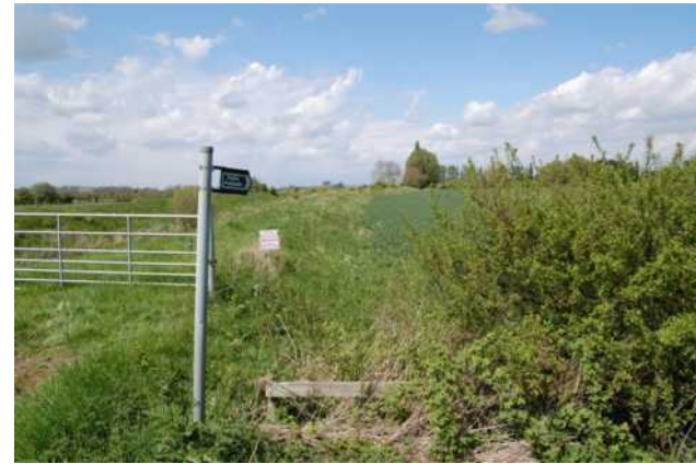
1.23 Public footpath from Squire's Bridge to Coates