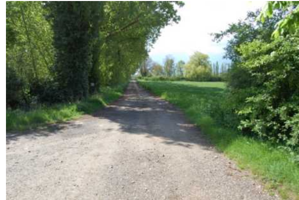
3.1 Lane at Coates