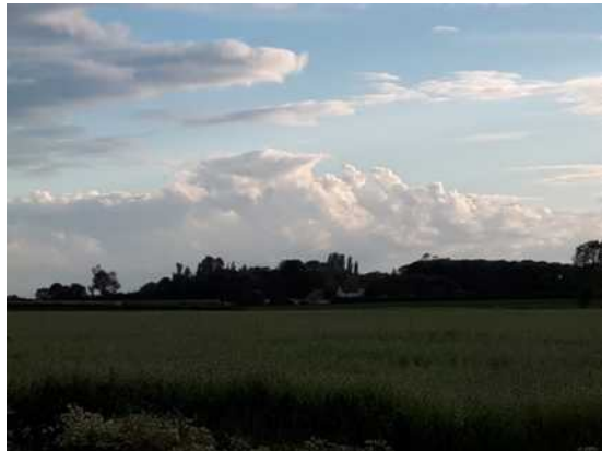
1.14 View from Green Lane towards Stow