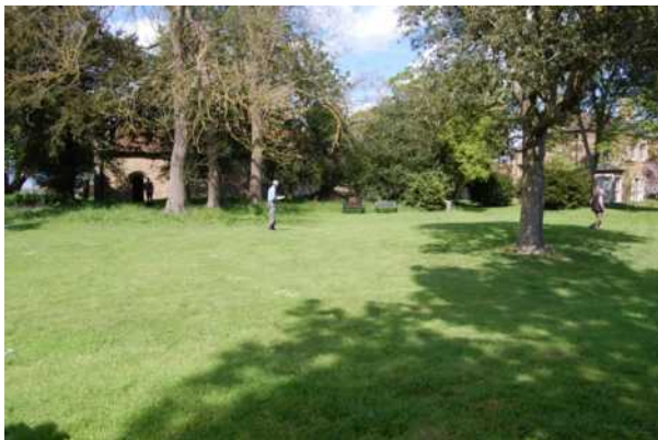
2.17 Coates Hall in the background