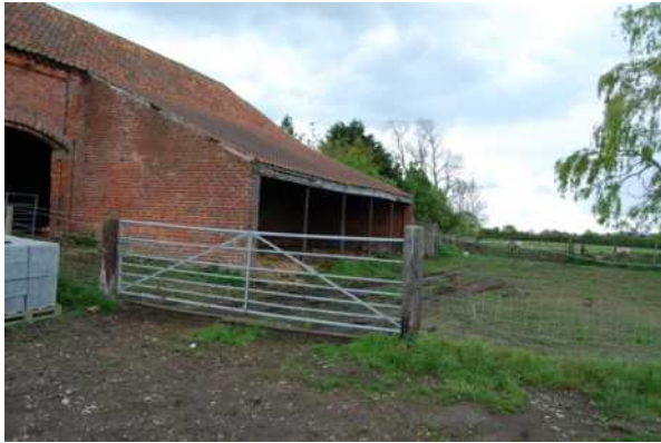
3.18 18th Century Granary with lean-to 'cart' shed, West Farm