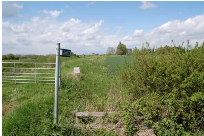
1.13a Beginning of public footpath from Squires's bridge to Coates