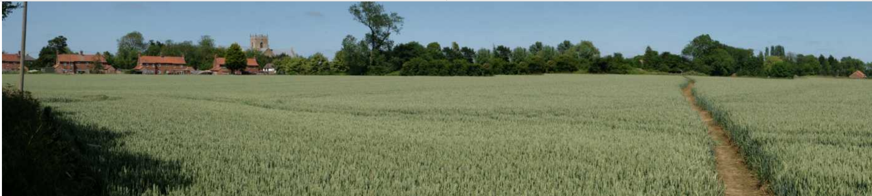
10.3 View of Stow from western branch of footpath off Stow Park Road