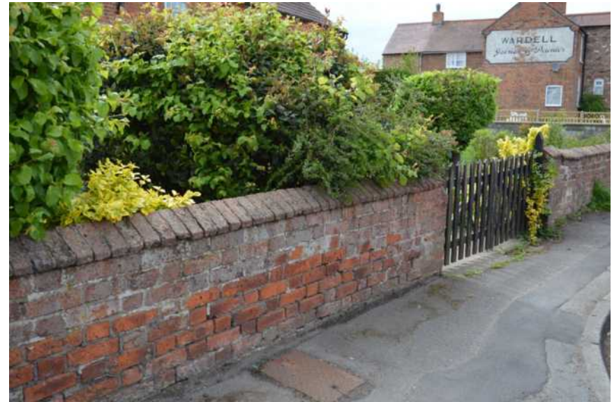
6. Example of garden wall coping pattern