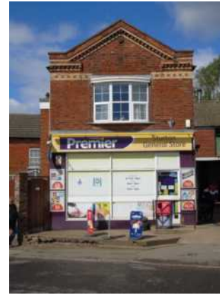
2. The village shop