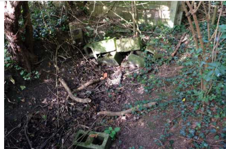
9.5 Clogged drain crossing footpath on north side of copse