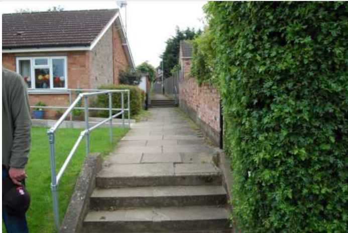
1.5 Footpath to St Mary's Crescent from Ingham Road