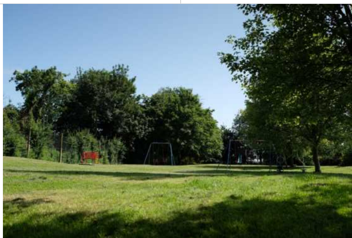
5.2 Play ground opposite pub