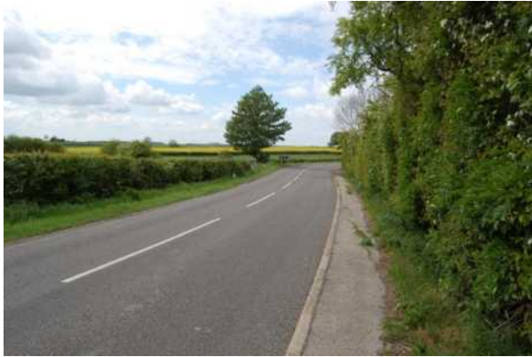
3.26 Leaving Normanby heading north on B1241