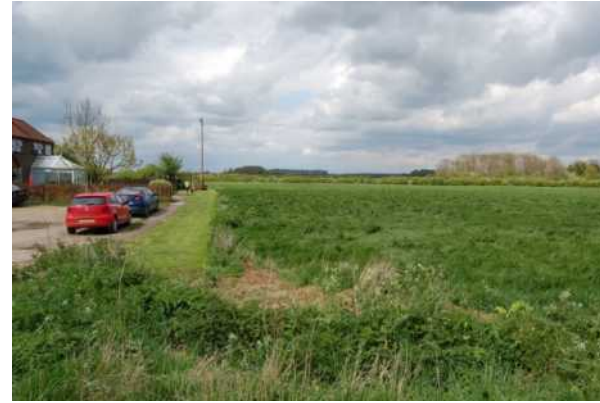
2.20 Across the fields from Coates