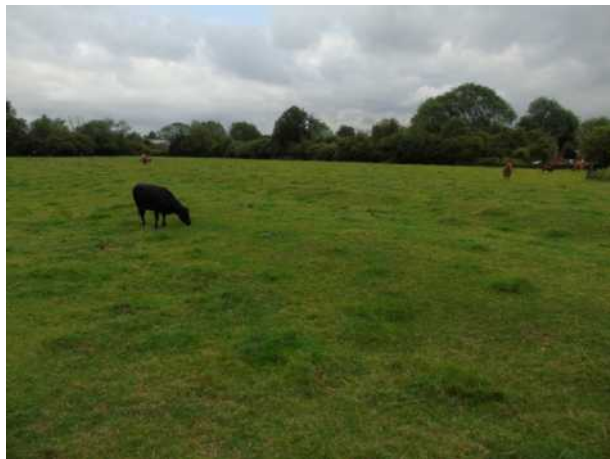
Non-designated heritage asset ridge and furrow field North