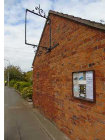
2. Former blacksmith with old Red Lion pub sign frame