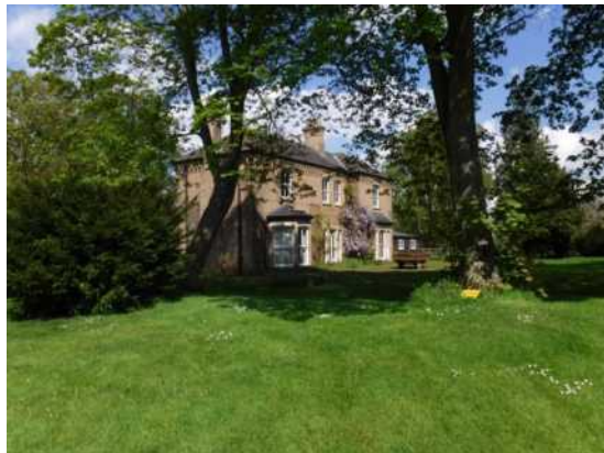
2.5 Coates Hall