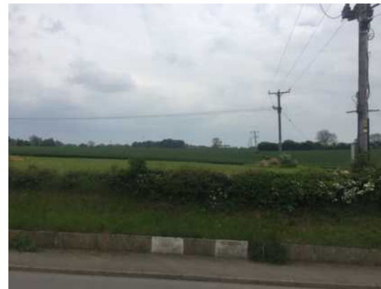
5.4 Stow Park Road near Manor Farm