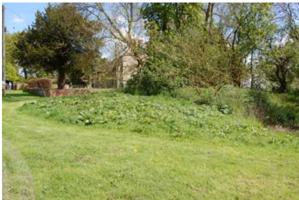
2.9 St Edith's as you approach