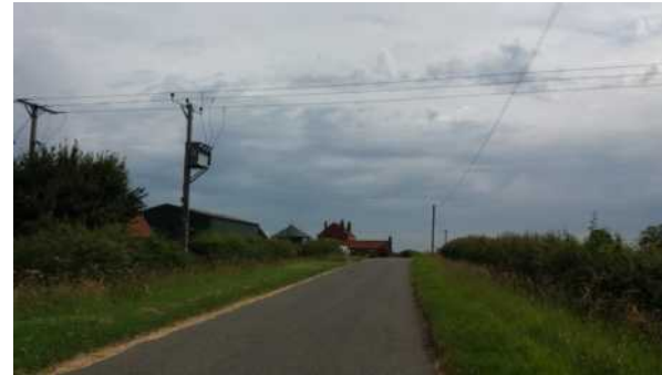
5.16 Highfield Farm from the west