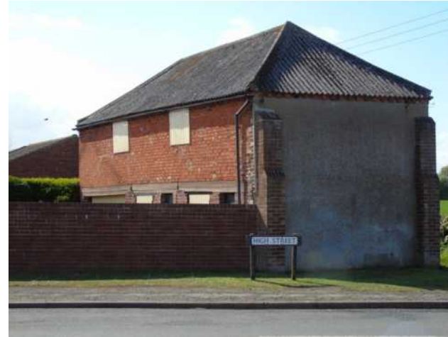
10. 18C barn