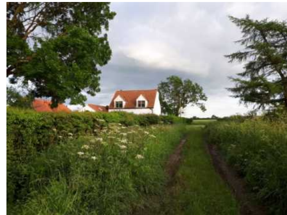
1.8 Green Lane towards Ingham Road