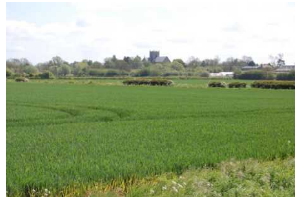
5.8 View to Stow Minster from the bridleway off Stow Park Road