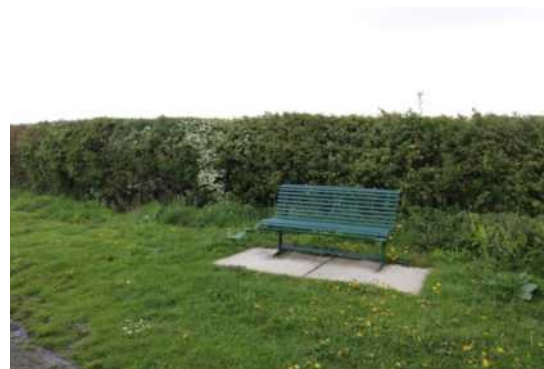
CF3 Seat on Thorpe Lane