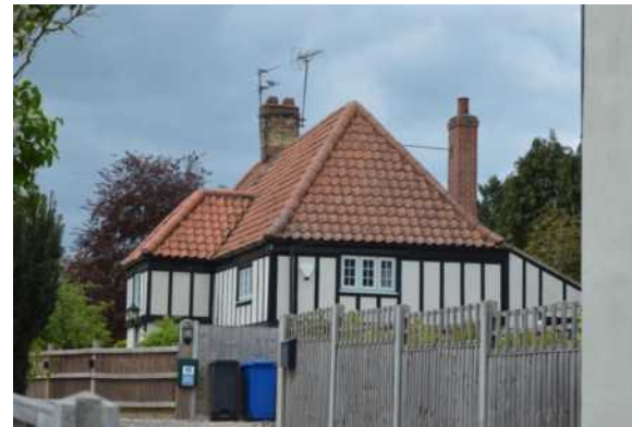
4. Early 18C detached house