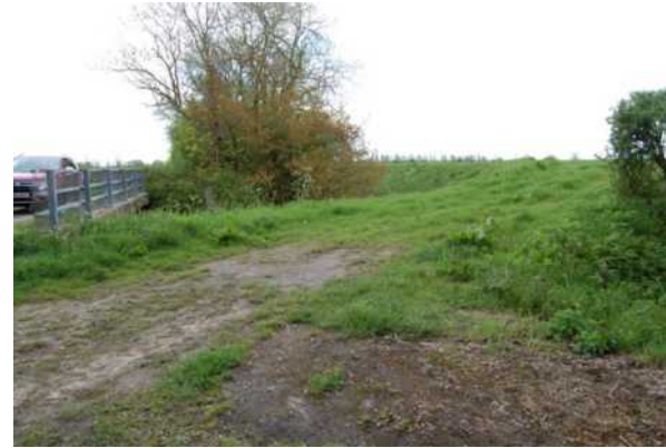
3.7 By the bridge over the Till at the end of Green Lane