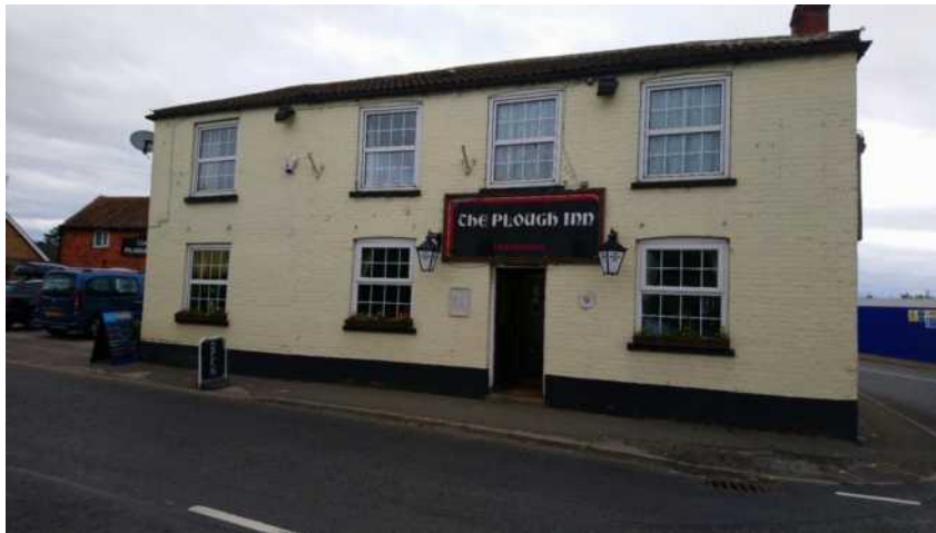
3. The Plough pub