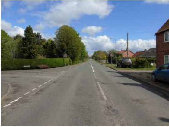
1. Tillbridge road street scene