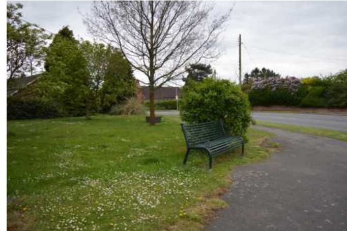
14. Green space with seating