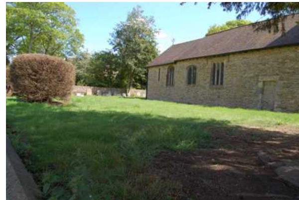
2.6 St Edith's