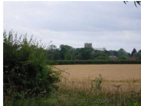
3.33 Stow Minster from the Coates/Normanby Lane