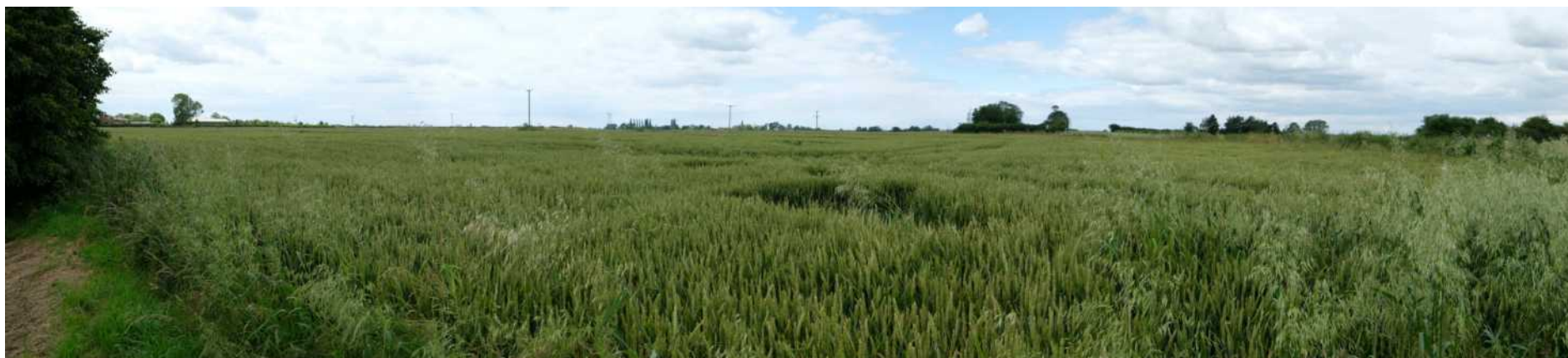
IV6.7 View SW from by 30MPH sign on Sturton Road