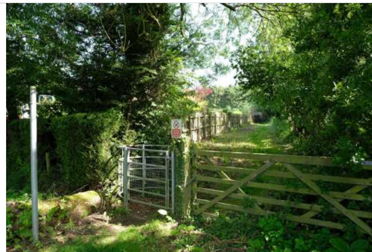
9.1 Footpath from Ingham Road by 30mph sign to Sturton