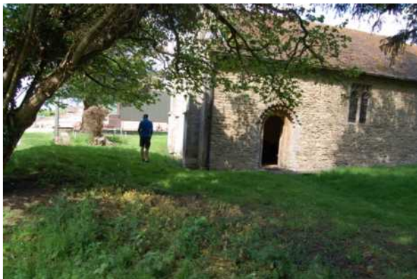
2.7 St Edith's looking towards farm buildings