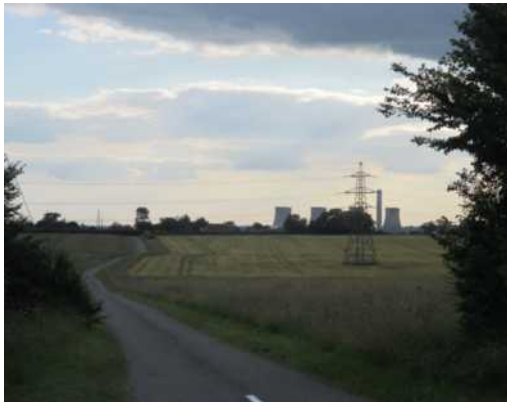
IV5 View west towards Trent Industrial landscape