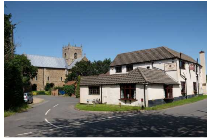
IV4.1 Stow Minster and Cross Keys pub from Stow Park Road