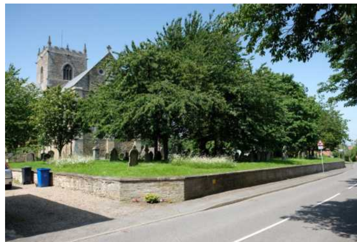
IV6.6 View from SE of Stow Minster and grave yard taken from B1241