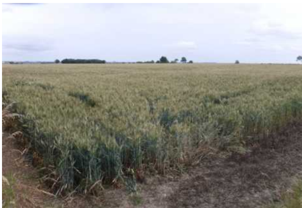
1.1 View across the fields on leaving the village on Ingham Road