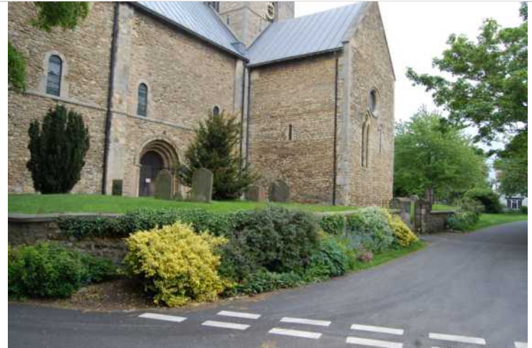
4.1 Stow Minster stands elevated above road