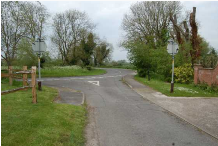
2.3 Rotting street sign on School Lane