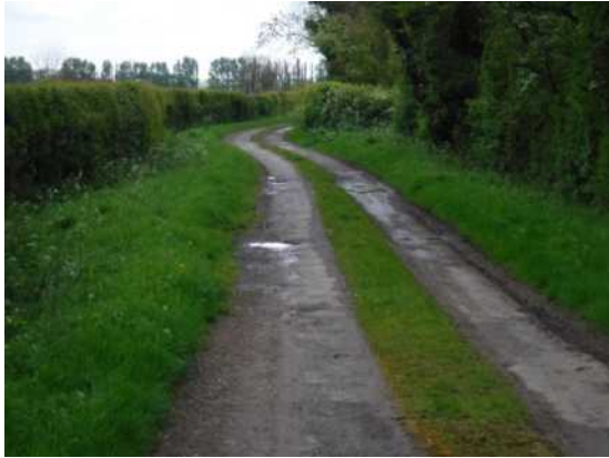
3.10 Lane from Coates to Normanby near the Till