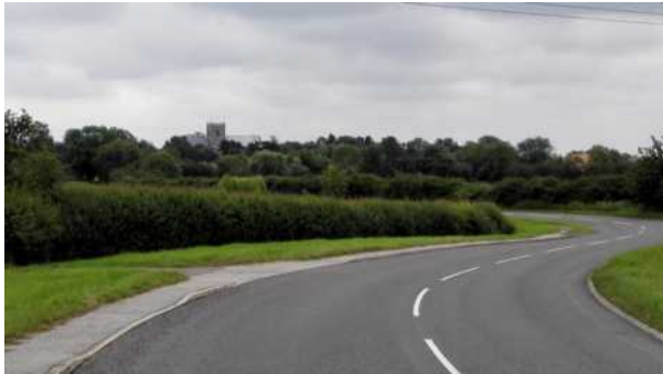
3.34 Stow Village from the north on the B1241