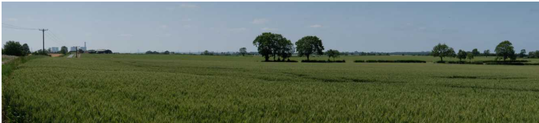
IV5.4 View to west from bend opposite cemetery