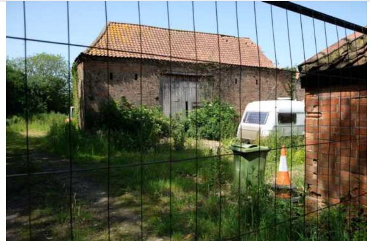
4.6 Partially preserved barn opposite west door to Stow Minster