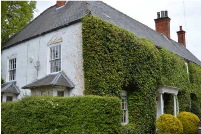
5. 18C Manor house