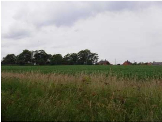
3.30 Looking towards Normanby from Coates/Normanby lane