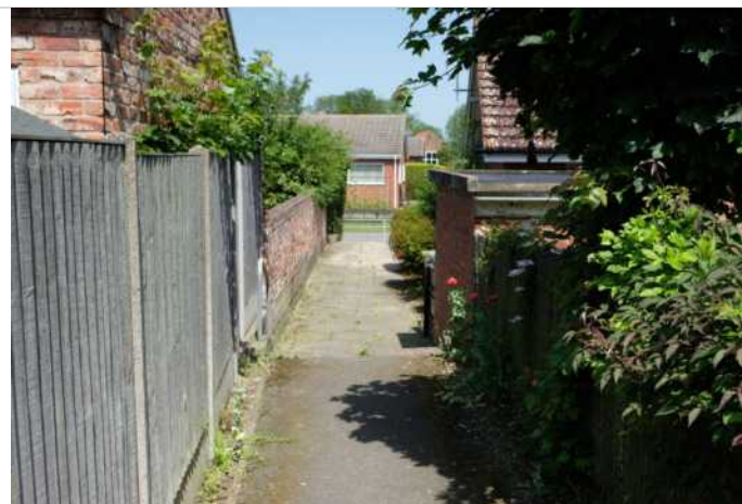
1.4 Footpath from St Mary's Crescent to Ingham Road