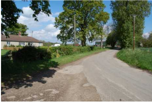
2.19 Lane into Coates