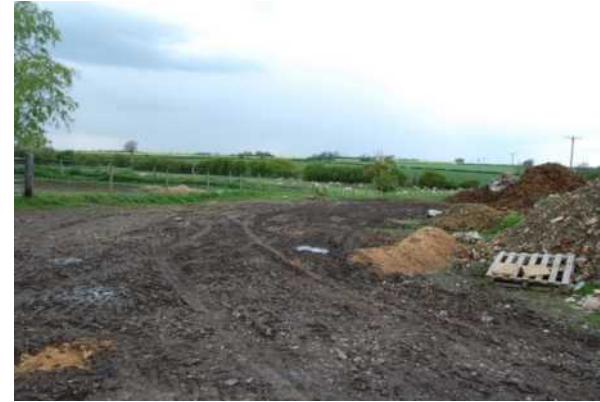
3.27 View to Trent valley from Normanby