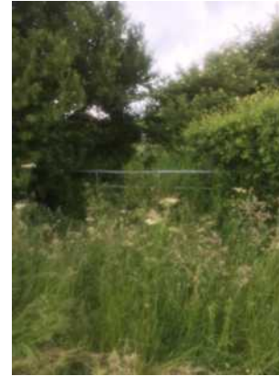
6.4 Parish Field