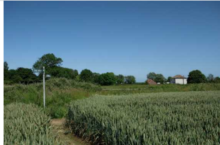
10.2 Footpath south from Stow Park Road - junction of branches