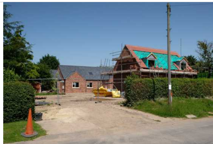
7.8 Redevelopment of Old Post Office