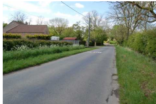
1.2 Approaching Stow from Ingham Road by Barley House