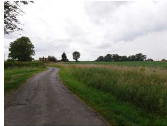
3.31 Flat tops coming along lane from Coates