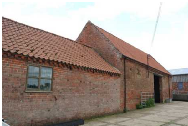
Listed building Old Barn Bransby