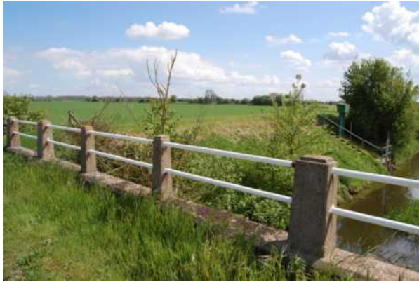
1.20 River Till looking south