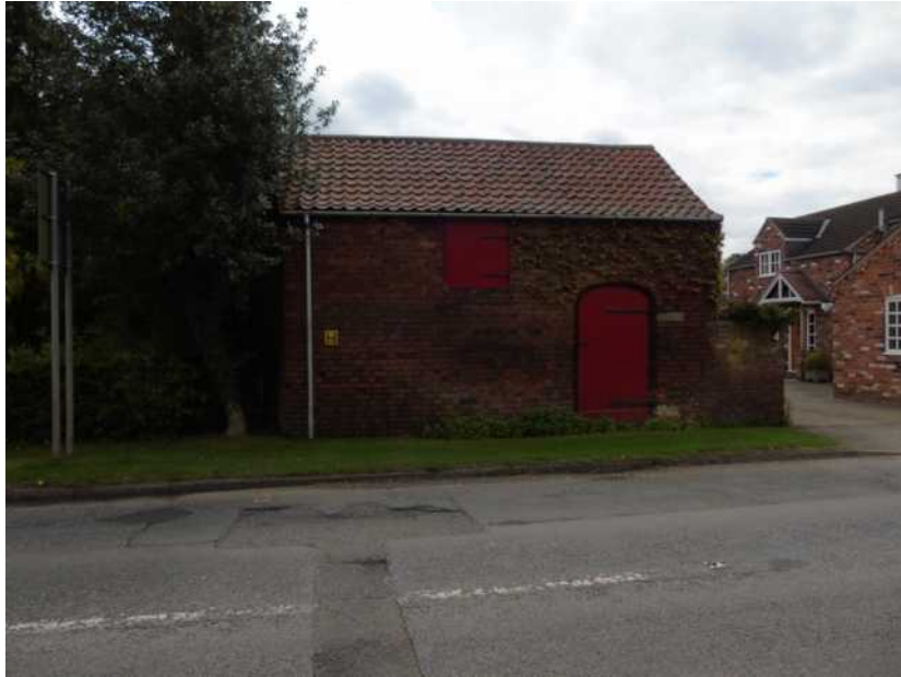
5. 19C barn