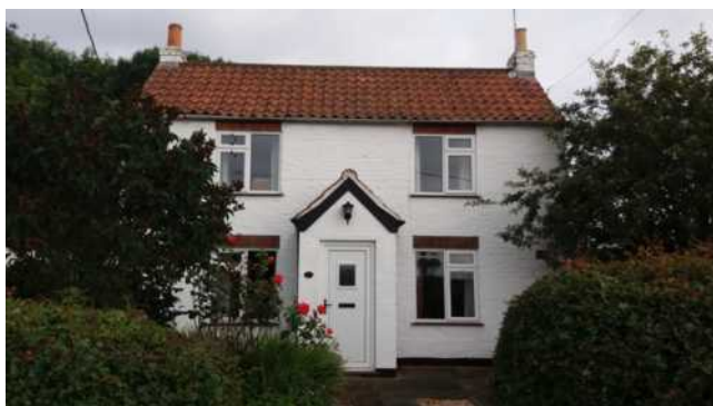
1.3 A 19th century ex farmstead