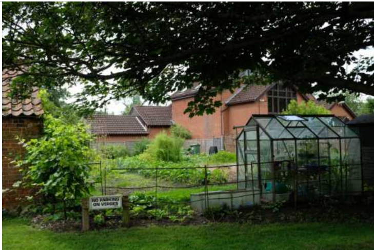
4.7 Allotments by village green