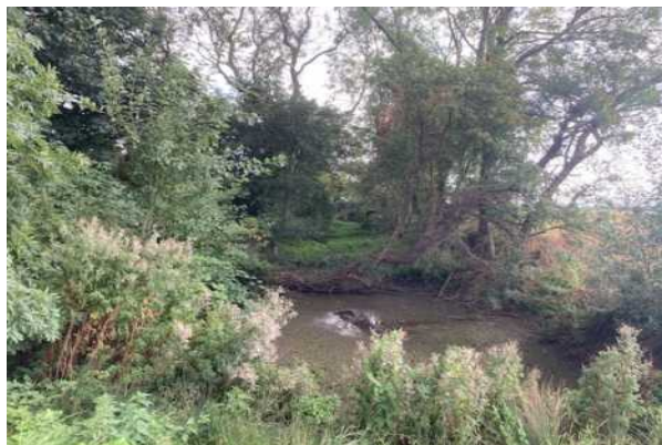
2.10 The moat is part of the scheduled monument