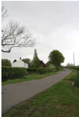
View south on Thorpe Lane from CF3