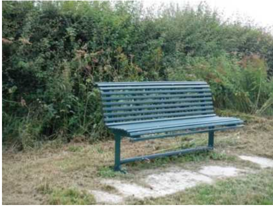
6.7 Bench at corner of Fleets Lane and Thorpe Lane