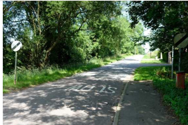
7.12 End of pavement on Ingham Road - dangerous thereafter