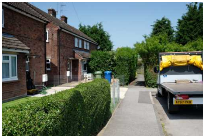
1.3 St Mary's crescent and start of footpath to Ingham Road