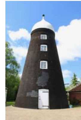
L2 Subscription Mill