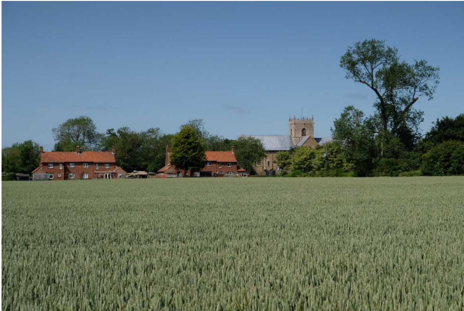
IV10 View of Stow from western branch of footpath to Sturton from Stow Park Road