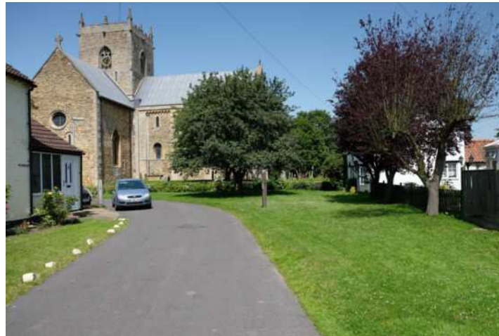
IV4.2 Village Green