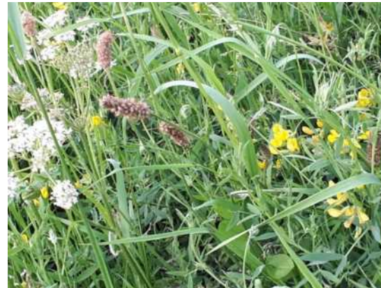
1.15 Wild flowers along Green Lane