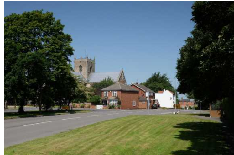
IV6.4 Stow Minster from Sturton Road