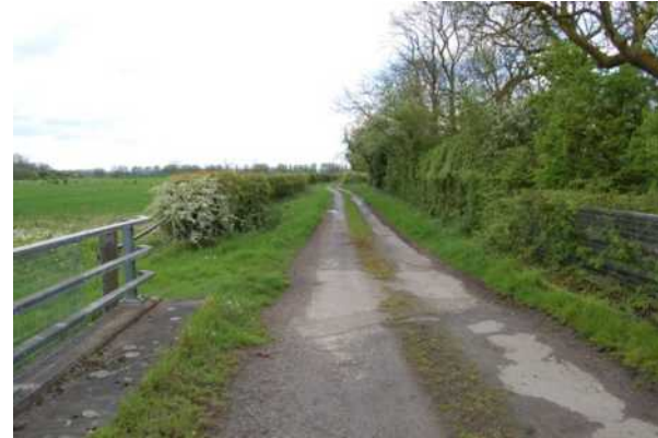
3.11 The Lane between Normanby and Coates looking in the direction of Coates