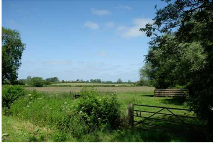
IV6.1 View NE from junction of School Lane with B1241