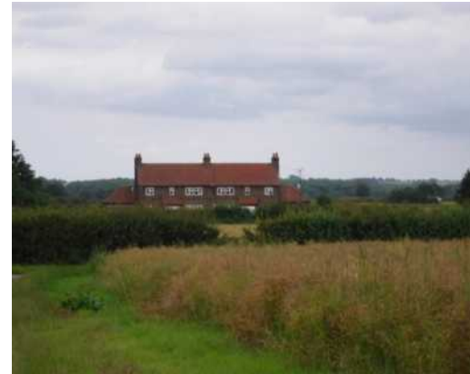
6.10 Cottages on Fleets Lane