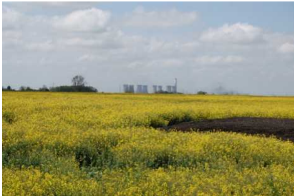
5.11 Looking west to the power station from the bridleway off Stow Park Road