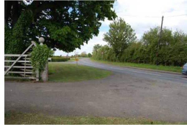
7.2 Entering Stow from Sturton by Mere House