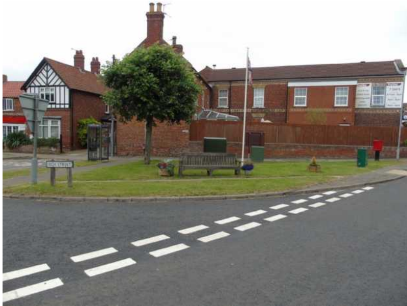
5. The village green