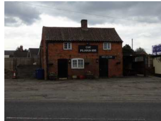
4. 18C semi-detached cottages