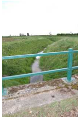
3.4 Drain from Coates - Normanby lane