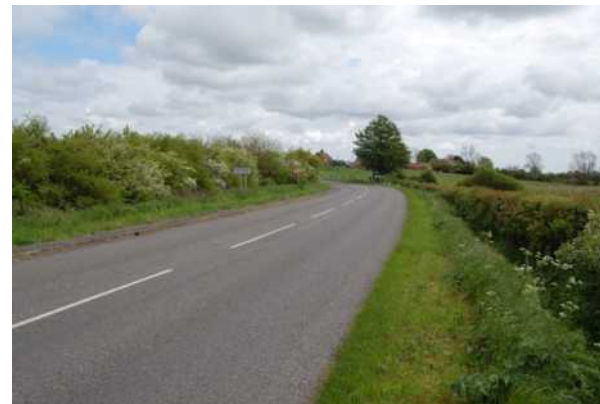
3.23 Entering Normanby from the north