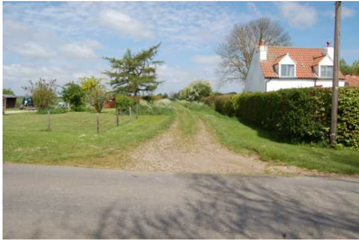
1.5 Green lane looking north from Ingham Road and between Copperfields (an 19th Century ex farmstead) and flat tops