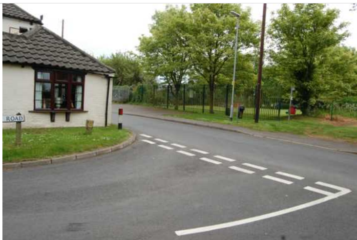
4.9 Blind corner by pub