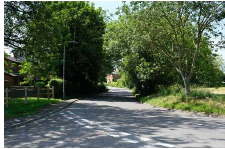
6.1 View to west from corner B1241 and School Lane