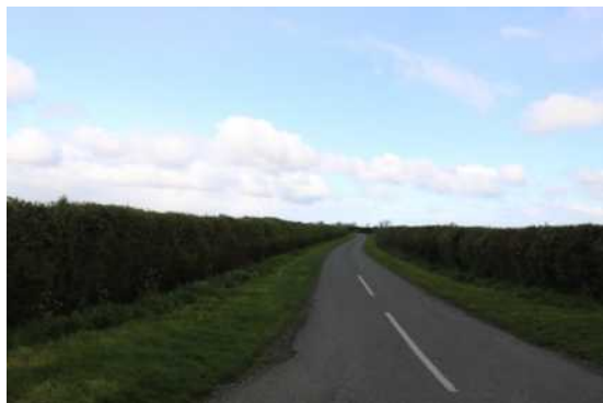
Characteristic narrow lane with wide verges and hedges