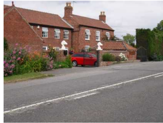
5.18 Gallows Dale farmhouse