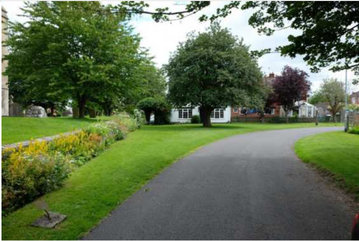
4.5 'Village Green' from west