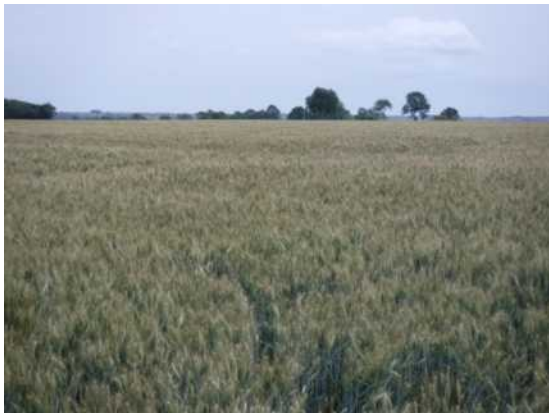
3.32 North from Coates/Normanby lane