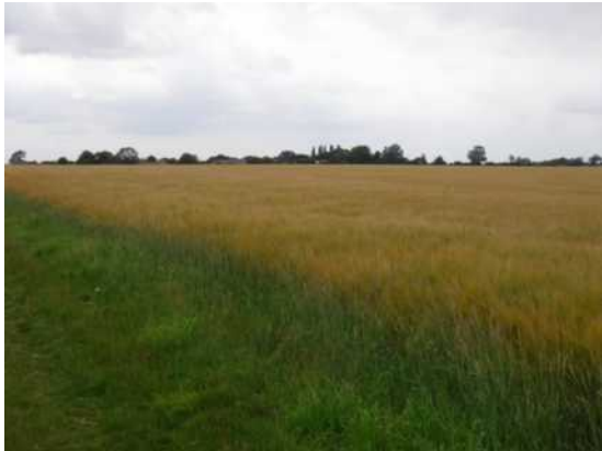
6.9 View to village from footpath off Fleets Lane