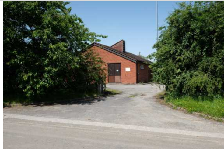
7.10 Phone exchange