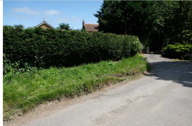
8.3 South Drive verge damaged by lorries trying to pass parked cars