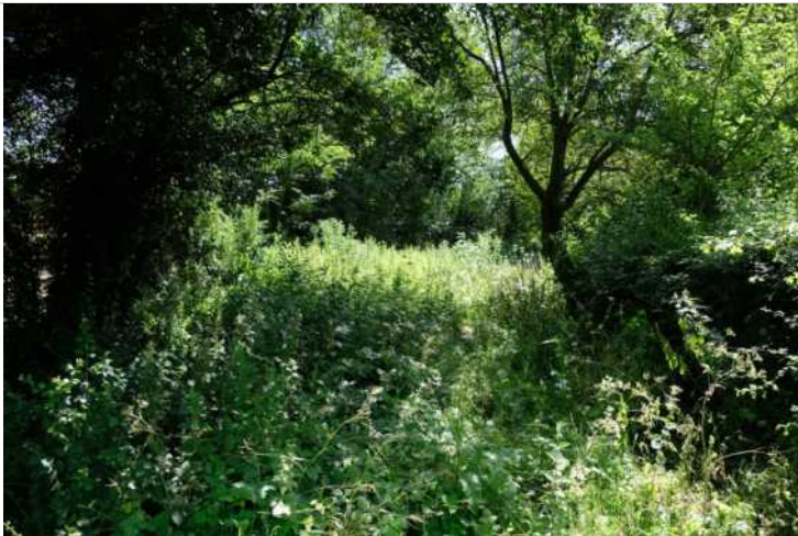
7.11 Entrance to overgrown plot off Ingham Road