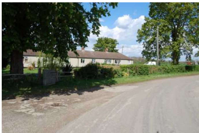
2.1 Bungalows at Coates