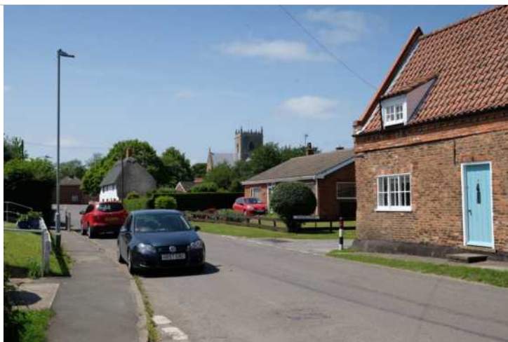
7.5 Stow Minster from junction with South Drive