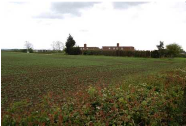
3.14 Flat tops at Normanby from the north