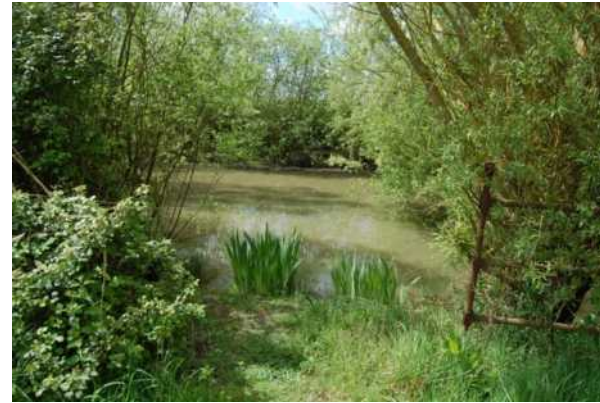
4.1 Ponds west of Church Road