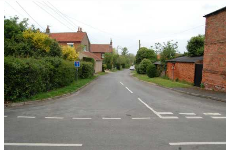
3.1 Church Road from south