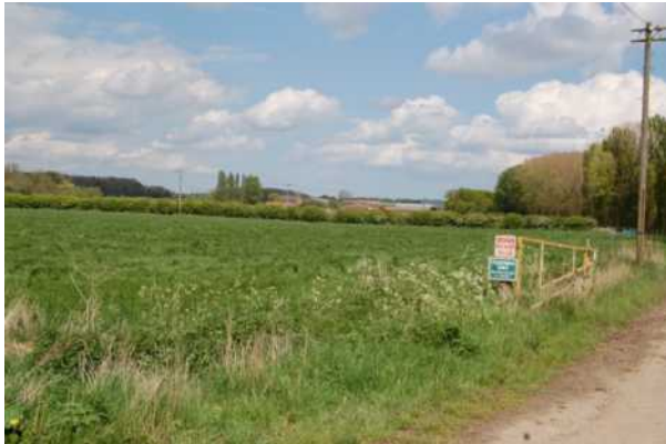
2.21 View from by St Edith's to Grange Farm