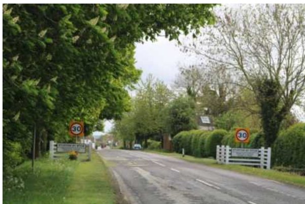
Attractive tree lined west entrance to Sturton by Stow