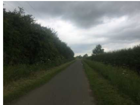
6.2 Fleets Lane 2