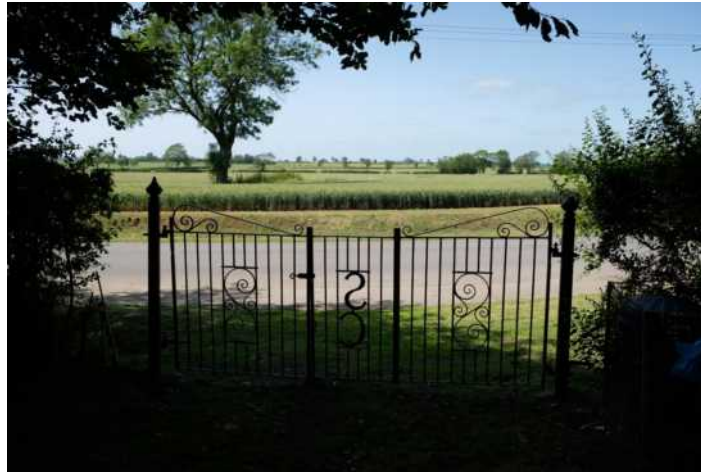
IV5.3 View of landscape beyond cemetery gate