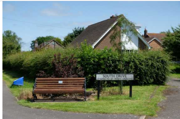
8.5 Bench on corner South Drive and Ingham Road