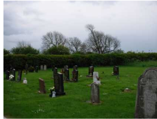
5.2 Stow Cemetery