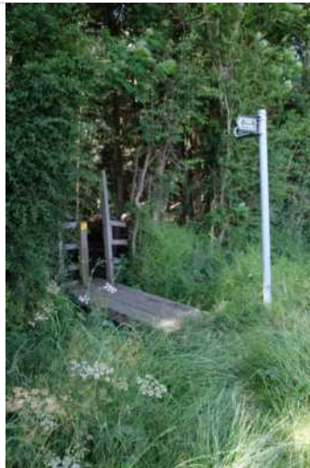
9.4 Bridge at south end of fir tree copse