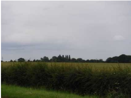
5.15 Vistas to the south of Stow Park Road