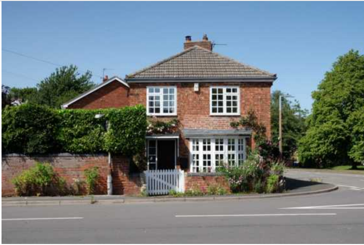
5.6 Stow Park Road no 1