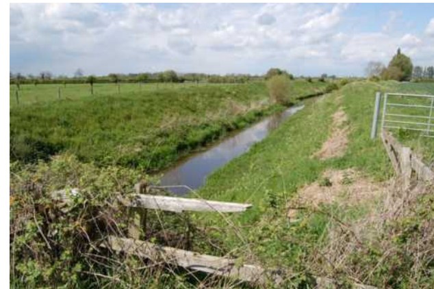
1.19 River Till looking northwards from Ingham Road