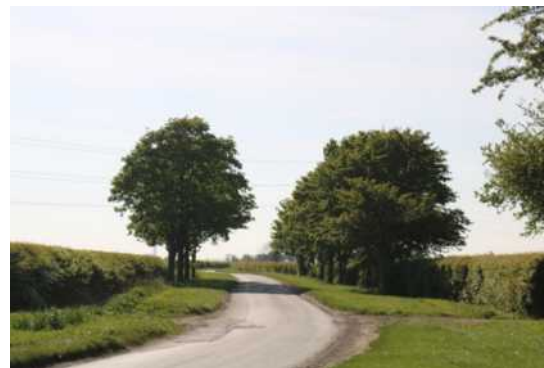
Cowdale lane to west of Bransby with wide verges and hedges and standards