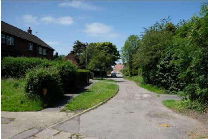
8.1 South Drive looking north