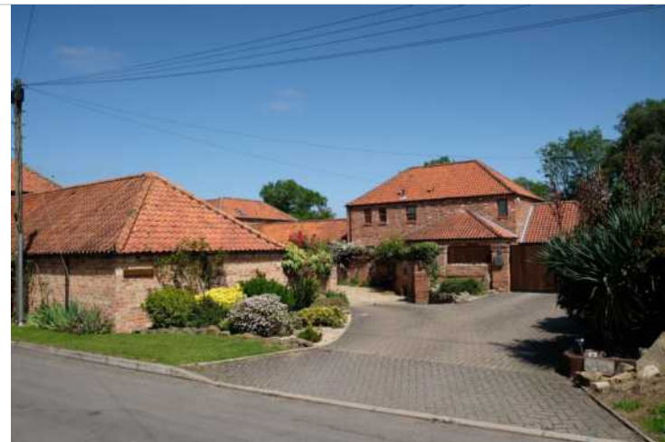
3.3 Barn conversions on Church Road