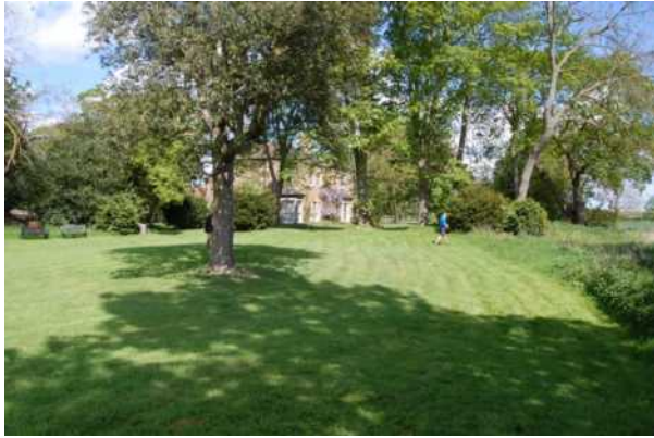
2.3 Coates Hall