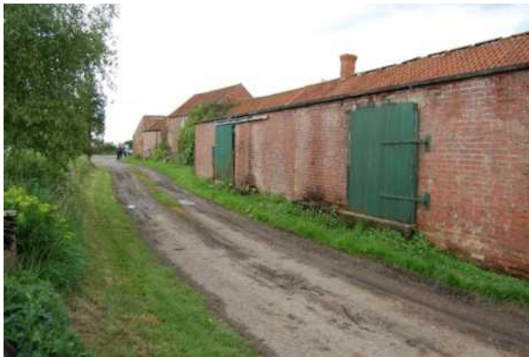
3.20 Lane and Farm buildings (higher roofed building was the dairy) to side of West Farm