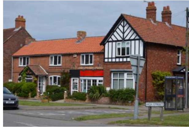
2. 19C terrace including Tillbridge Tastery