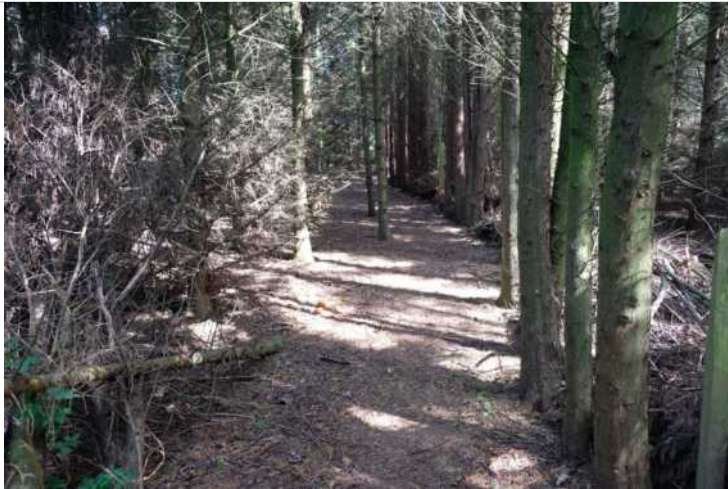
9.2 Footpath from Ingham Road passing through copse