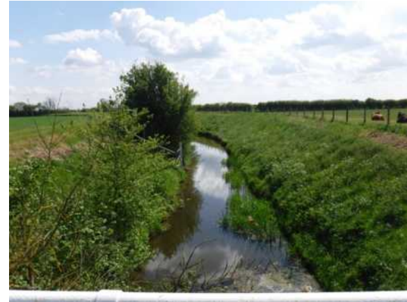
1.21 River Till from Ingham Road