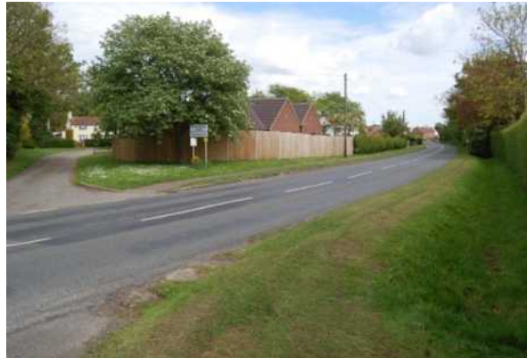
7.3 View towards Sturton by Mere House