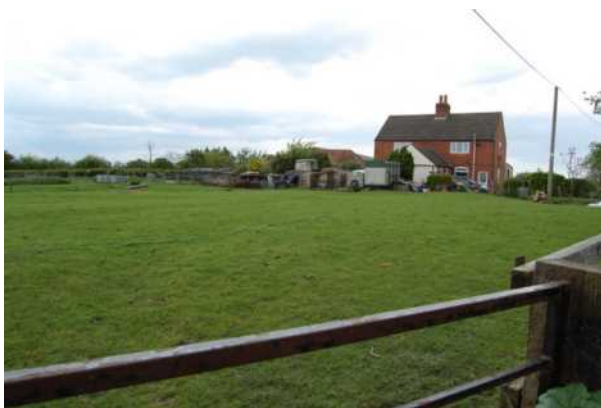
3.22 Rear of cottages Normanby and area of deserted medieval village