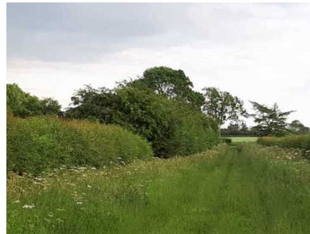
1.10 Green Lane off Ingham Road