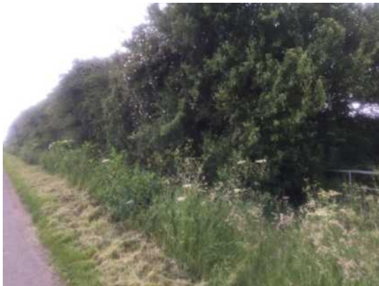
6.1 Fleets Lane