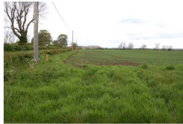
3.15 East Farm from near the flat tops