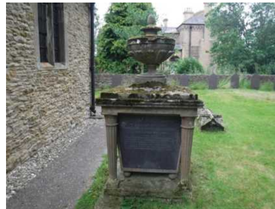
2.12 The Maltby Family Monument