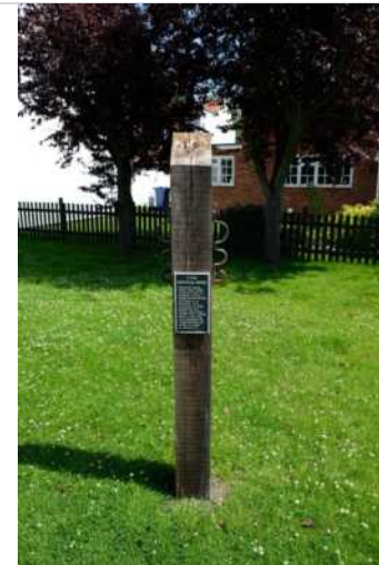
4.8 The Whipping Post on the village green