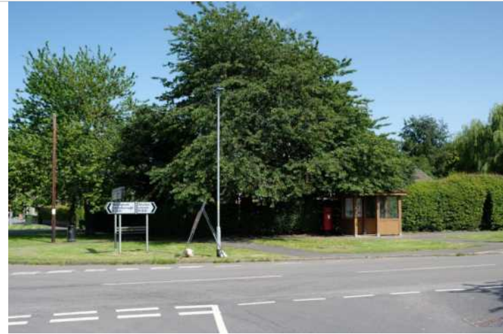
6.3 SE corner of cross roads