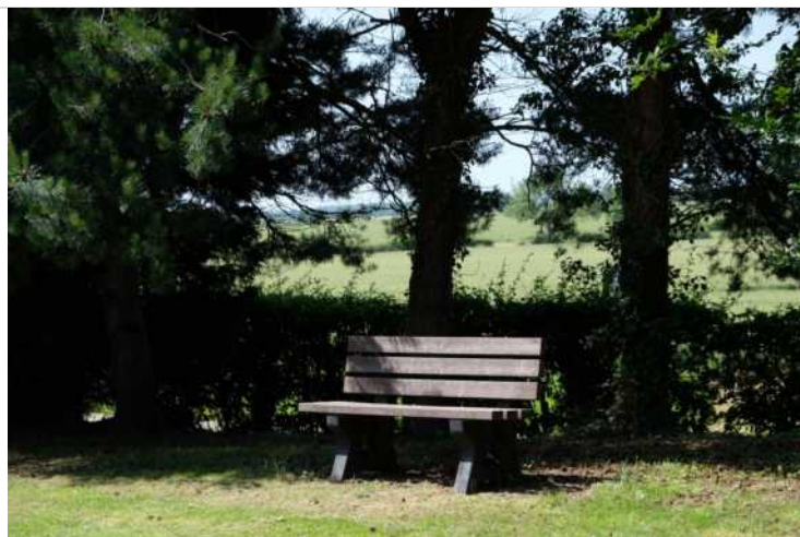
5.4 Bench in cemetery