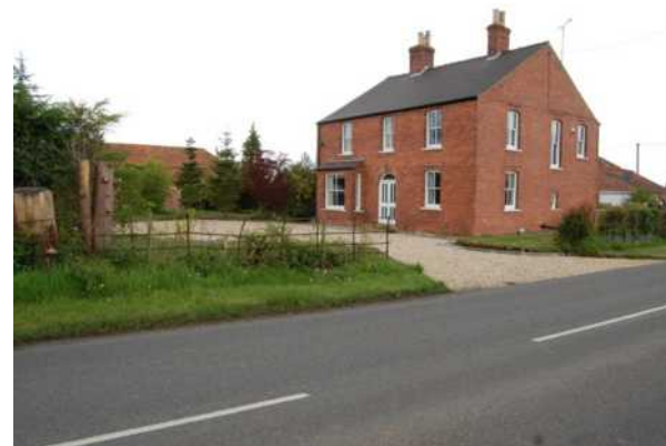
13.17 West Farm, Normanby