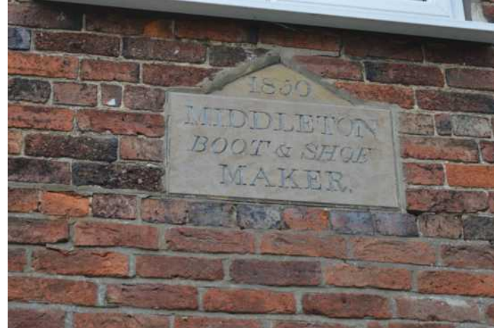
6. The old shoemaker shop