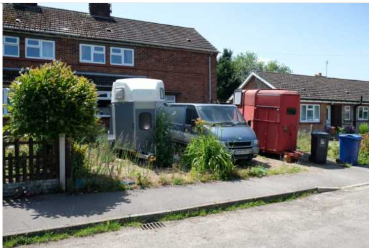
8.6 Untidy garden on South Drive