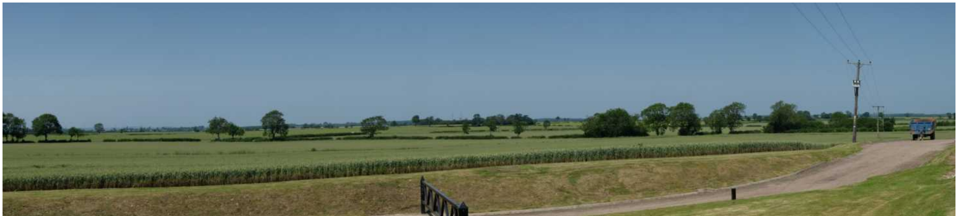
IV5.2 View to west from corner of Manor Farm