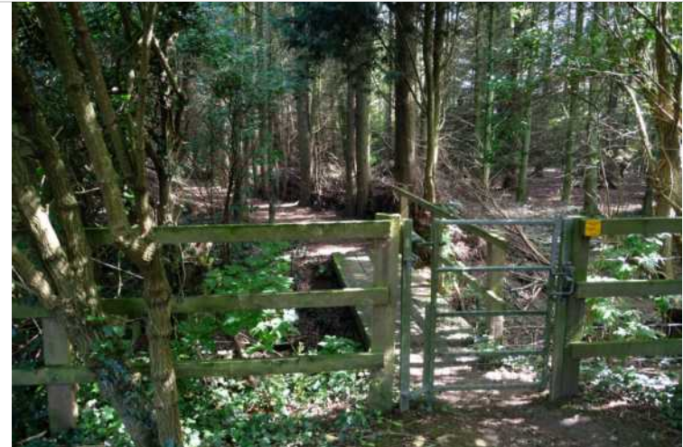
9.3 Gate and bridge entering copse from north