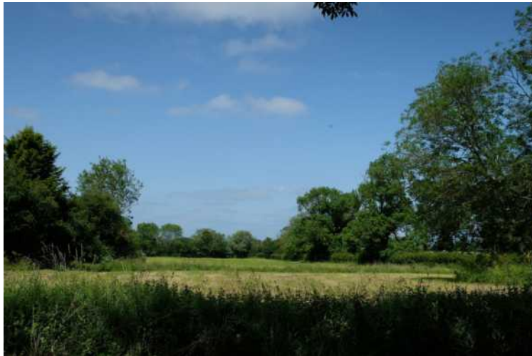
IV6.3 Pasture by B1241 opposite Church Lodge