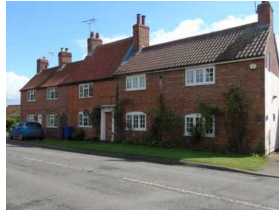
2. 18C terrace with Malthouse