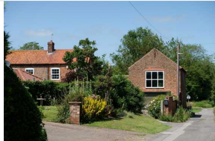
2.2 The Old School on School Lane