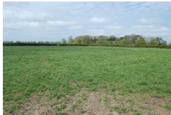
2.16 Coates medieval village site