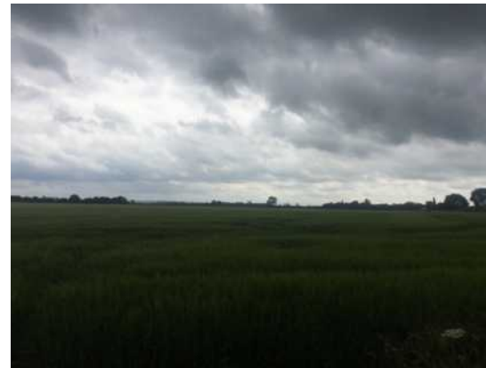
6.6 View from Fleets Lane