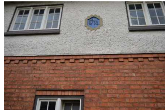
8. 1911 detached house with mid-point cogging