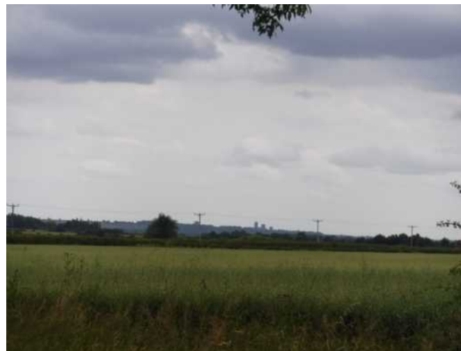
1.25 Across the fields with the Cathedral in the distance