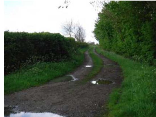
3.5 Green Lane from the Till