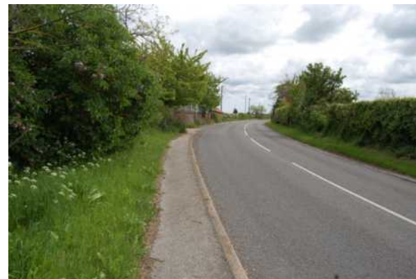
3.25 Entering Normanby (East Farm on the left) from the north on B1241