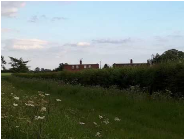
1.7 A view of the flat tops from Green Lane