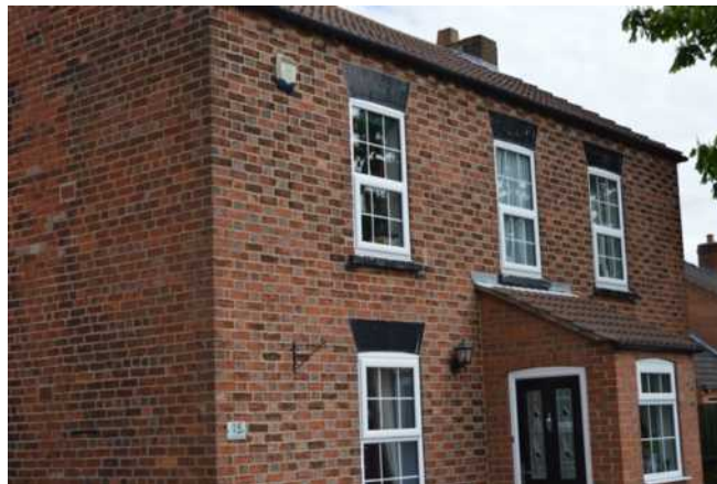
3. Newly constructed house with period characteristics