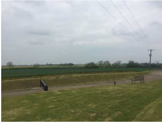
5.5 Towards the Trent from Manor Farm