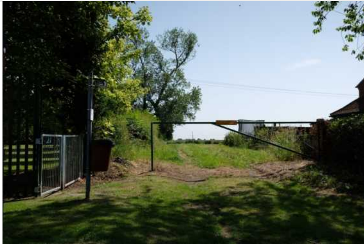
10.1 Start of footpath from Stow Park Road south towards Sturton