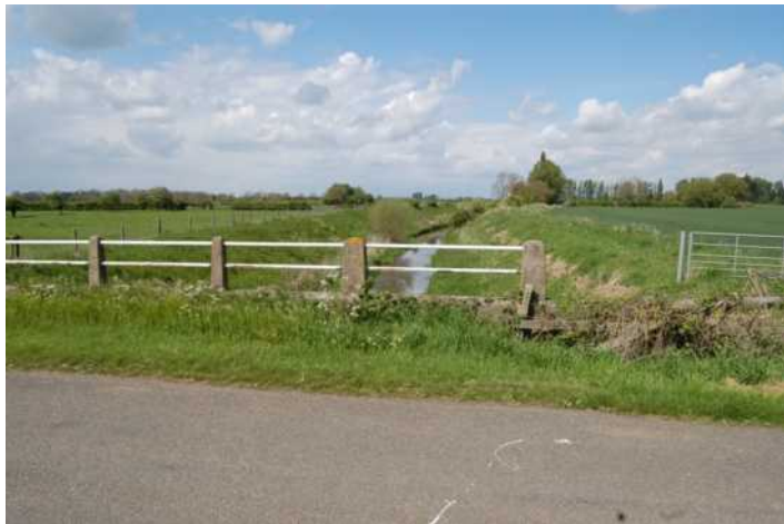
1.18 Squire's Bridge looking over the Till