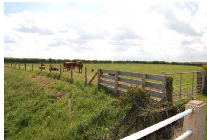
1.12 Across the fields from Green Lane