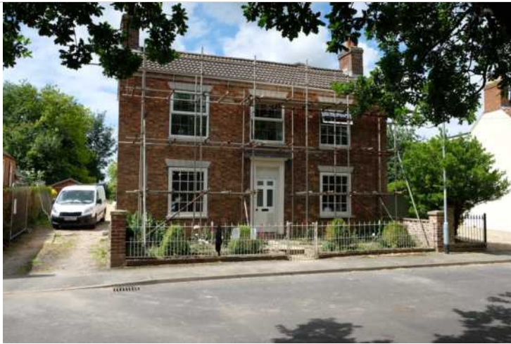
6.6 Listed 6 Sturton Road