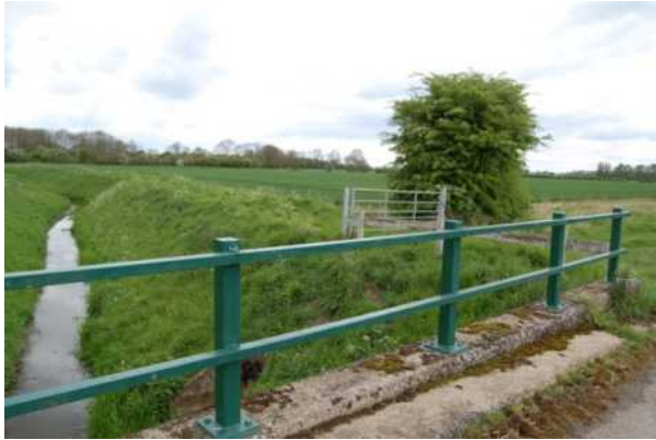
3.2 Till drain looking north