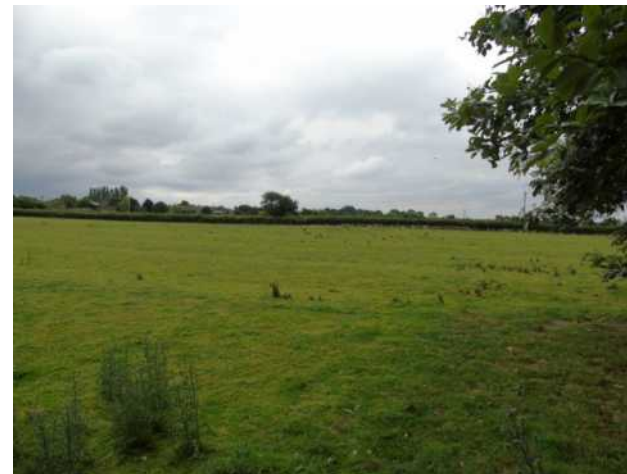
Non-designated heritage asset ridge and furrow field South