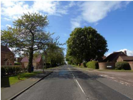
Street scene showing mature trees