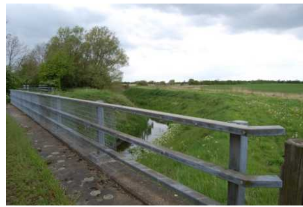
3.9 The Till from the Coates - Normanby lane