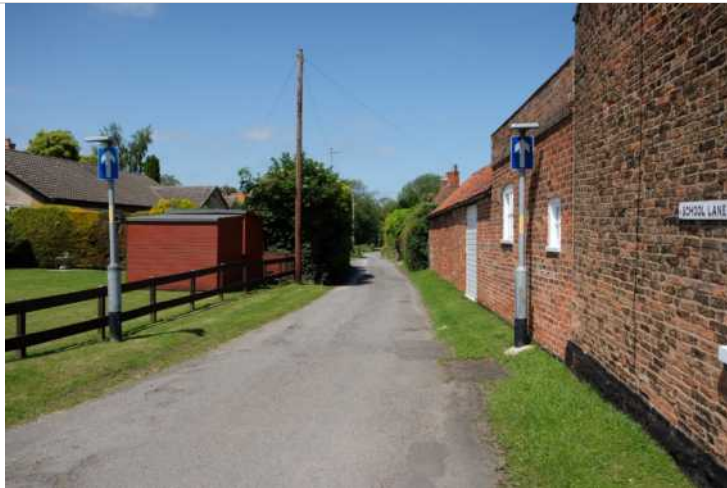
2.1 School Lane from south end