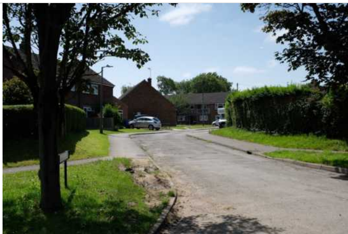
1.1 St Mary's Crescent from South Drive