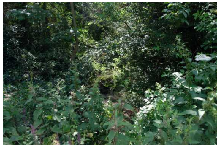
5.1 Moat round Manor Farm