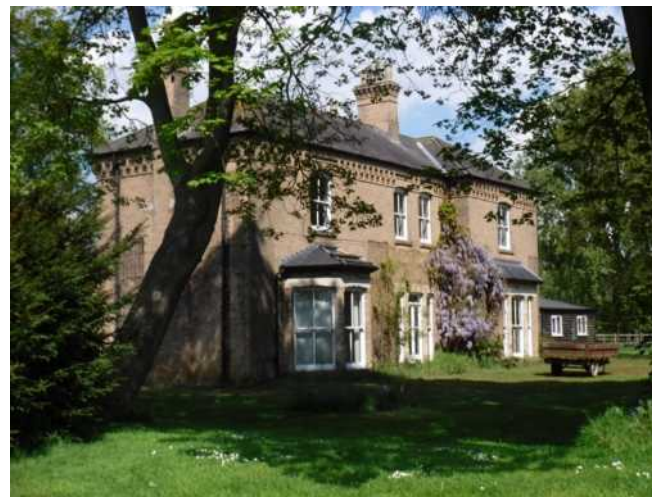
2.2 Coates Hall