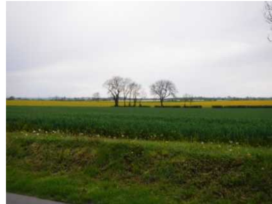
5.12 View from Stow Park Road across the fields