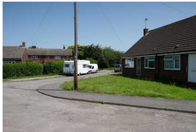
1.2 St Mary's Crescent looking east