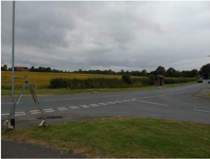
13. Open countryside to the West of the village