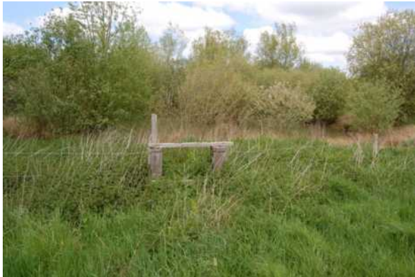
4.2 Area by ponds on west side of Church Road