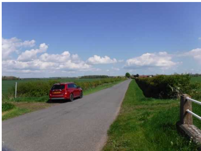
1.24 Towards the village from the River Till