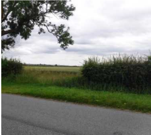
1.16 Across the fields towards the Ridge