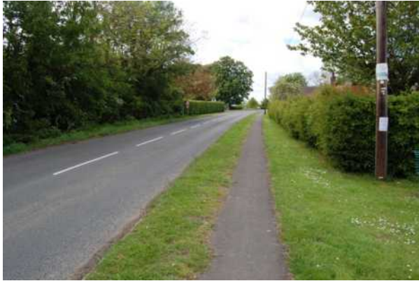
7.1 Entering Stow by Capps Island on B1241