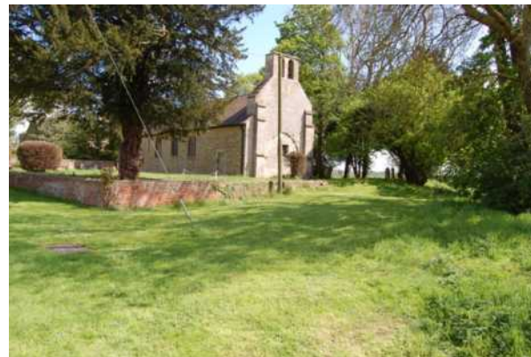
2.8 St Edith's with medieval moat to foreground