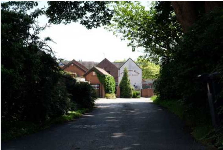
4.2 Cross Keys pub from west door of Stow Minster