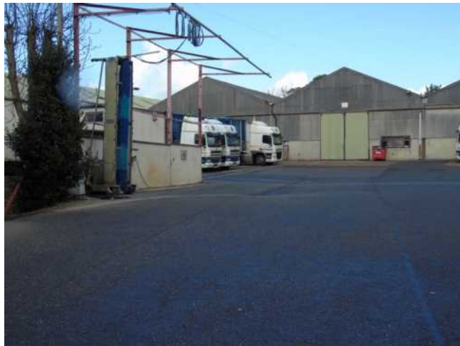
11. Entrance to Bradshaw's depot