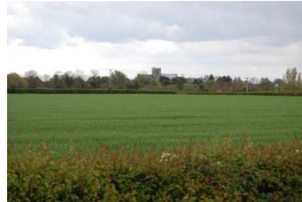
3.29 View from Normanby looking down to Stow Minster