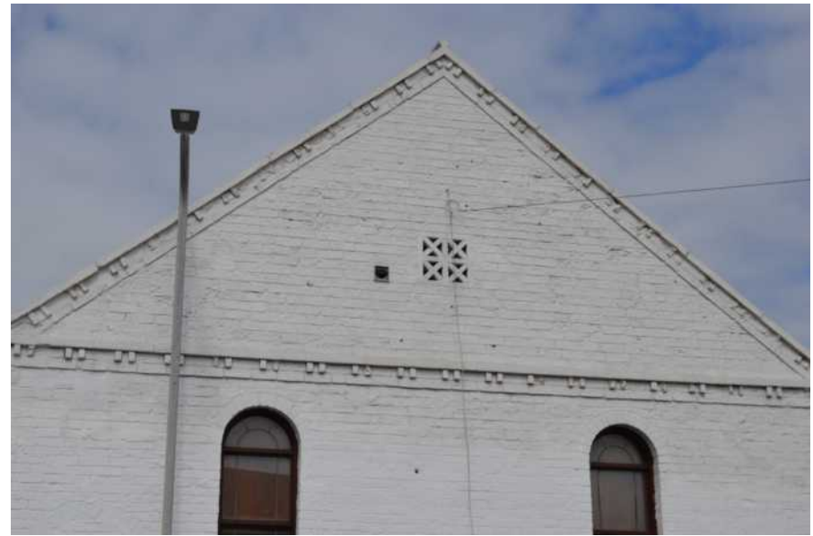
6. 19C former chapel