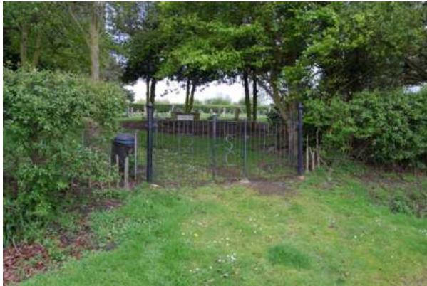
5.1 Entrance to the cemetery