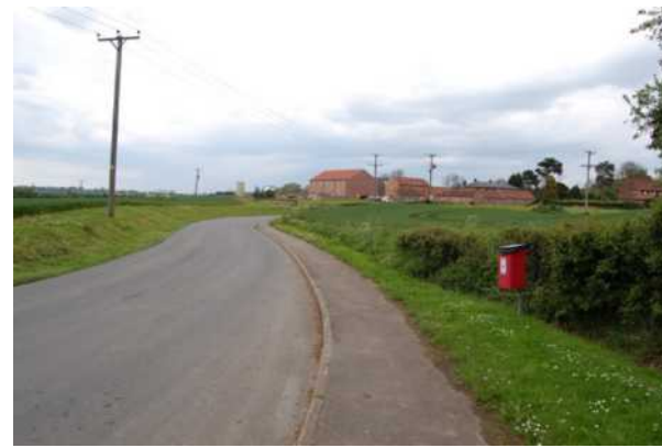
5.6 Entering Stow from west