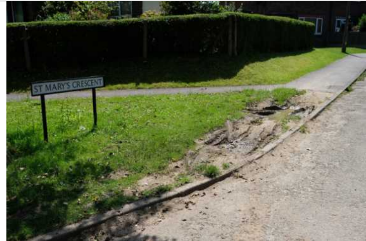
1.6 Damaged verge on St Mary's Crescent