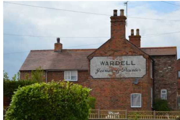
Former business premises. 18C house with extension