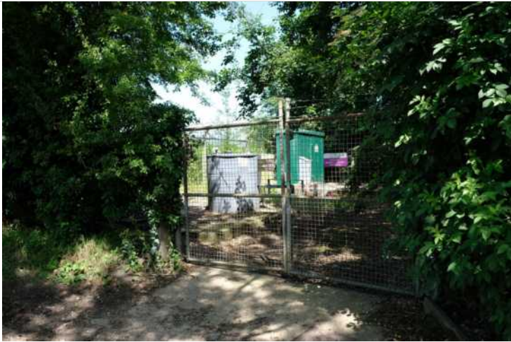
3.4 Sewage pumping station on Church Road