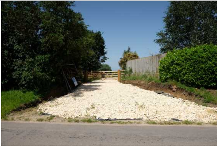
7.9 Entrance to new development to north of Ingham Road