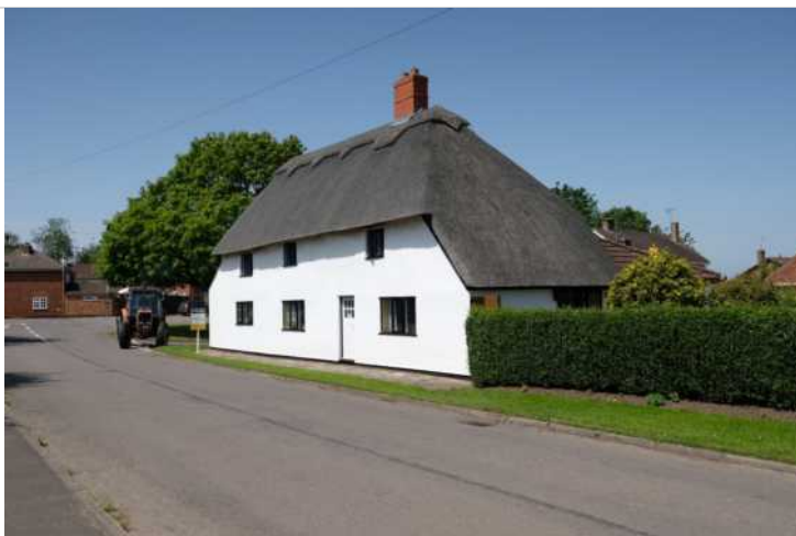
7.7 Thatched Cottage on Ingham Road