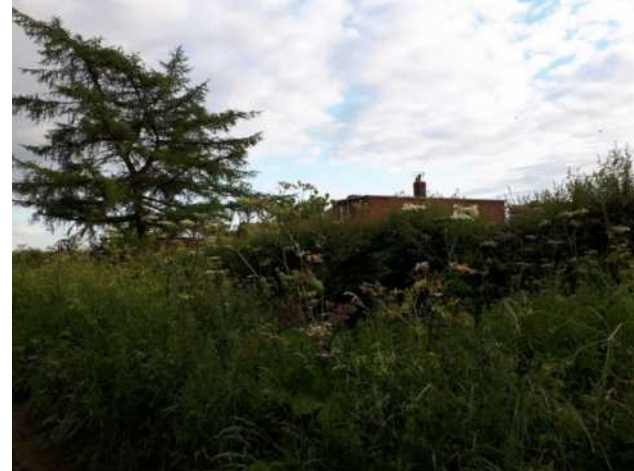
1.6 Green Lane towards flat tops