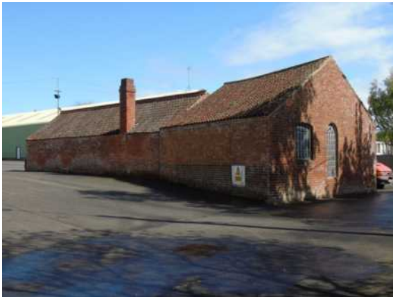
7. The old Quaker meeting house - Grade II listed