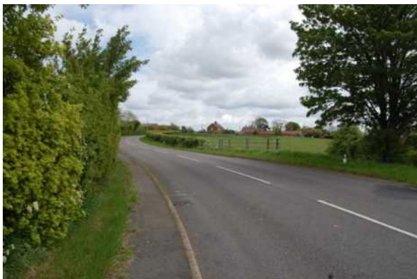
3.24 Entering Normanby from Willingham on B1241