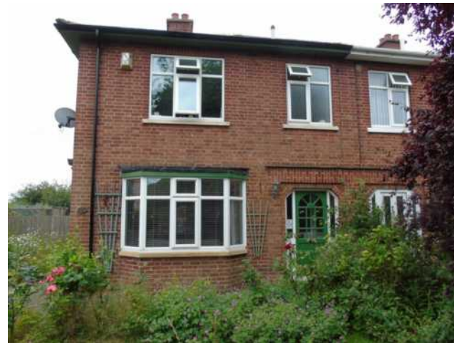
1939 red brick semi-detached house