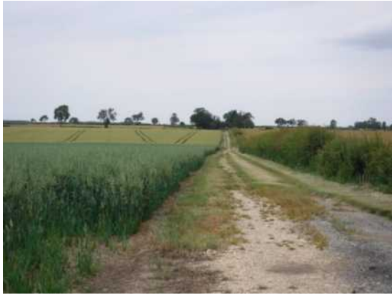
5.13 North from Stow Park Road