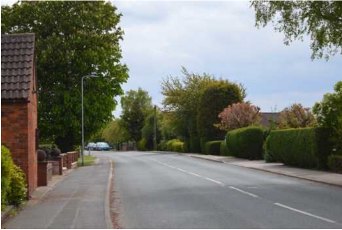
1. Street scene Saxilby Road