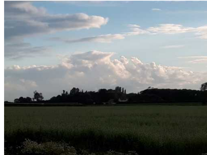
1.13b View from Green Lane across the fields