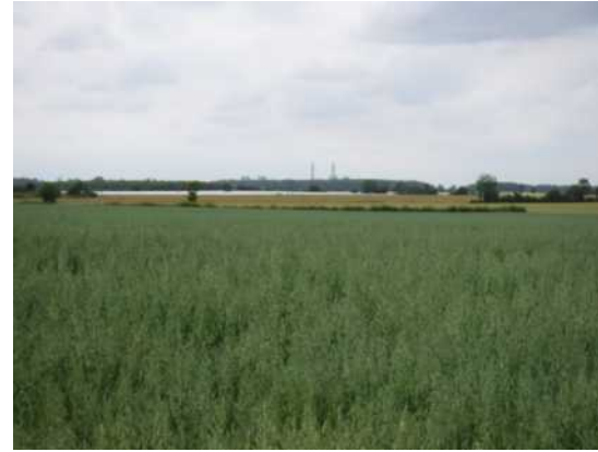
5.14 North from Stow Park Road (solar farm in background)