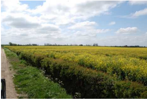
5.9 Looking south along bridleway towards Stow Park Road