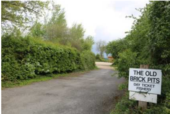
IV1 Home Farm Bransby