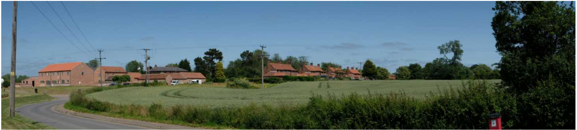
IV5.1 View east from corner by cemetery