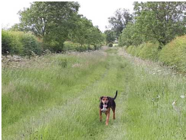
1.9 Green Lane from Ingham Road