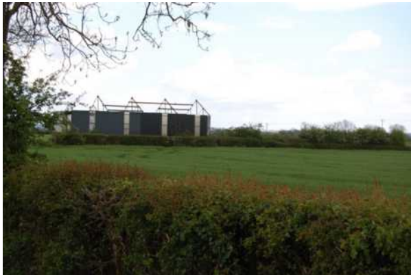
3.12 Burnt out barn on lane near Normanby