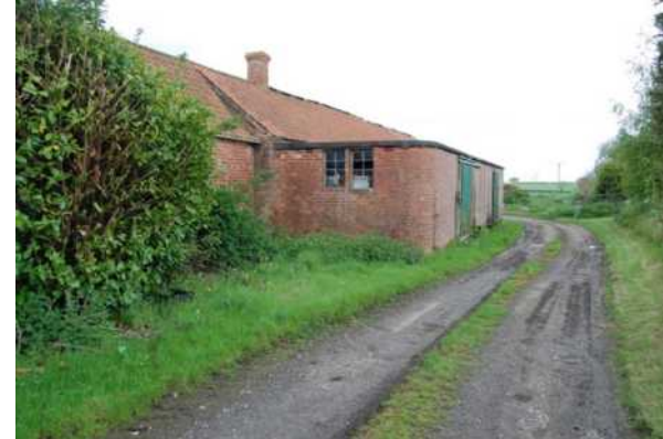
3.19 Farm buildings including 'meal house' (grinding corn for the cattle) to west of West Farm