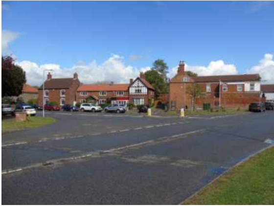
1. Street scene core area