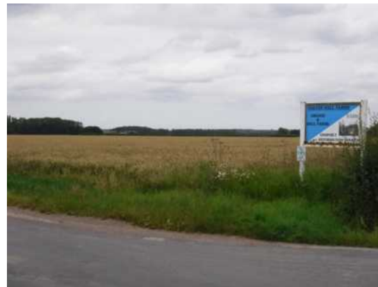
2.18 Across to Coates from Ingham Road