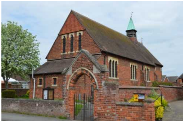
3. St Hugh's Church - Grade II listed