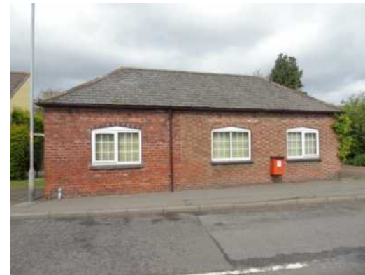
4. The old school