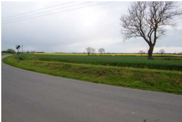
5.7 Leaving Stow by the cemetery