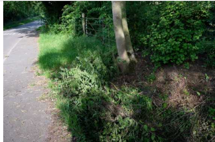
7.2 Blocked ditch opposite telephone exchange on Ingham Road