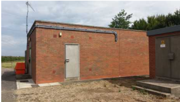
5.17 The electricity sub-station on Stow Park Road