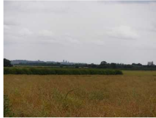
6.8 The Cathedral from footpath off Fleets Lane