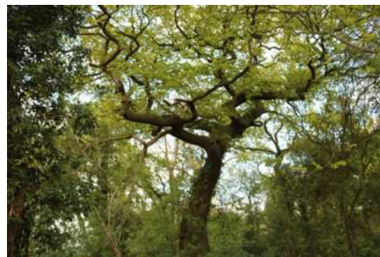
Oak in L7 West Lawn