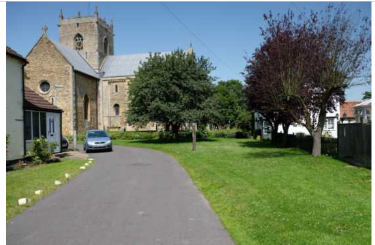
4.4 'Village Green' communal area