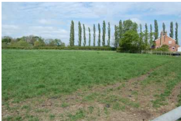
2.15 Coates medieval village site and Grange Farm