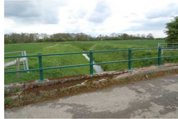
3.3 Drain on Coates to Normanby back road