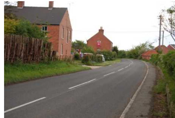
3.21 West Farm, cottages and East Farm