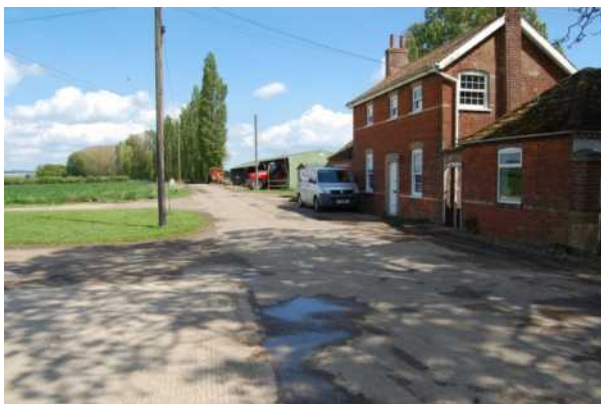
2.13 Groom's Cottages, Coates