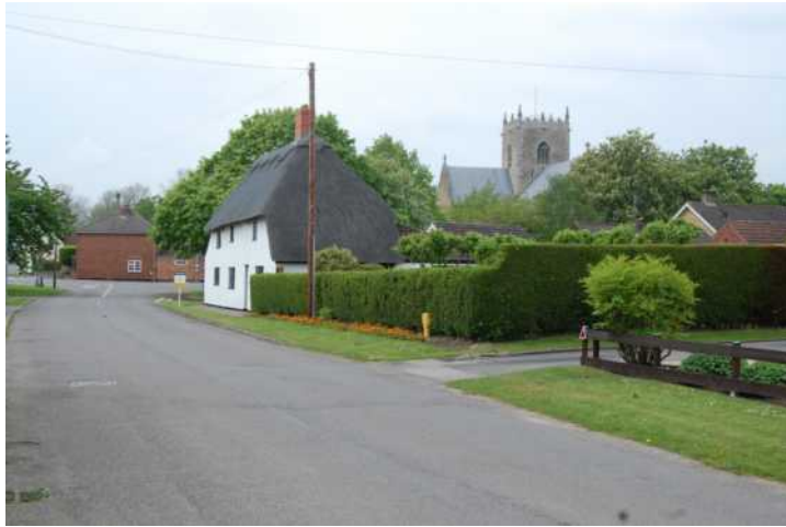
IV1 Stow Minster and Thatched Cottage