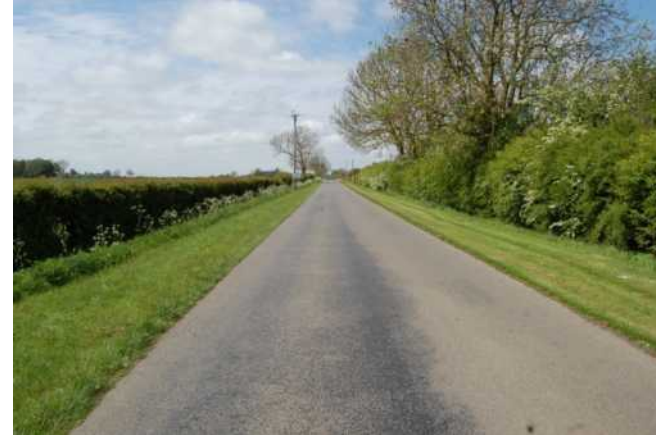
1.17 Approach to Stow on Ingham Road as you approach the village sign