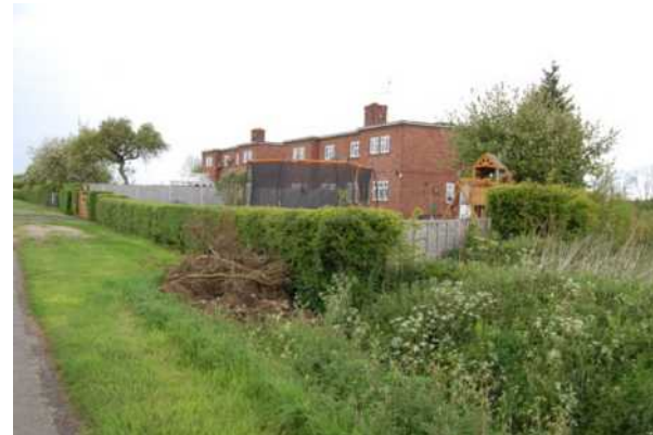
3.13 The flat tops, Normanby