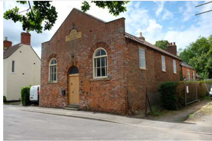
6.7 Listed Converted Wesleyan Chapel