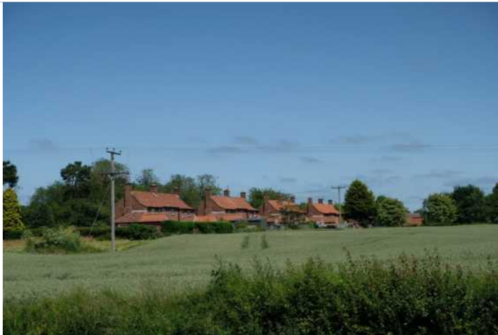
5.8 View of Stow from corner by Cemetery