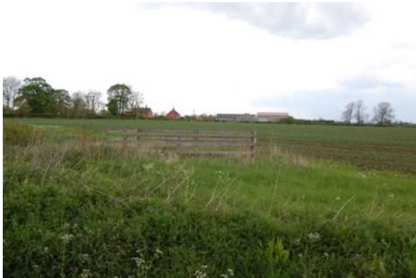
3.16 East and West Farms from the flat-tops