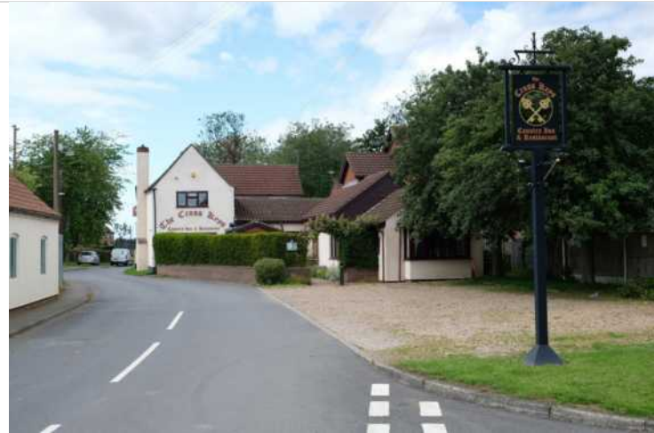
5.7 Cross Keys pub