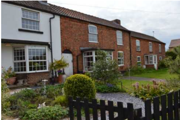
18C row of former shops inc blacksmith