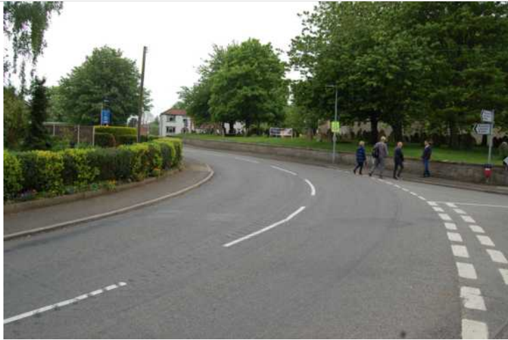
6.2 Bend and invalid crossing made dangerous by hedge