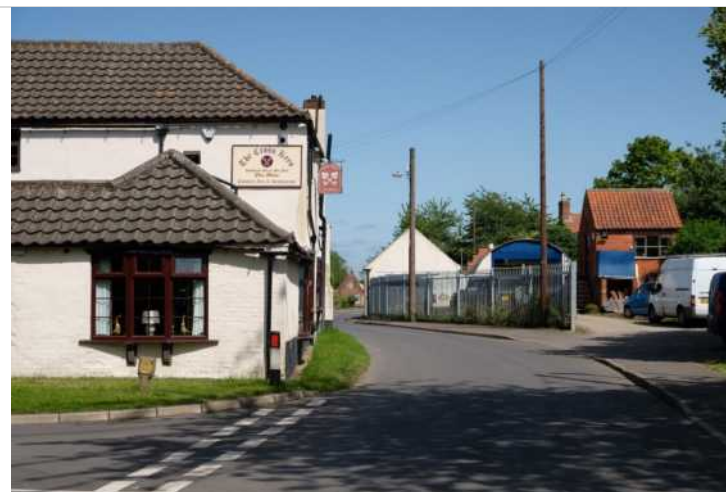
5.5 View past pub to Williams Garage