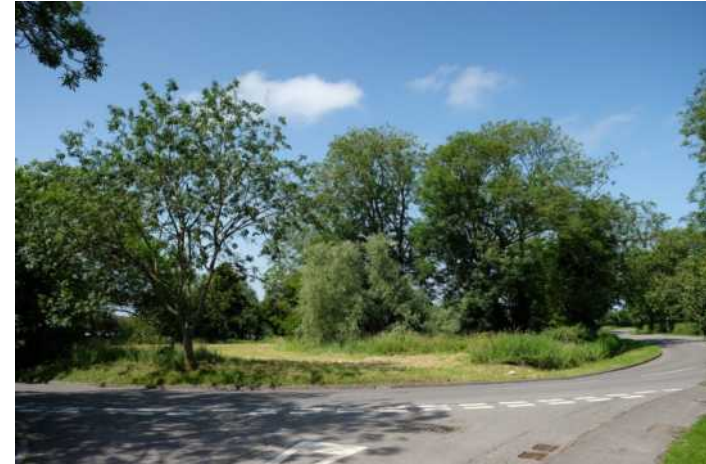
IV6.2 Pasture from north end of School Lane