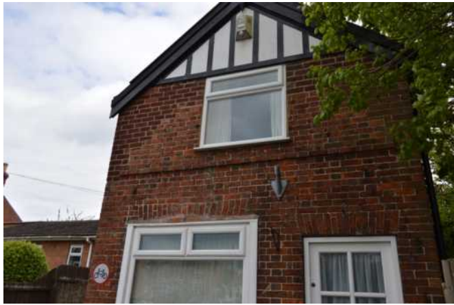
9. The old post office