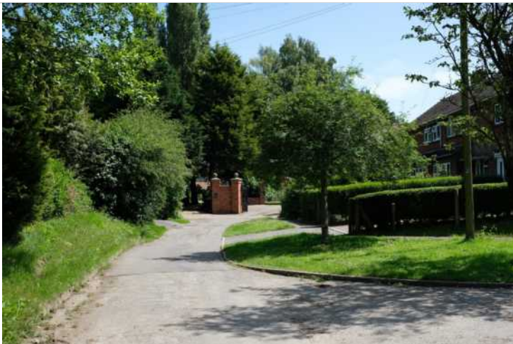
8.4 South Drive facing south from corner with St Mary's Crescent