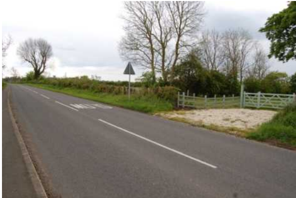
3.28 Looking to Stow Minster from Normanby