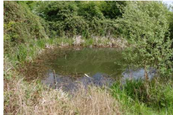
4.3 Pond west of Church Street