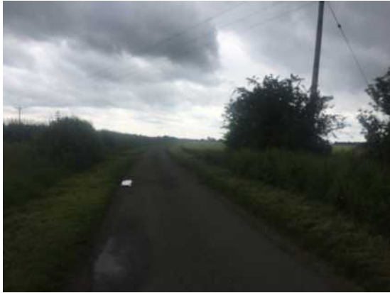
6.3 Fleets Lane 3