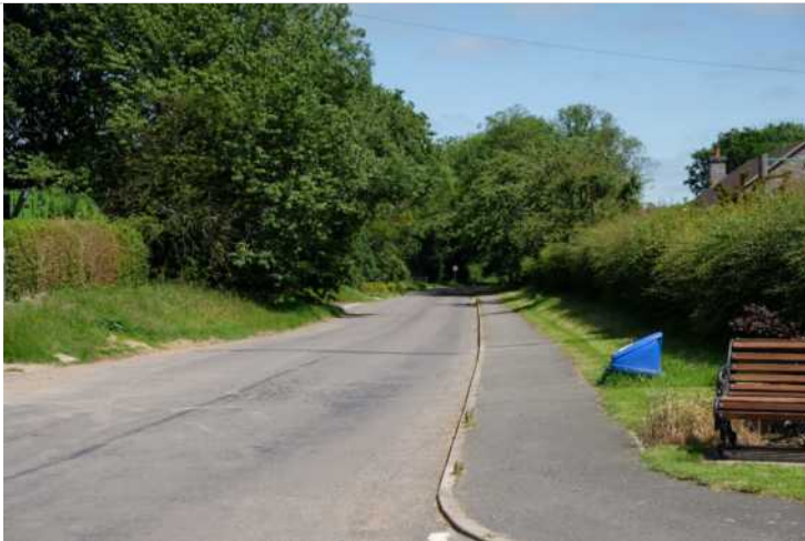
7.1 Ingham Road from corner with South Drive