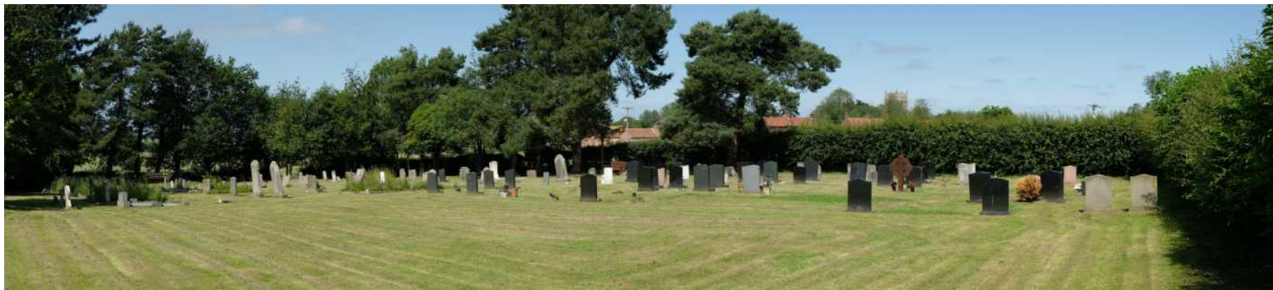
5.3 Stow Cemetery