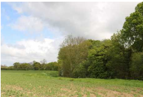
L7 West Lawn medieval deer park boundary