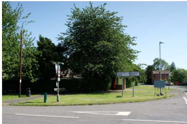
6.4 Wide areas of green in centre of Stow, but ugly signage