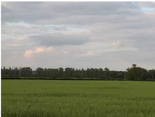
1.11 View from Green Lane