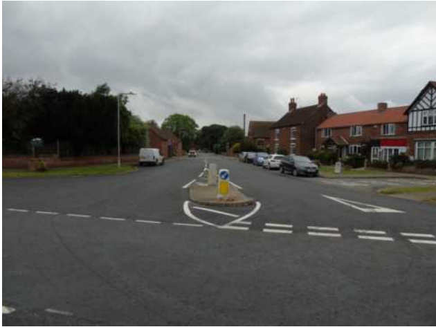
1. Street scene from junction with Marton Road