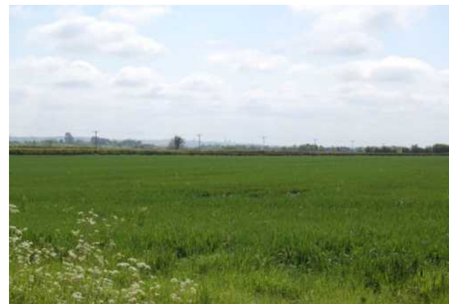
1.4 View south from Ingham Road with Cathedral in the distance