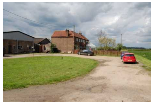
2.14 Farm Cottages at Coates