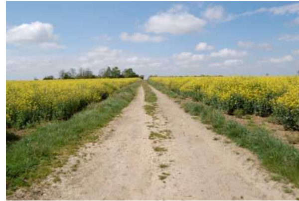
5.10 Looking west from bridleway along farm track