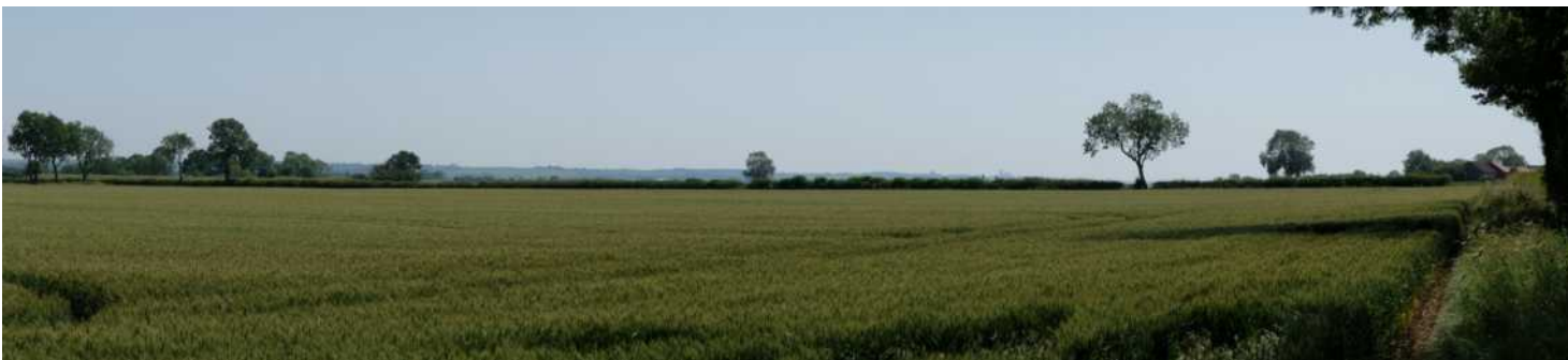
IV9.1, 9.2 and 9.3 Views south, east and north respectively as path emerges from copse onto field