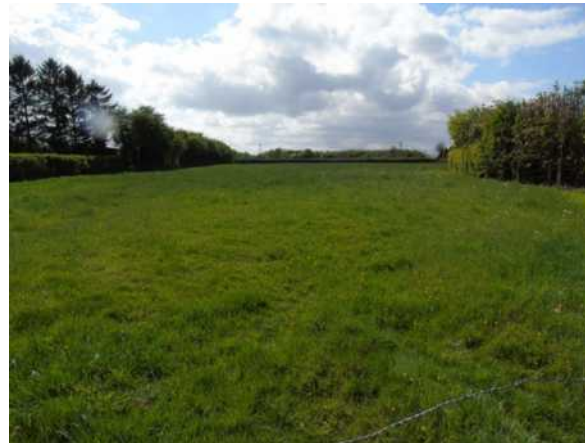
15. Green space pasture field