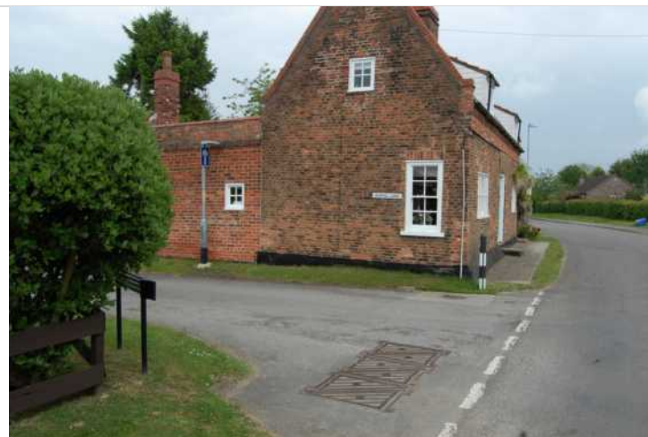
7.6 Ingham Road no 9