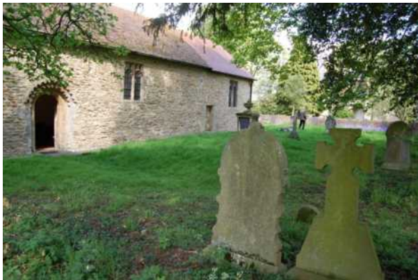
2.11 Graveyard St Edith's