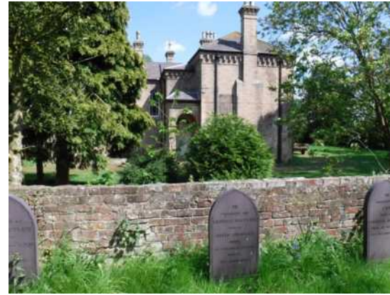
2.4 Coates Hall from St Edith's