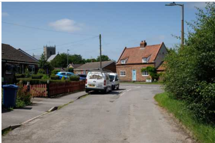
8.8 South Drive facing north