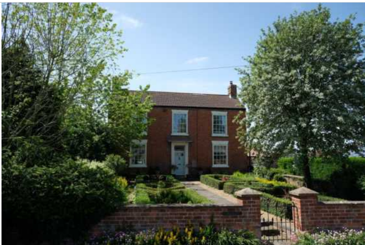
3.2 Belle Vue Farm on Church Road