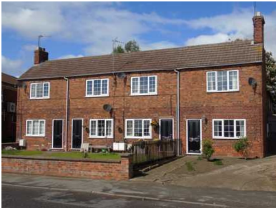
3. 19C terrace