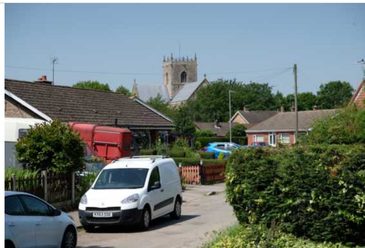
8.7 View of Stow Minster from South Drive