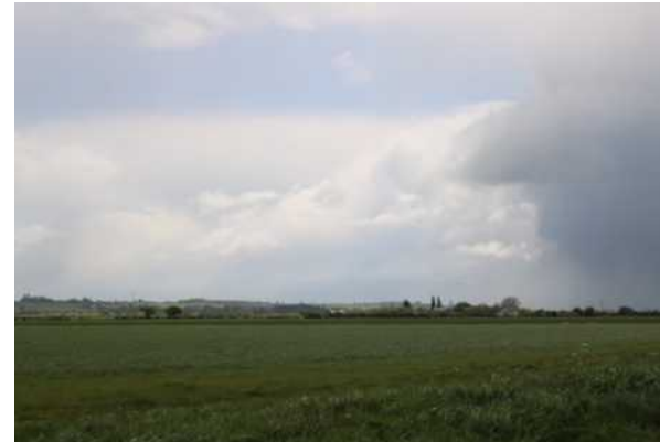
IV3 View towards Lincoln Edge and cathedral