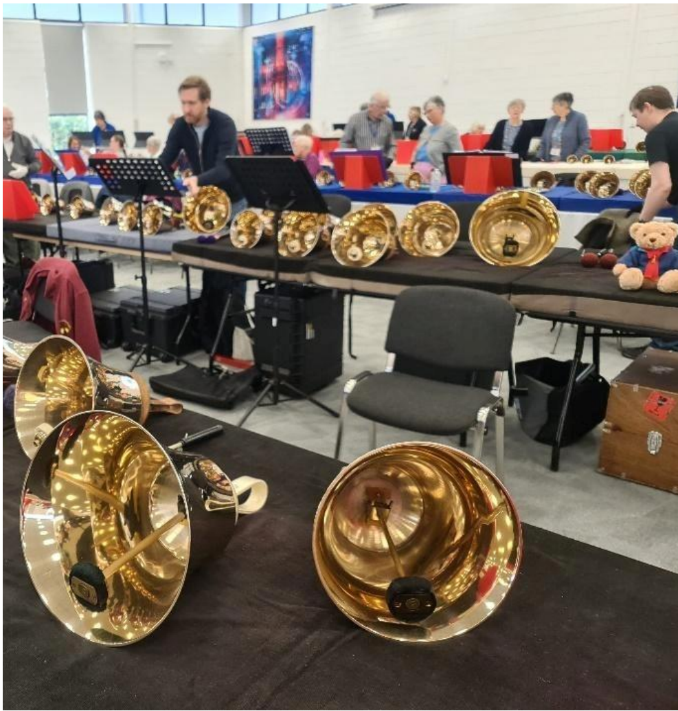
Some BIG bells ready for massed ringing

The highlight of the weekend was the massed ringing on Sunday morning. We had prepared three pieces of music, all arranged and then conducted by SW members. After lunch we helped clear away and set off for home.