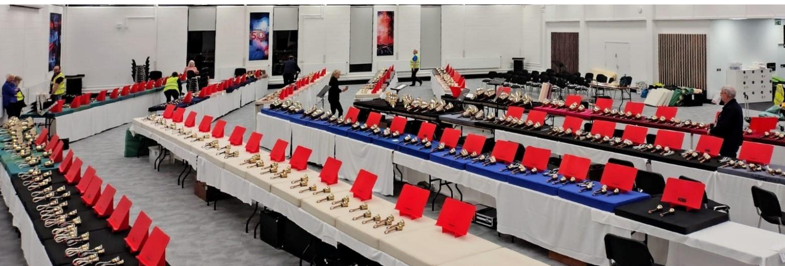
The room set ready for massed ringing Anyone in Hi-Viz is from the SW Team