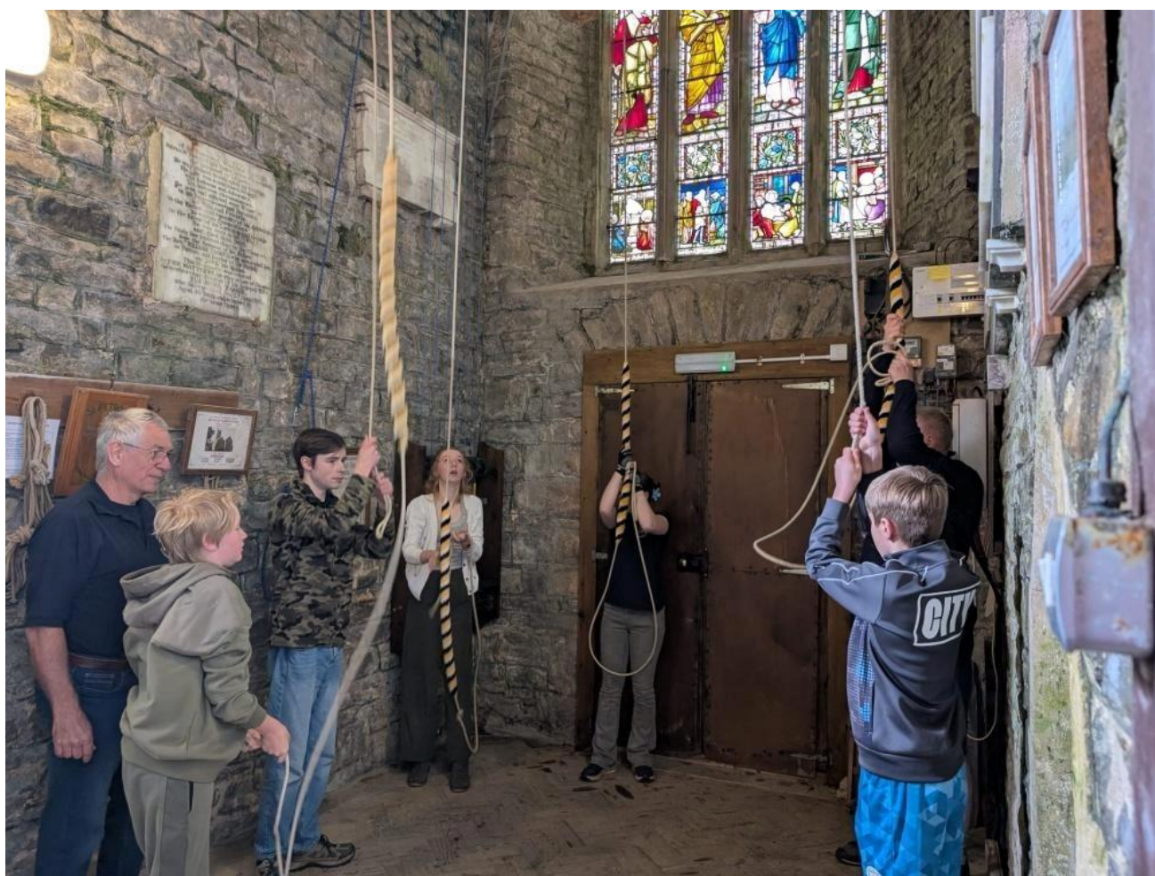
St James Iddesleigh and our Youth Team in Action