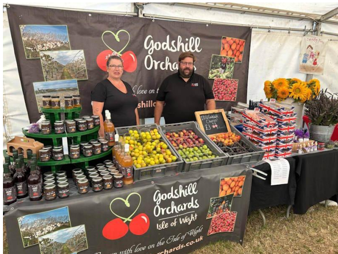
Godshill Orchards at the Chale Show

Finalists – IOW Fudge Company, IW Deer Farm.